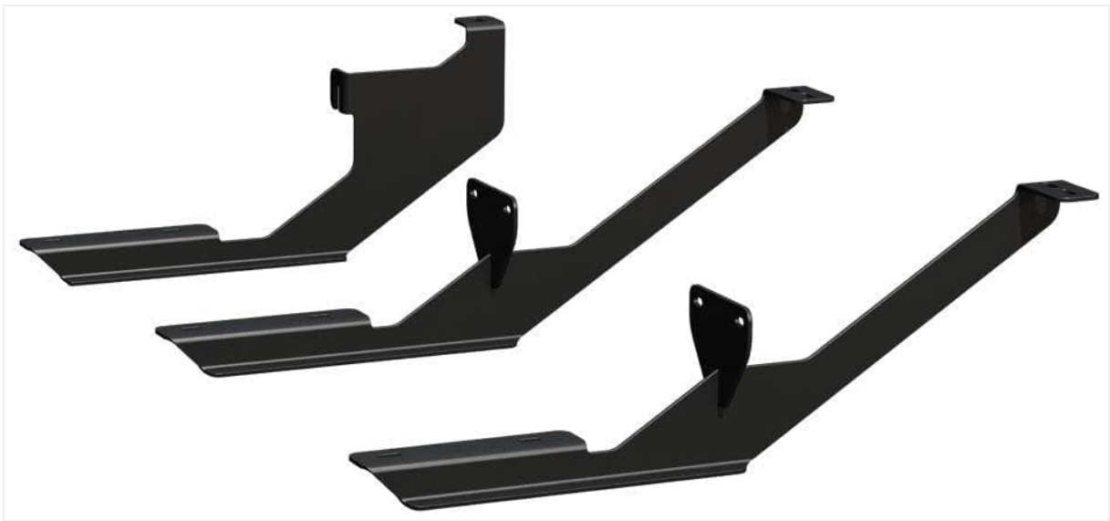
Image: Three black metal brackets, varying slightly in shape, designed to support a running board. These are the primary components of the LUVERNE 401801 kit.