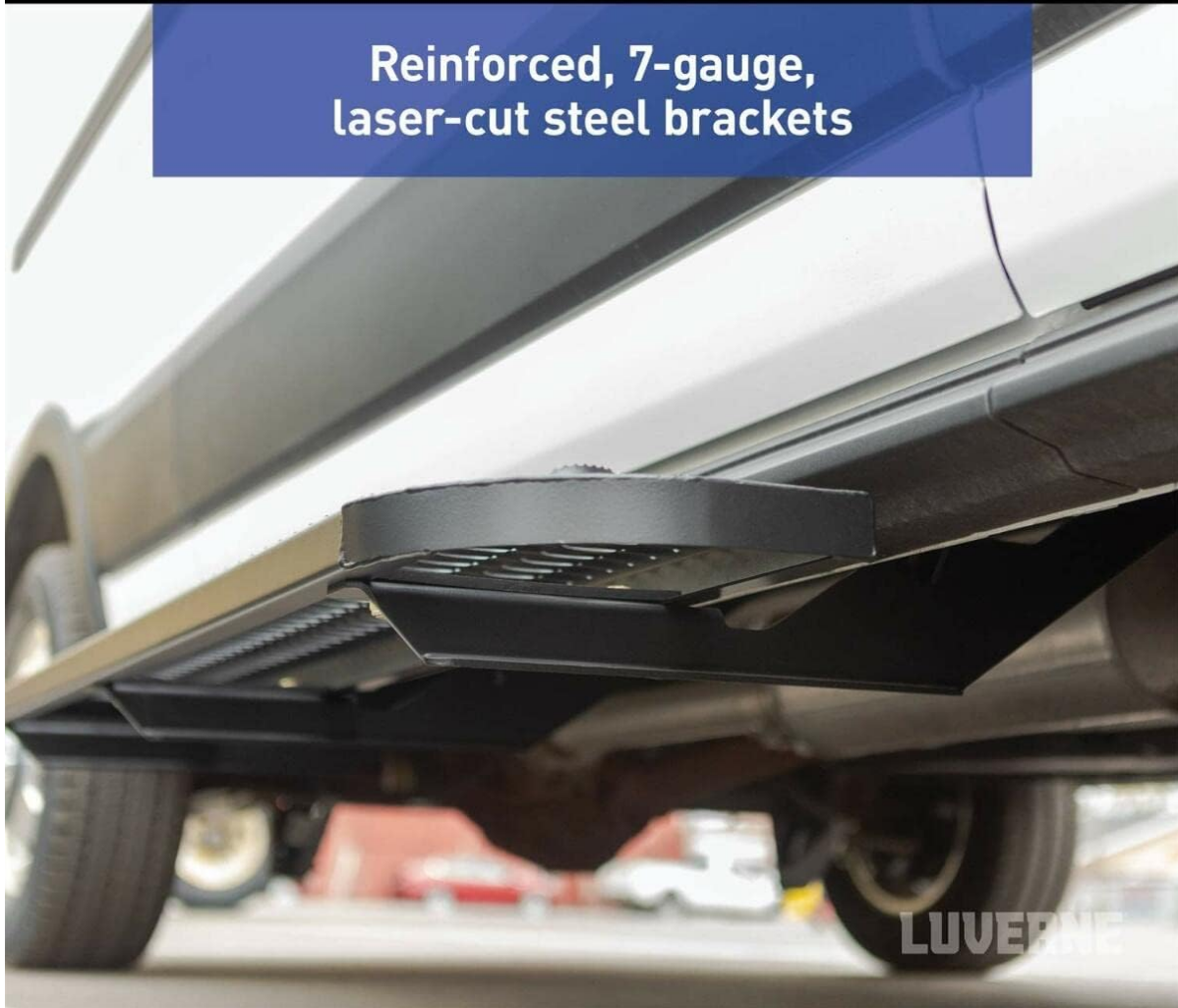
Image: A view from underneath a white vehicle showing a black grip step running board securely mounted with brackets. The image highlights the robust construction of the brackets and their integration with the step.

Reinforced, 7-gauge, laser-cut steel brackets