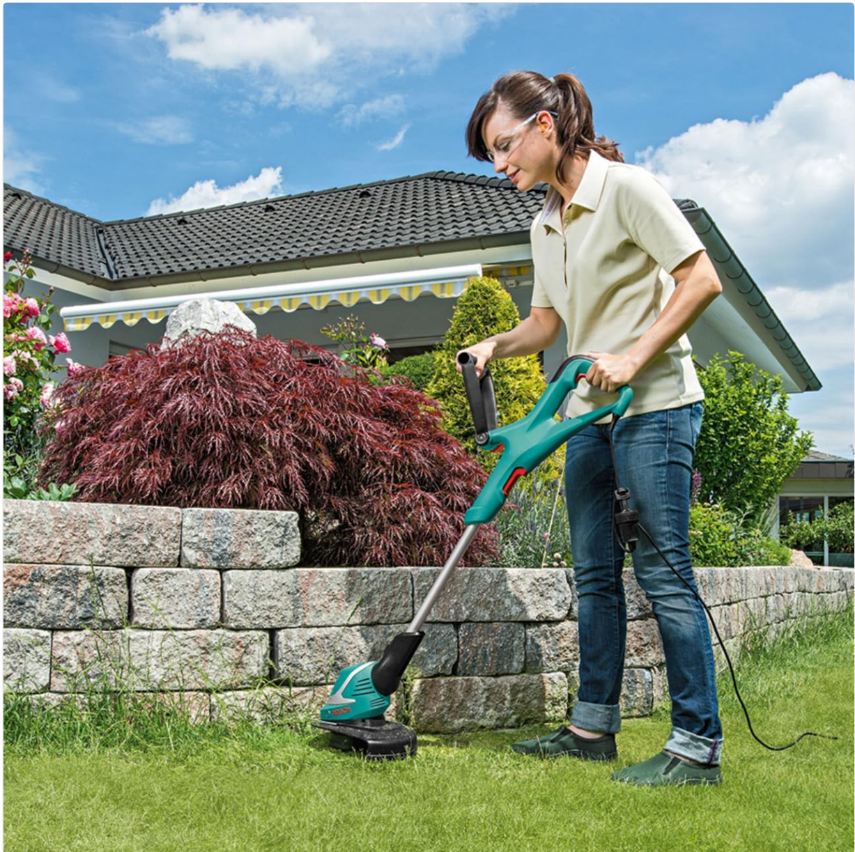
Figure 2: User adjusting the trimmer's height for comfortable operation, demonstrating the ergonomic design.