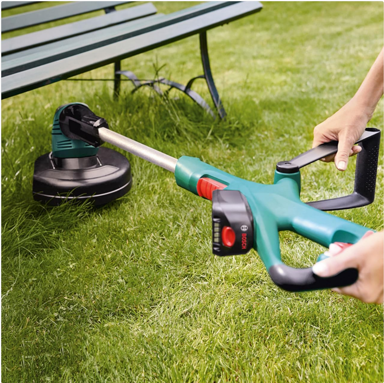
Figure 4: Demonstrating the trimmer's use for precise garden edging along a pathway or border.