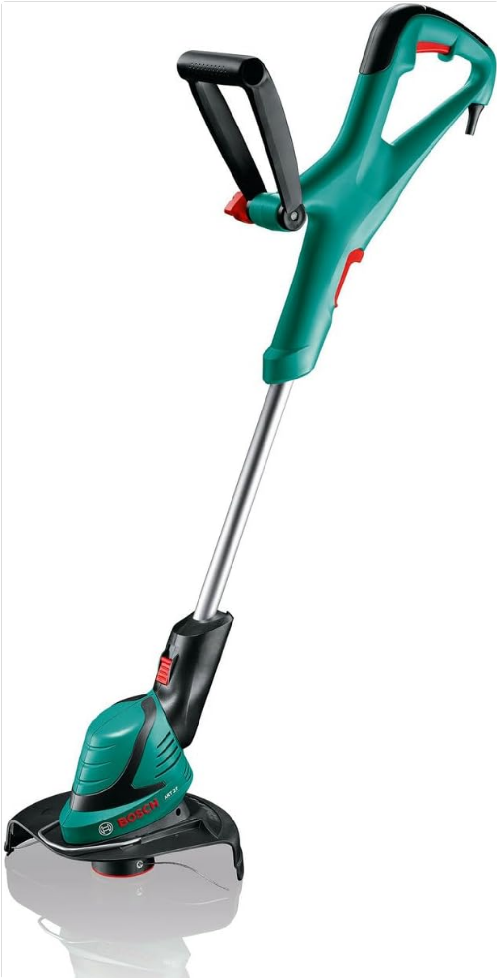
Figure 1: Bosch ART 27 Electric Grass Trimmer, illustrating its overall design and components.