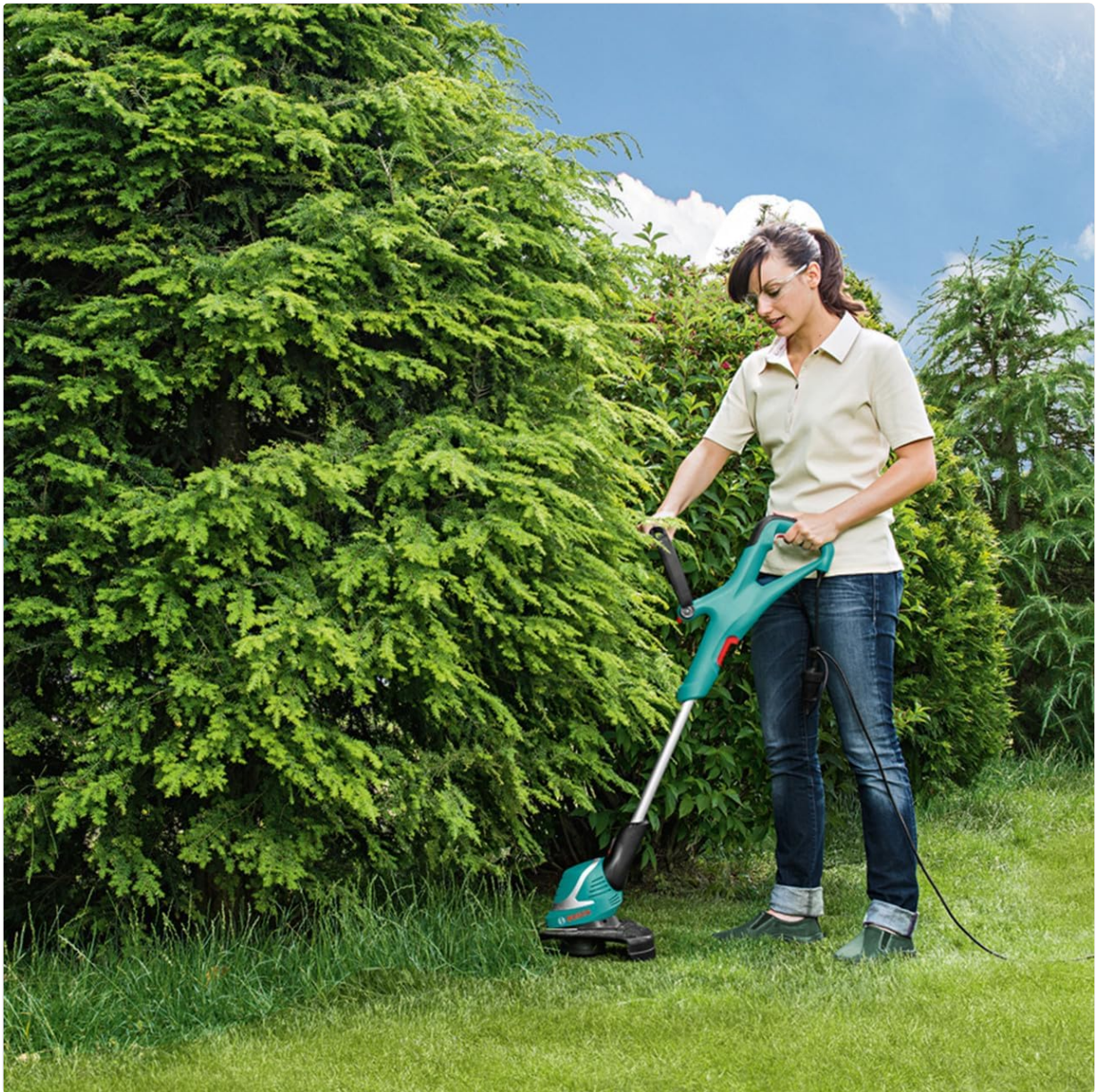
Figure 3: Operating the trimmer to cut grass and weeds around garden features, showcasing its maneuverability.