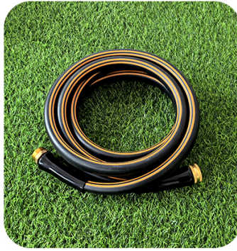
Easy to store