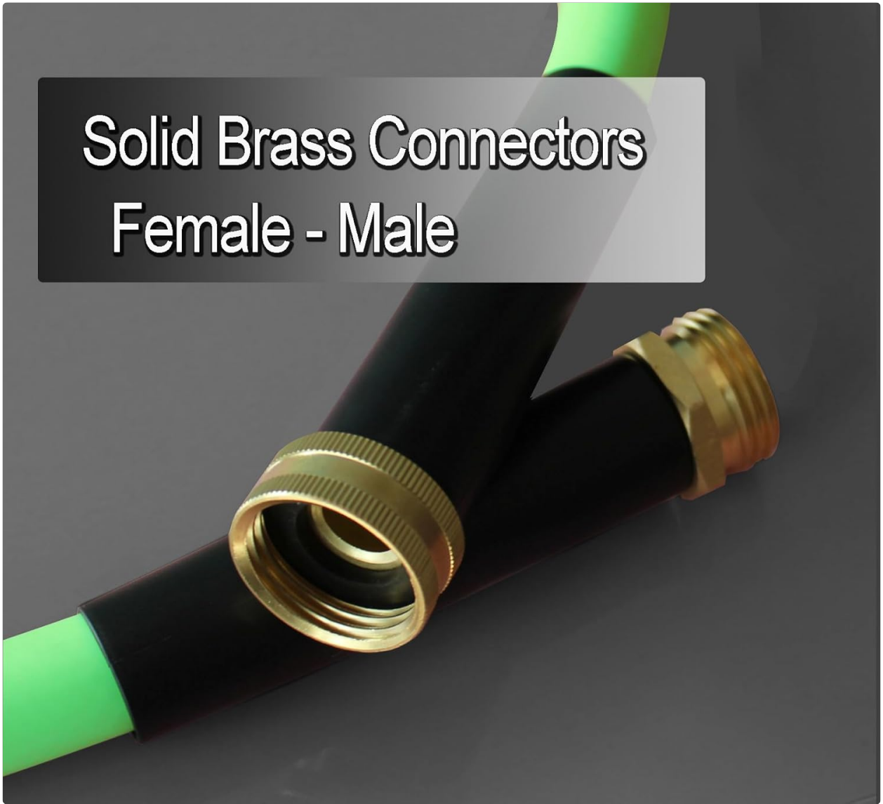
Figure 2: Solid Brass Connectors for secure attachment.

Your browser does not support the video tag.