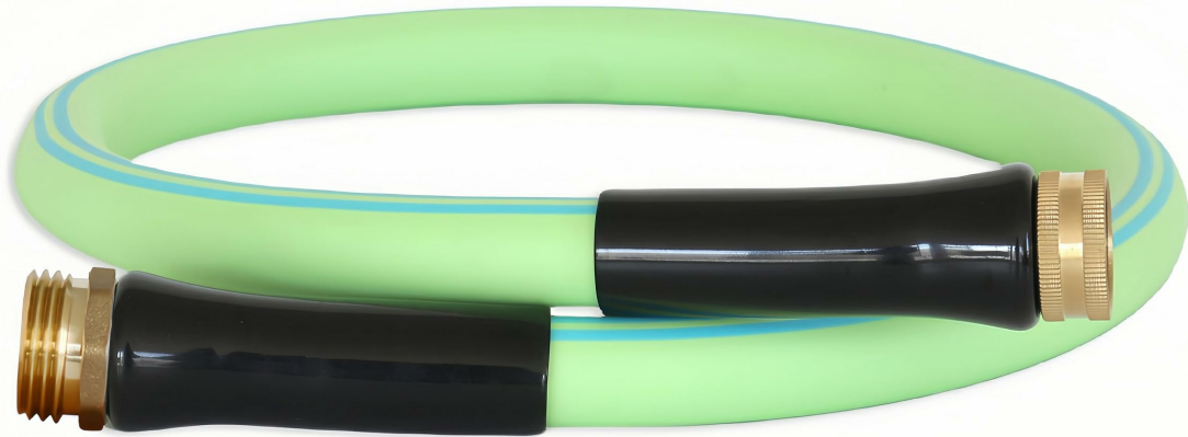
Figure 1: Atlantic Heavy Duty Garden Hose (4 ft, Green)