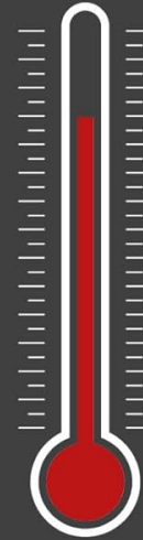
Figure 4: The hose is designed for a wide working temperature range, but proper storage is still recommended.