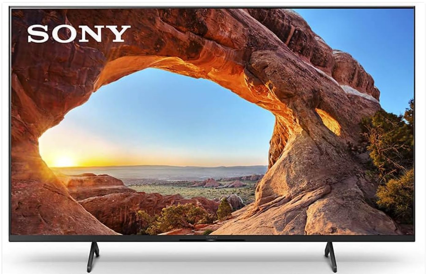
Front view of the Sony BRAVIA X85J 50 Inch 4K HDR LED Smart Google TV.