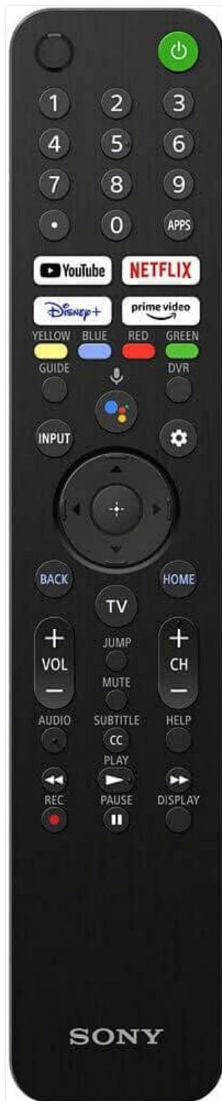
The remote control for the Sony X85J TV, featuring a full numeric keypad, dedicated streaming service buttons, and a Google Assistant voice control button.