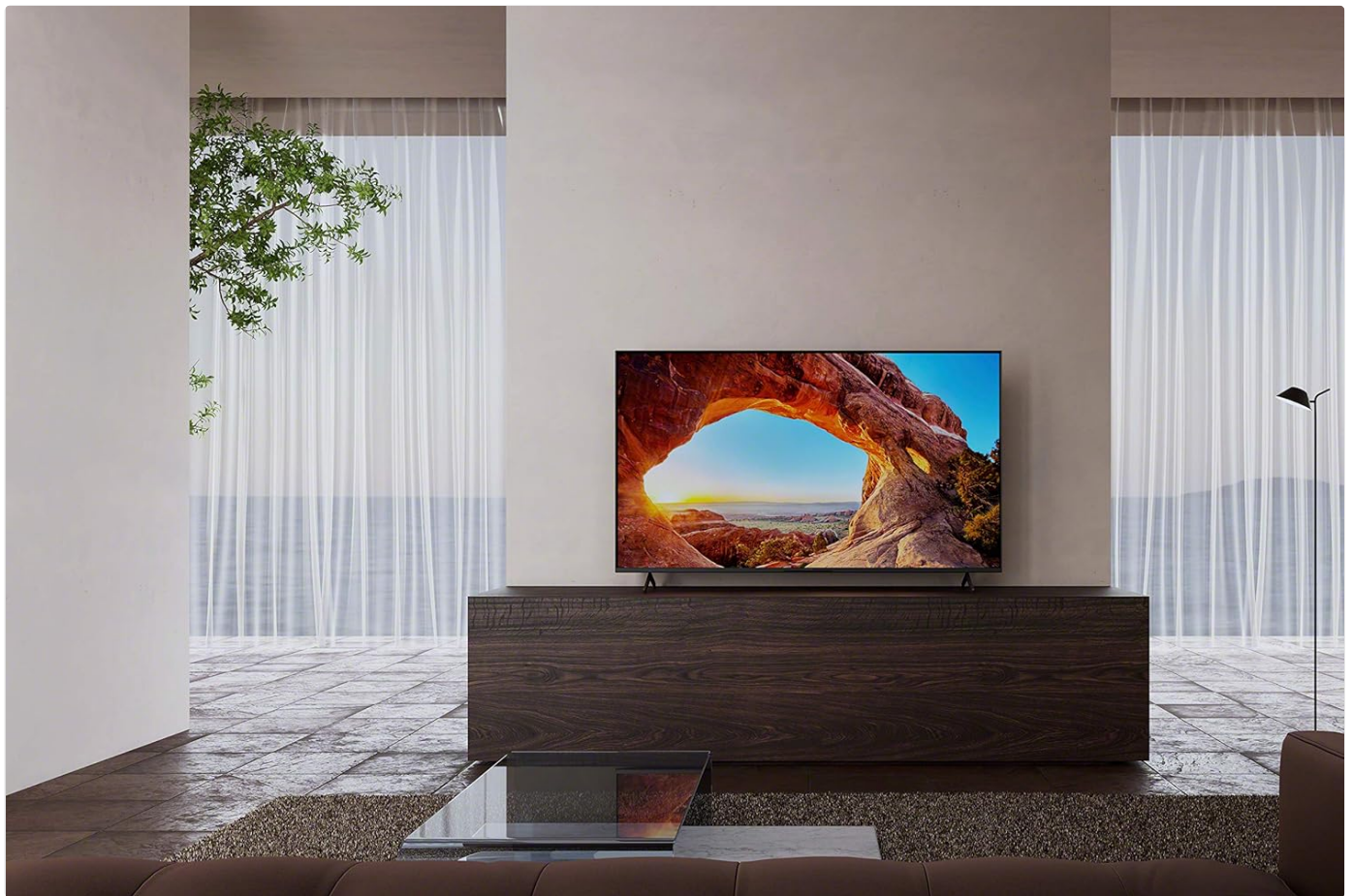
The Sony BRAVIA X85J TV integrated into a modern living room environment.