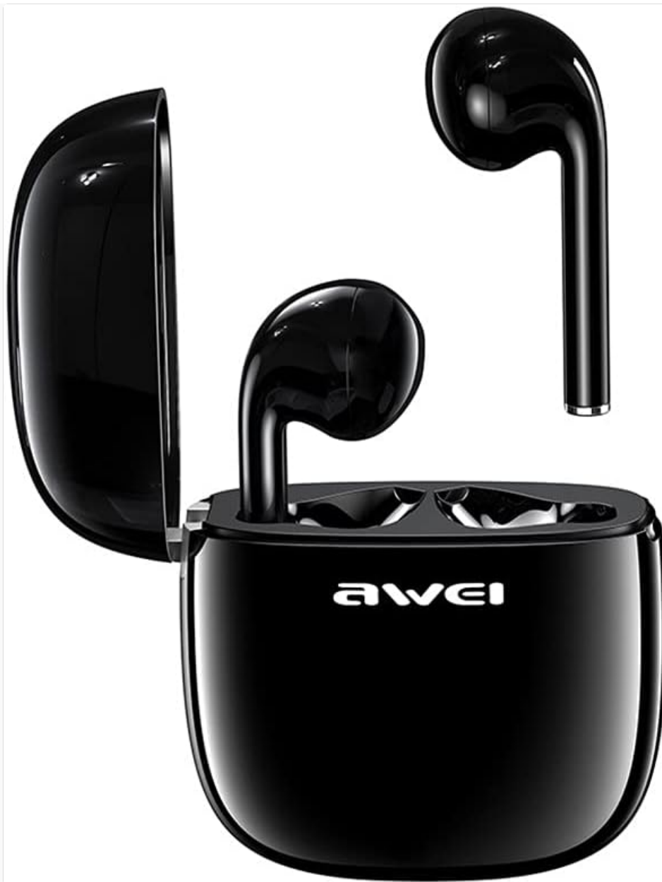
Image: The Awei T28 wireless earbuds are shown nestled within their open black charging case. The earbuds are also black, with a sleek, in-ear design and a short stem. The charging case is compact and oval-shaped, featuring the 'awei' logo on its front surface.

Each earbud features a multi-function touch control area for managing audio playback and calls.