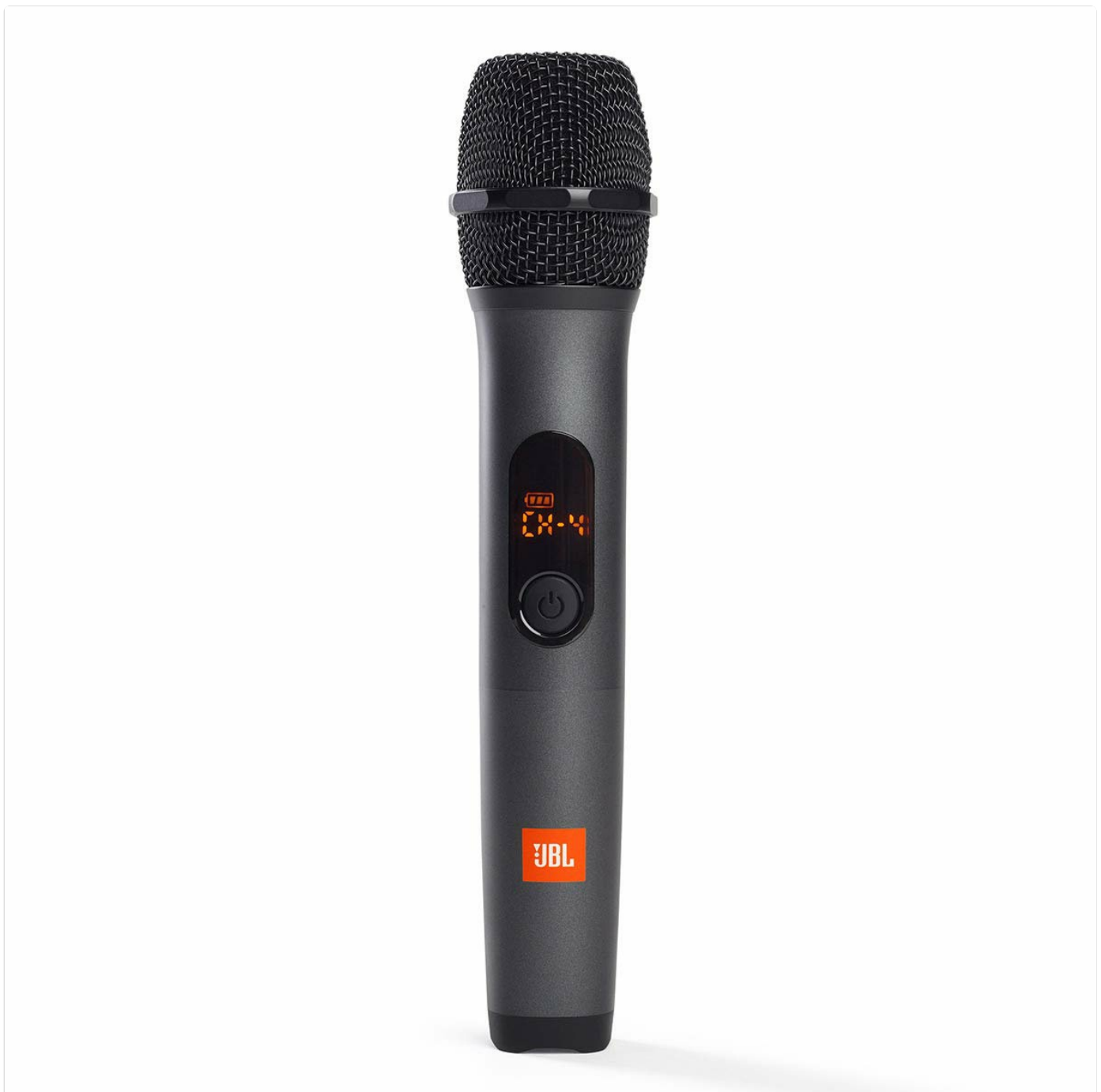
Image: A single JBL Wireless Microphone with its digital display showing channel information.