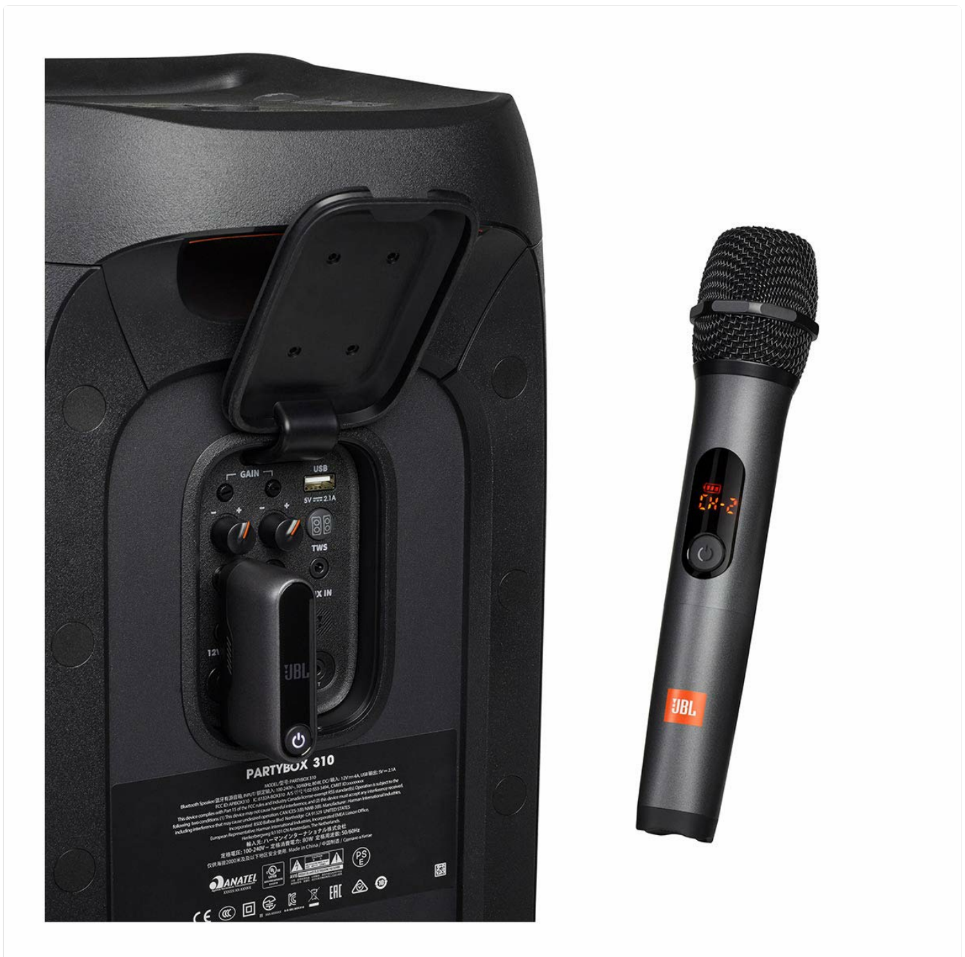
Image: The JBL Wireless Receiver connected to the input of a JBL PartyBox speaker.