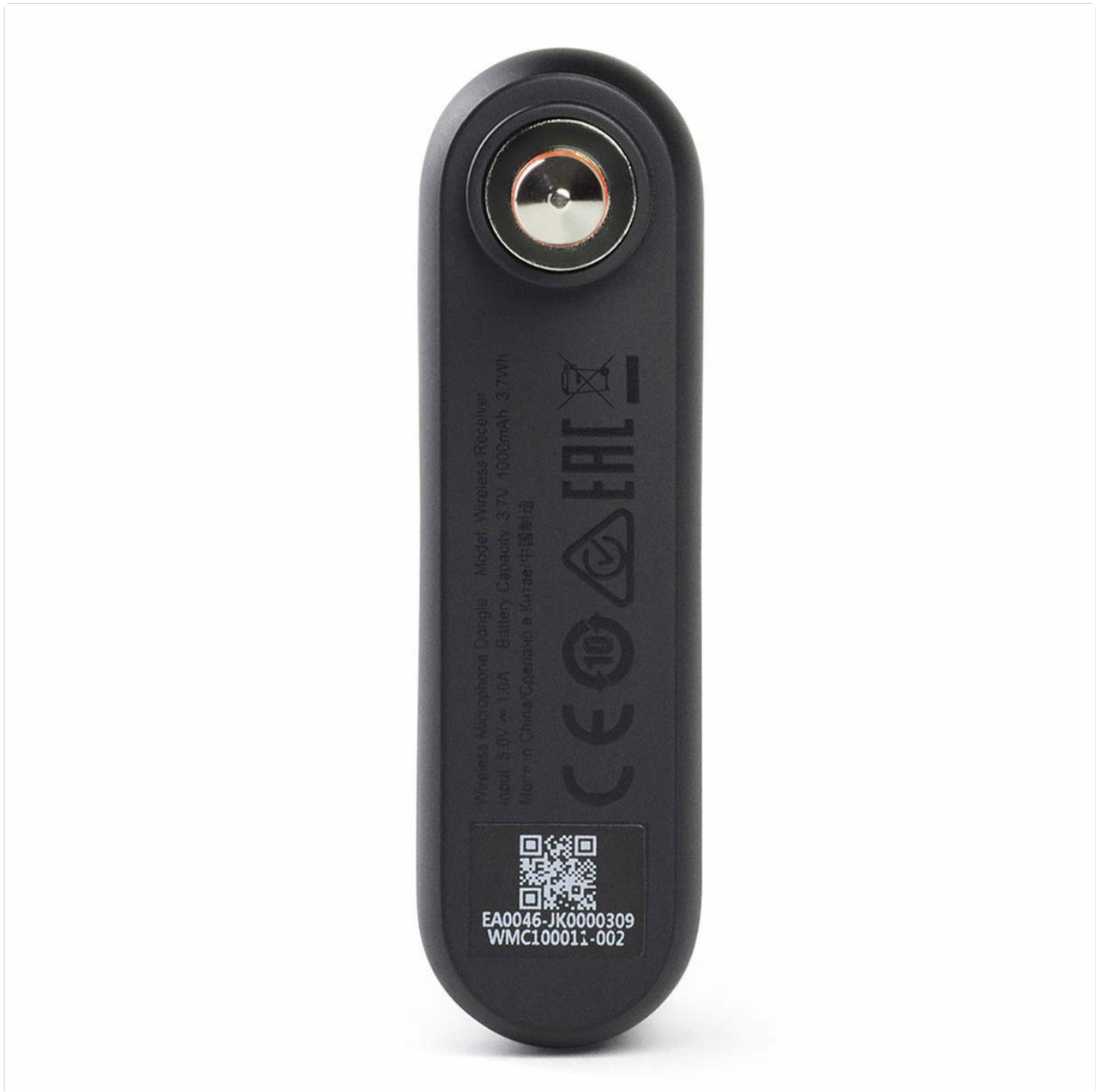
Image: Close-up of the JBL Wireless Receiver, highlighting its USB-C charging port.

The dual-channel receiver is rechargeable via the included USB-C cable. Connect the USB-C cable to the receiver and a power source (e.g., USB wall adapter, computer USB port) to charge.