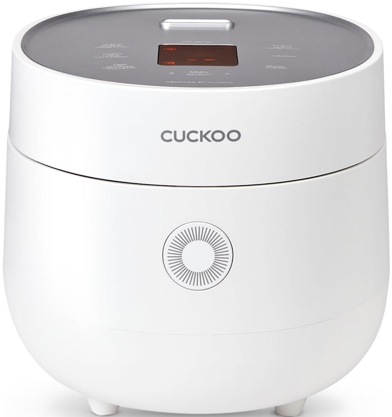
Image: The CUCKOO CR-0675FW Micom Rice Cooker, showcasing its compact and modern design.