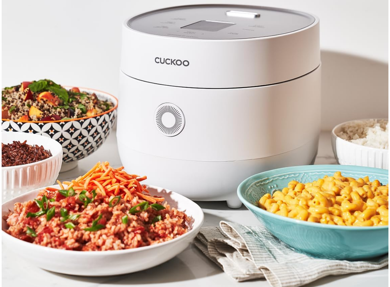
Image: Designed for easy and convenient cooking, highlighting the 6-cup capacity and intelligent modes.