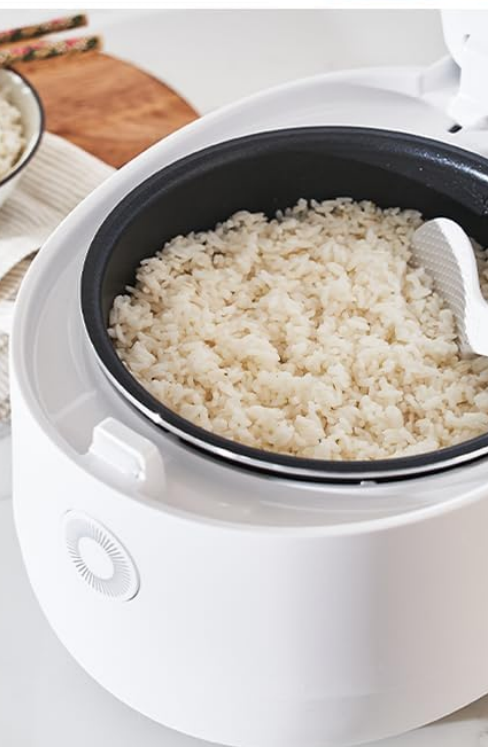
Image: Quick Mode for fast cooking and Rice Master options for customized rice texture.