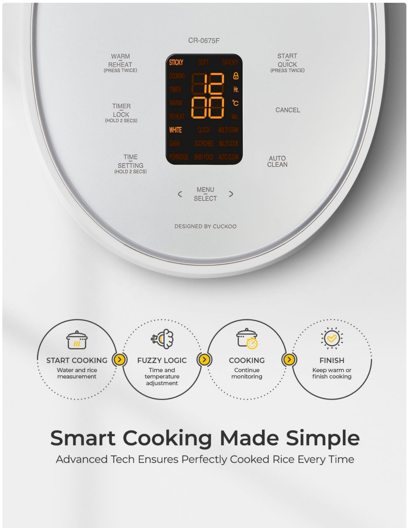
Image: Smart cooking made simple, detailing the Fuzzy Logic Technology process.