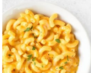
Image: One cooker, countless dishes – illustrating the versatility for preparing various meals.