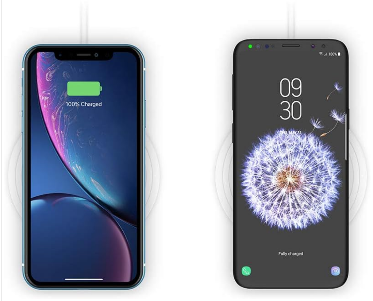
Image: Examples of universally compatible Qi-enabled smartphones.

Works with any Qi-enabled smartphone from Apple, Samsung, LG, Google, Sony and more.