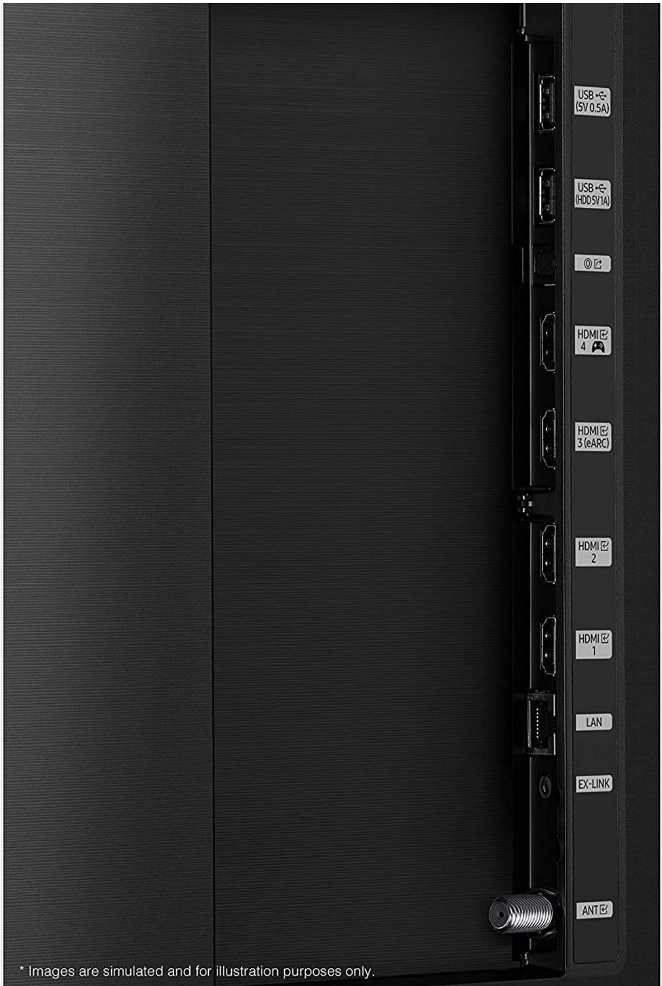
Image: Detailed view of the TV's rear panel, highlighting the USB, HDMI, LAN, and antenna input ports for connecting various external devices.