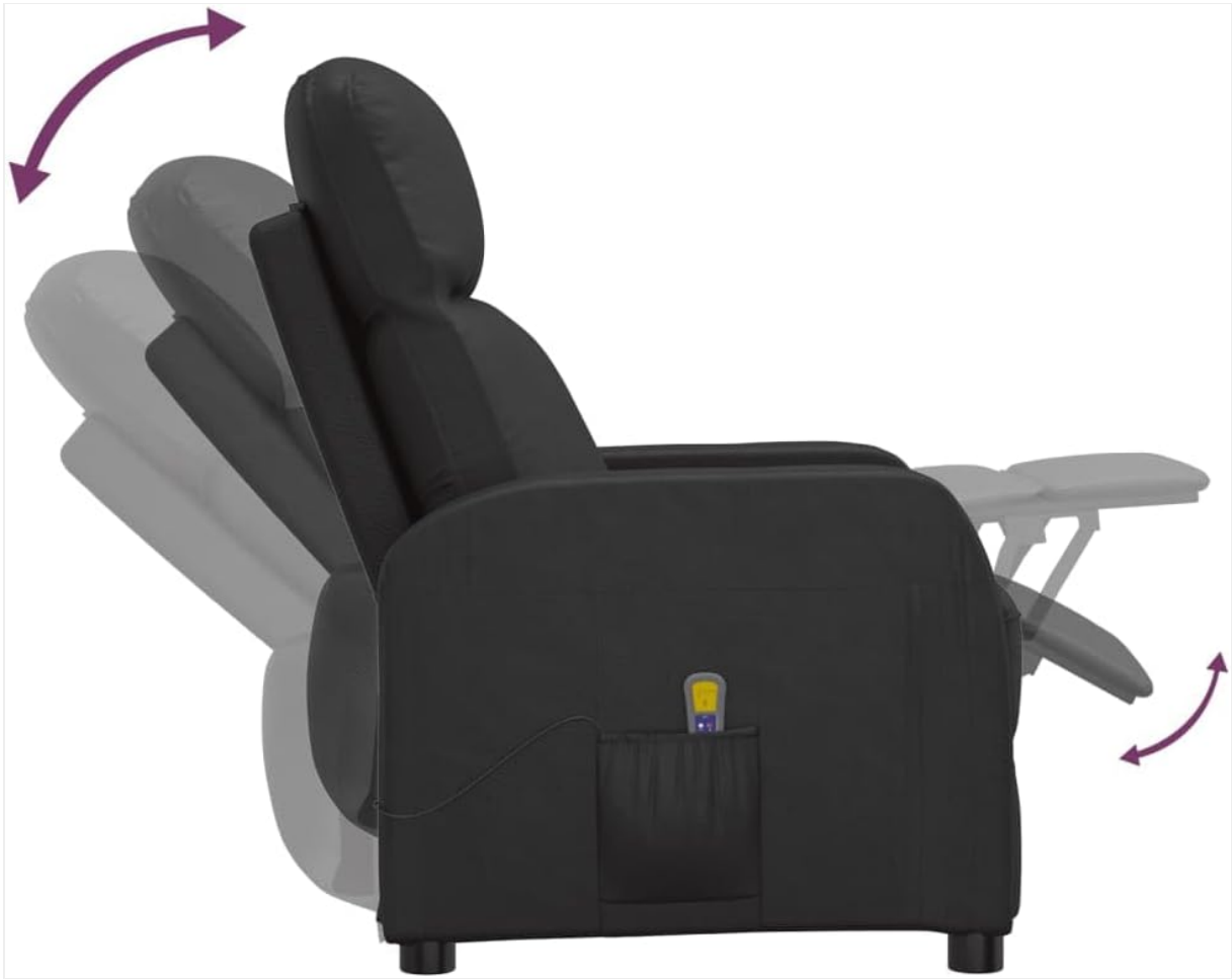
Image 5.1: Side view of the chair showing the range of reclining motion.