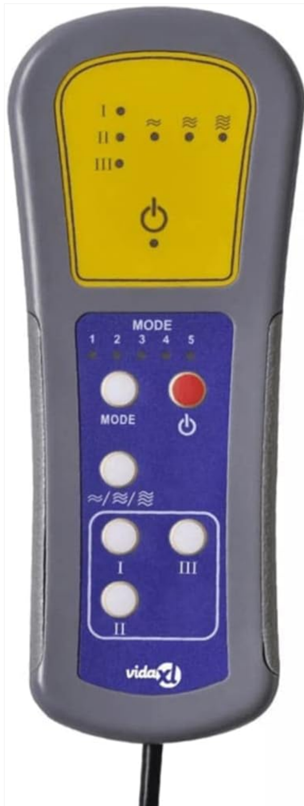
Image 5.3: Detailed view of the remote control for the massage function.