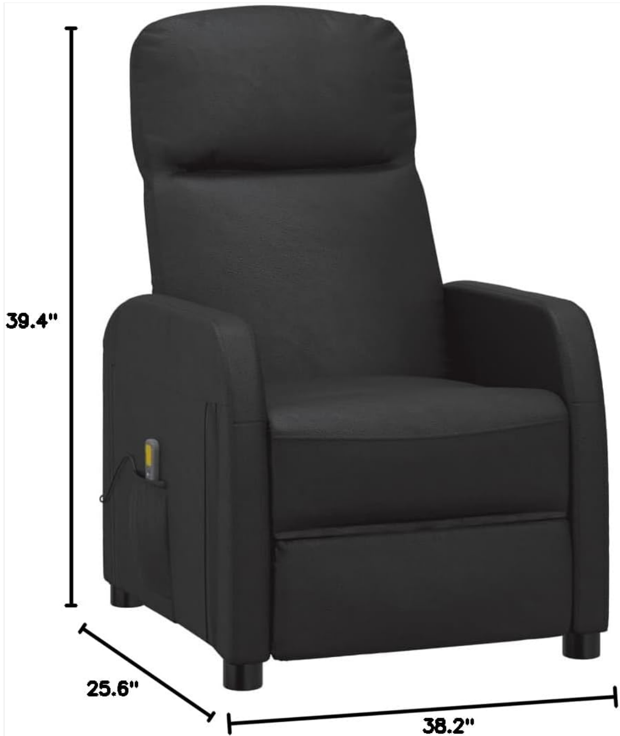
Image 4.1: Diagram illustrating the chair's dimensions, useful for assembly and placement.