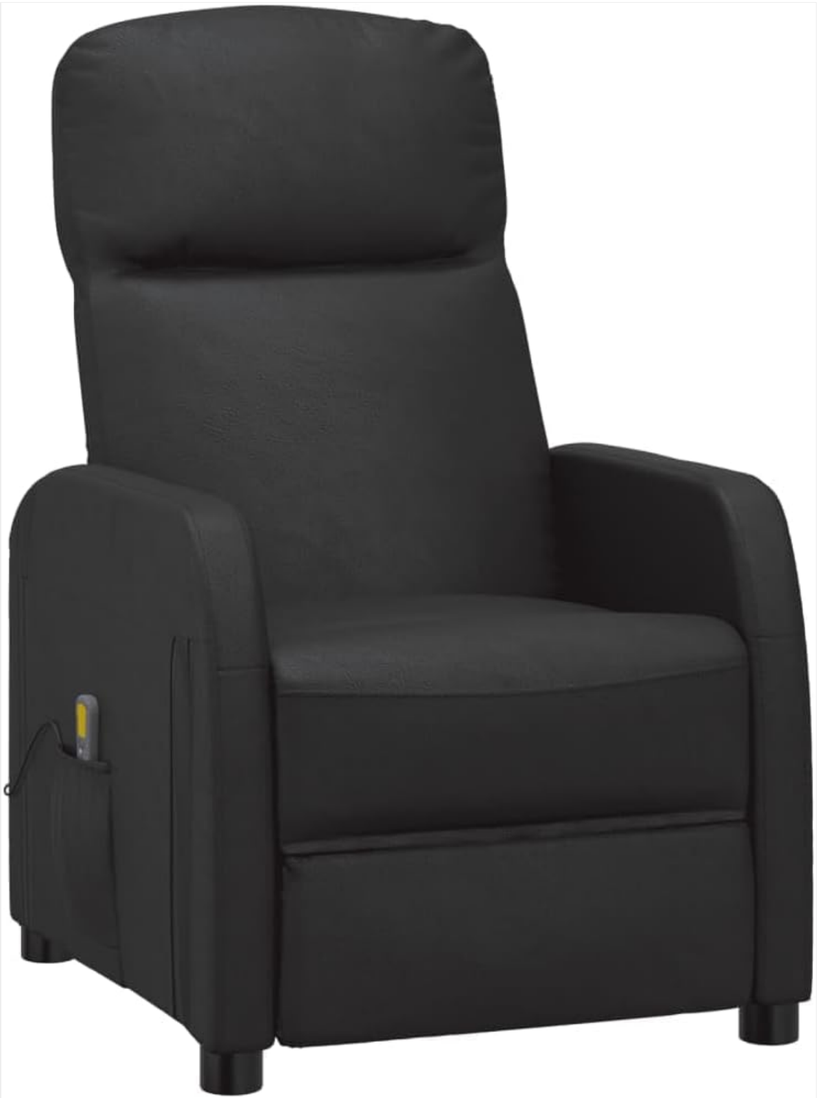
Image 1.1: Front view of the vidaXL Faux Leather Massage Reclining Chair. This image displays the chair's overall design and black faux leather upholstery.