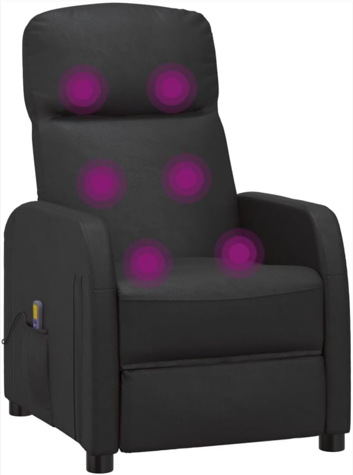
Image 5.2: Visual representation of the massage zones within the chair.