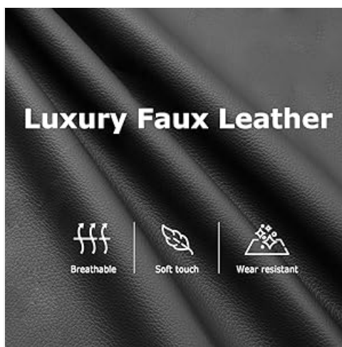
Image 6.1: Close-up of the faux leather material, emphasizing its soft touch and wear-resistant qualities.