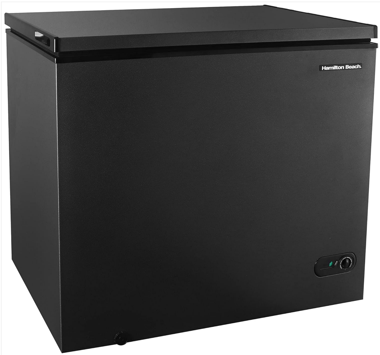
Front view of the Hamilton Beach HBFRF713 Chest Deep Freezer. This image shows the overall design and exterior of the unit.