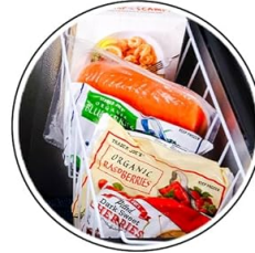
Wired Removeable Shelf