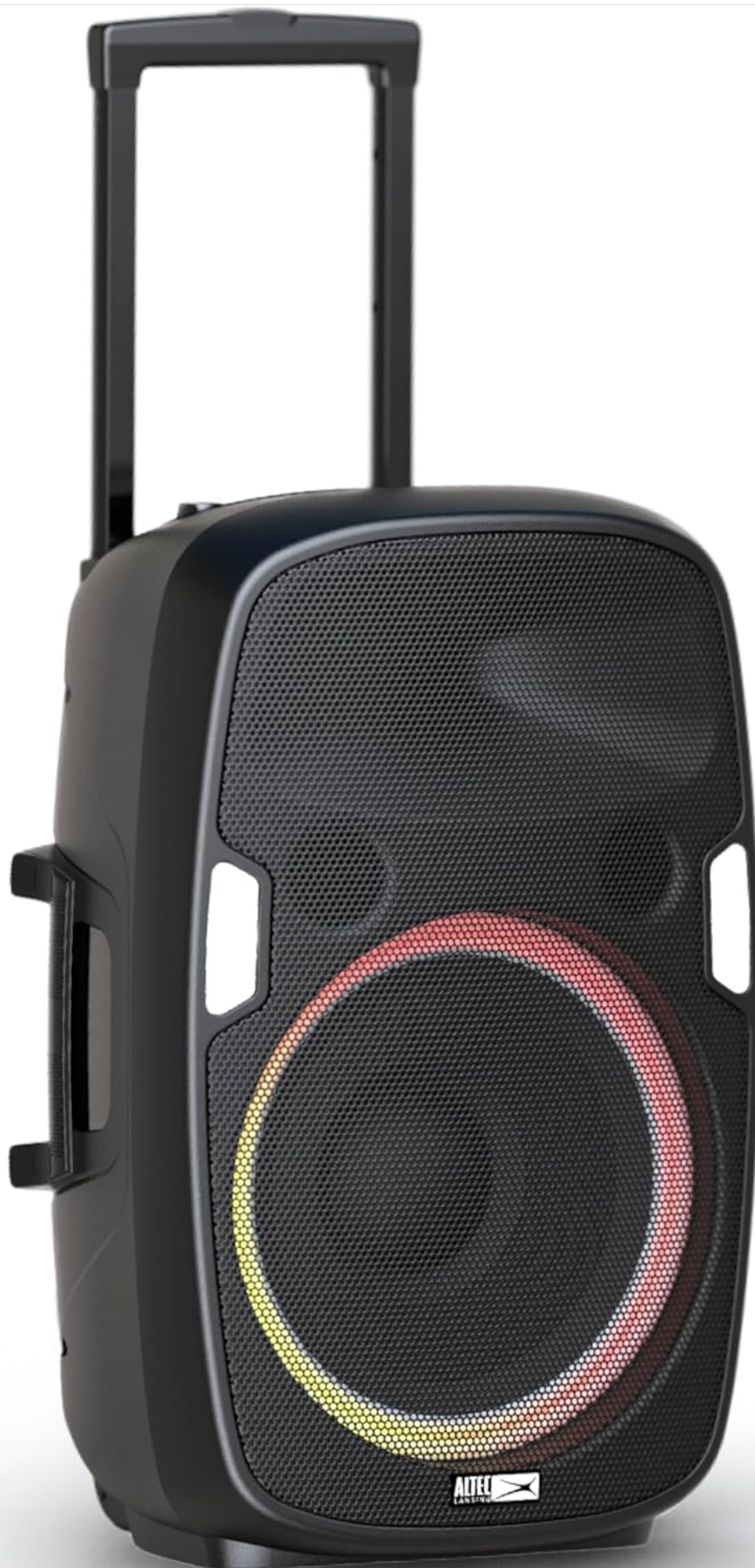
Figure 1: Front view of the SoundRover speaker, showcasing the main speaker and the dynamic LED light ring. The speaker features 7 LED light modes that beat, strobe, and pulse with your music, enhancing the party atmosphere.