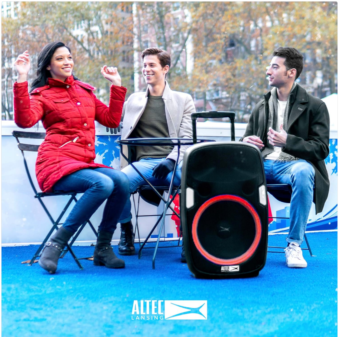
Figure 5: The speaker's LED lights can be customized to beat, strobe, or pulse, adding a visual element to your audio experience.