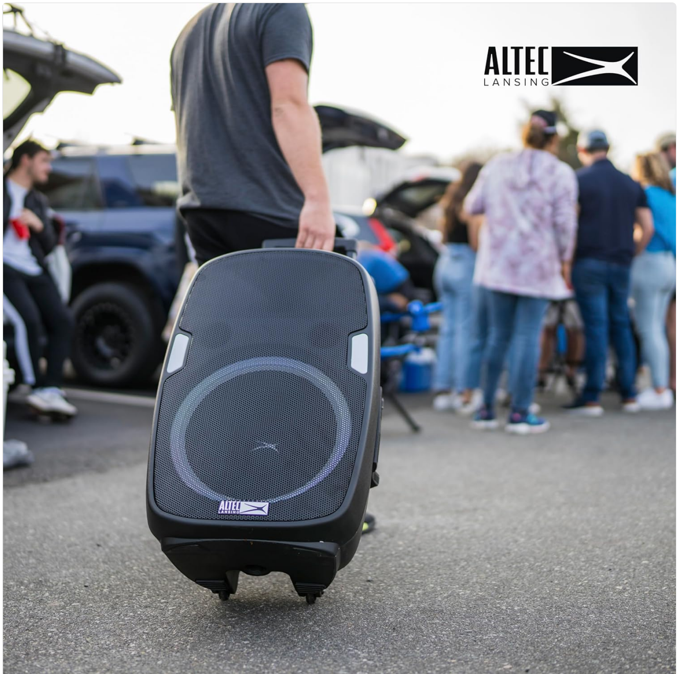
Figure 3: The SoundRover is designed for easy transport with an integrated carry handle and smooth-rolling wheels, making it convenient to move for any event.