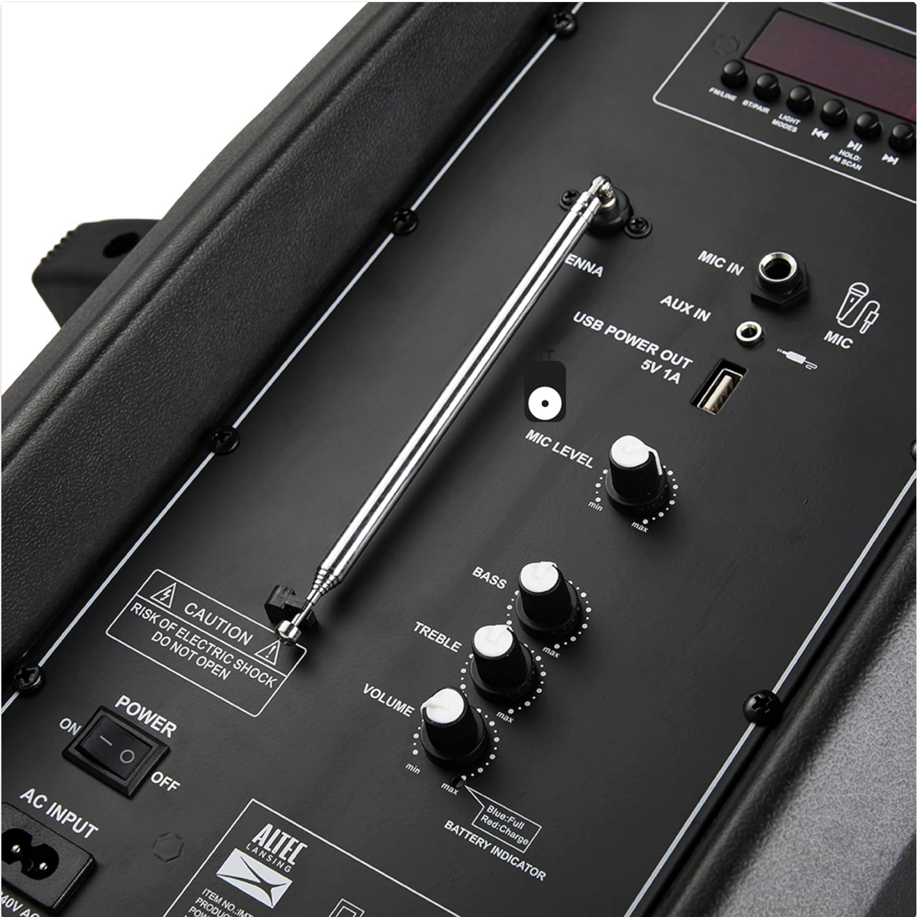
Figure 2: The rear control panel includes power switch, AC input, antenna, USB power out, microphone input, auxiliary input, and adjustable knobs for mic level, bass, treble, and master volume. A digital display shows current mode and battery indicator.