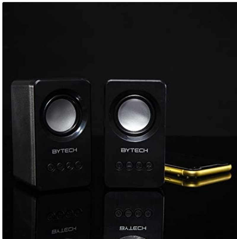
Image: The two Bytech Boost Link True Wireless Speakers positioned next to a smartphone, symbolizing their ability to connect wirelessly to each other and a device for stereo sound.

For a true stereo sound experience, you can pair both speakers together: