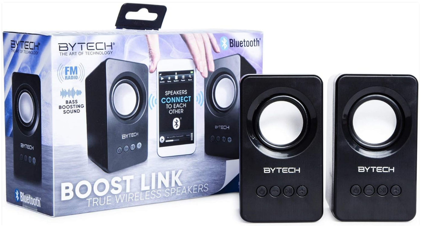
Image: The Bytech Boost Link True Wireless Speakers shown in their retail packaging, highlighting the two speakers and the Bluetooth connectivity feature.

Please check that all items are present and in good condition: