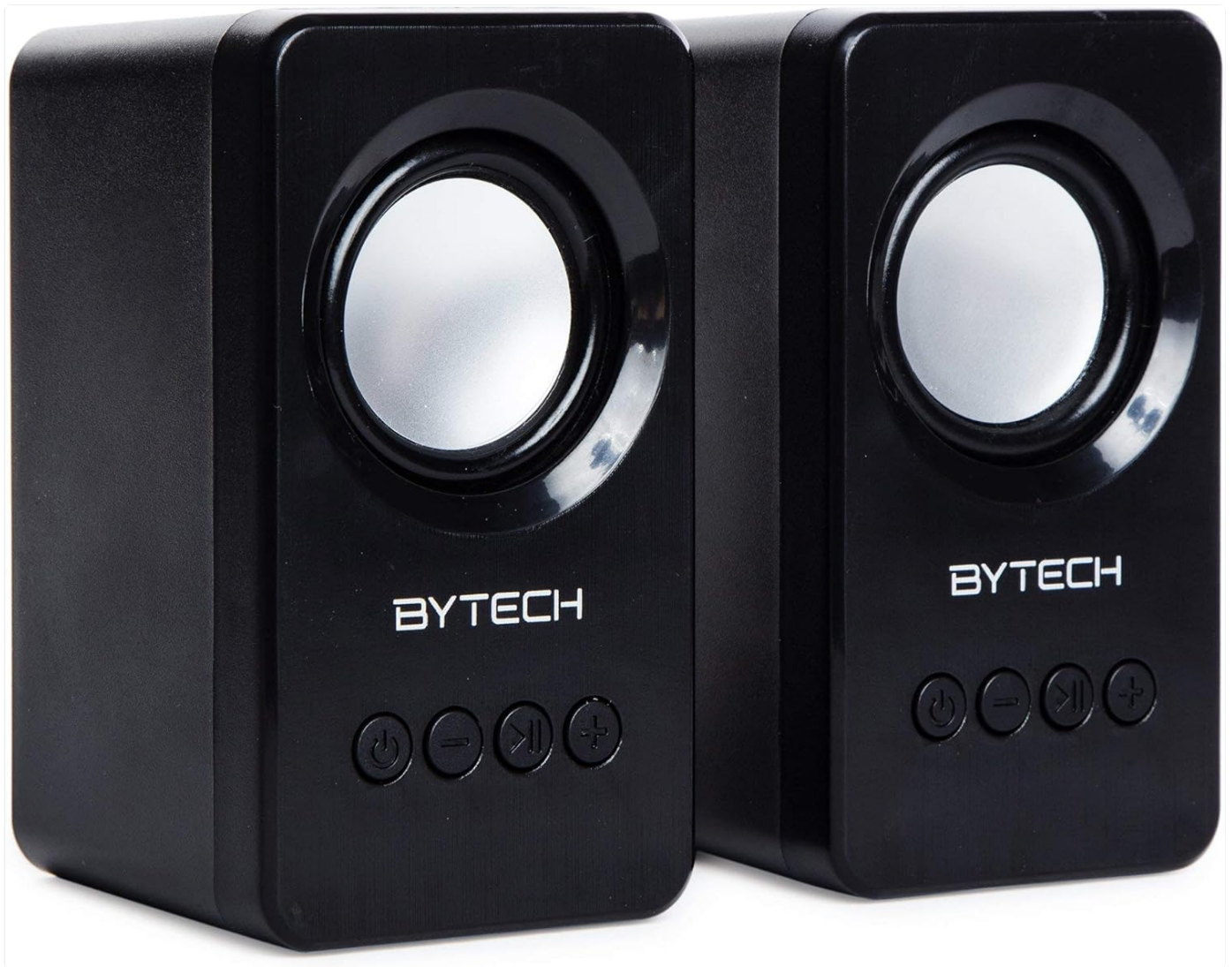
Image: A close-up front view of the two Bytech Boost Link True Wireless Speakers, showing the speaker grilles and control buttons at the bottom.

Familiarize yourself with the speaker's components and controls: