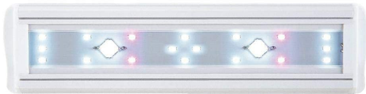
Figure 2: Top view of the SOBO AL-580 COB Plant Lamp, illustrating the arrangement of its Red, Blue, and White LED lights.