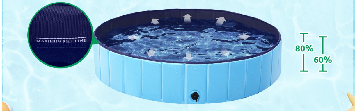
Recommended water fill levels for optimal pool stability.

Il est recommandé d'avoir au moins 60 % d'eau pleine de la piscine pour fournir une tension suffisante pour soutenir la piscine.