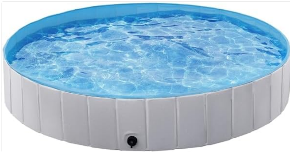
The Yaheetech foldable pet pool, 160cm diameter and 30cm height, in grey, ready for use.

Thank you for choosing the Yaheetech Foldable Pet Pool. This portable and durable pool is designed to provide a fun and refreshing experience for your pets. Its foldable design allows for easy setup, storage, and transport. This manual provides essential information for the safe and effective use of your pet pool.