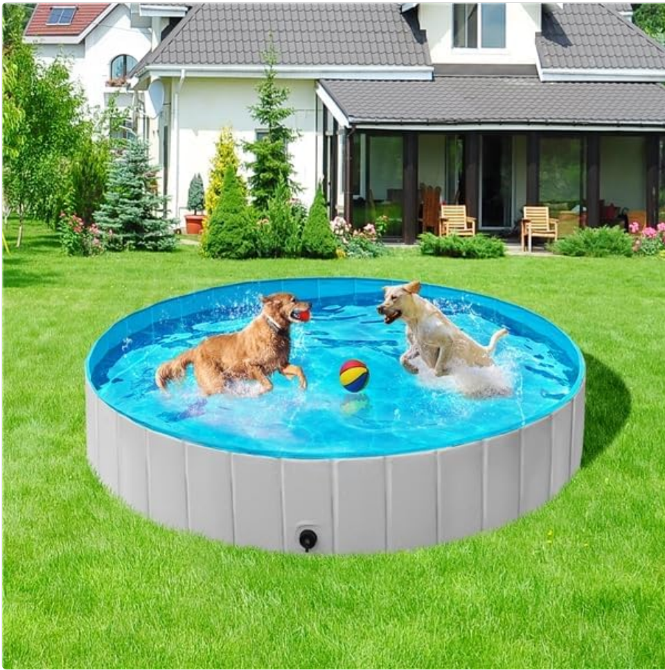
Two dogs enjoying the pool in a backyard setting.