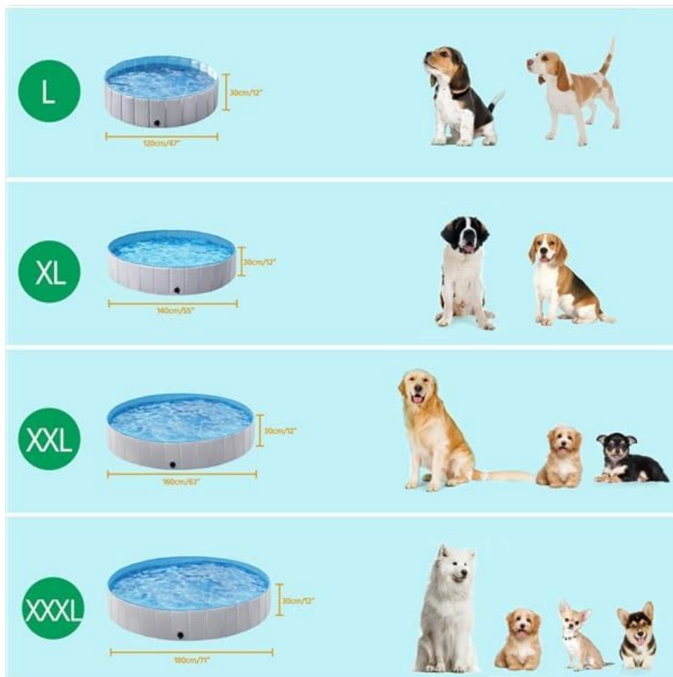
Size guide for different pet pool models and suitable dog sizes.