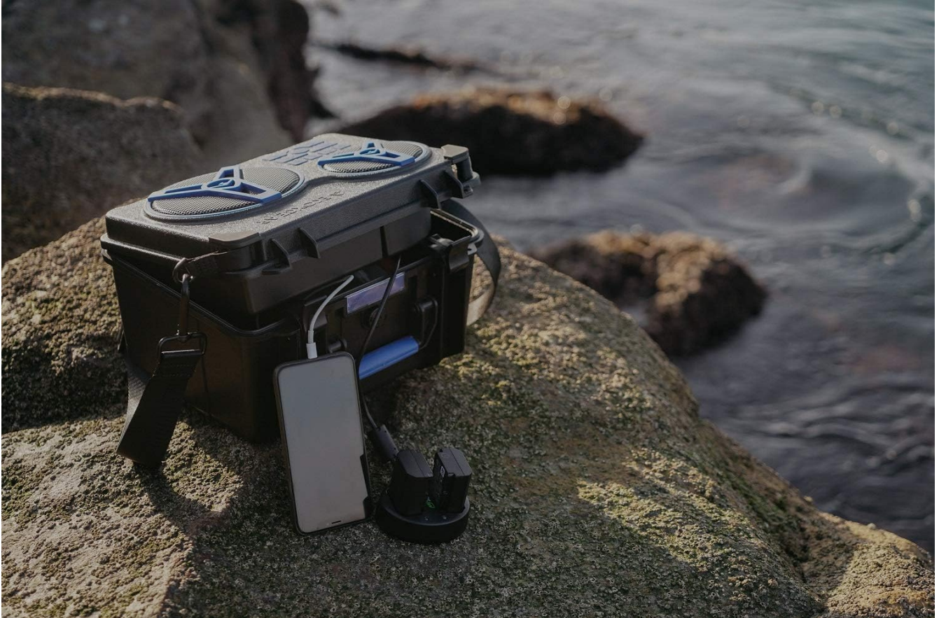
Image: The EcoJourney speaker demonstrating its power bank capability by charging a smartphone via its USB output port.