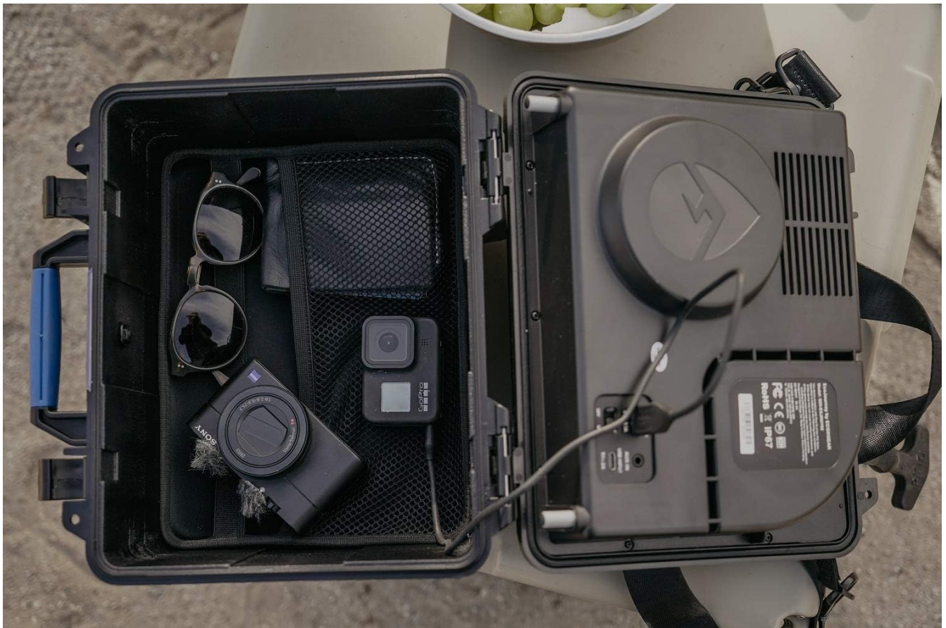
Image: The dry storage compartment of the EcoJourney, shown with various items like sunglasses, a wallet, and a camera, demonstrating its practical use.