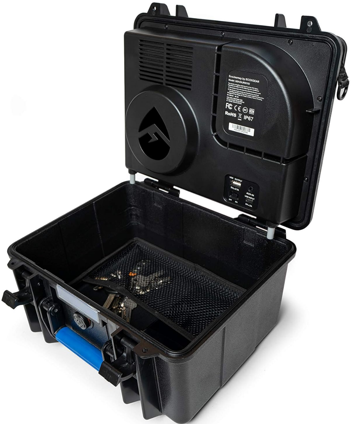
Image: The EcoJourney speaker with its top lid open, revealing the spacious dry storage compartment designed to protect personal items.