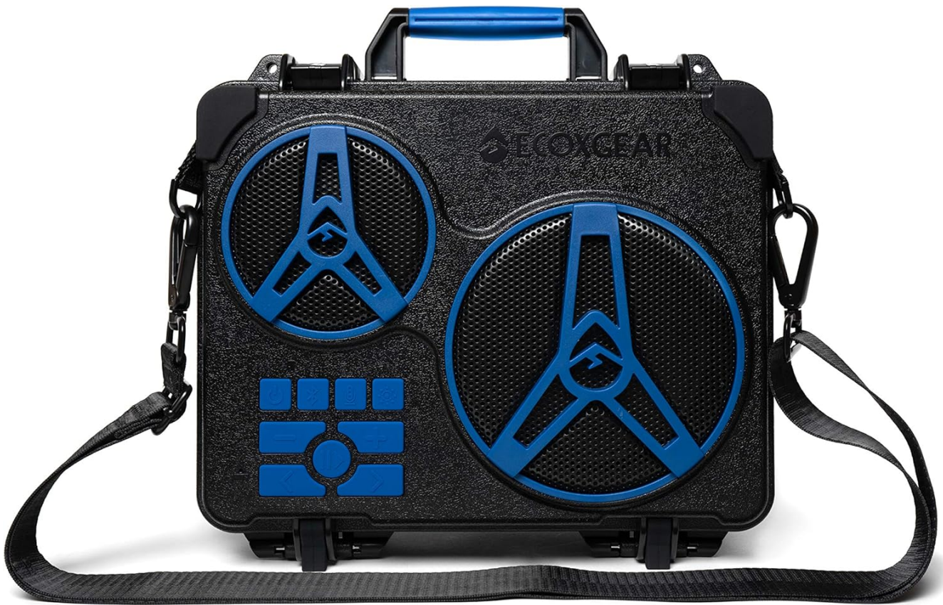
Image: The ECOXGEAR EcoJourney speaker shown with its detachable shoulder carry strap.