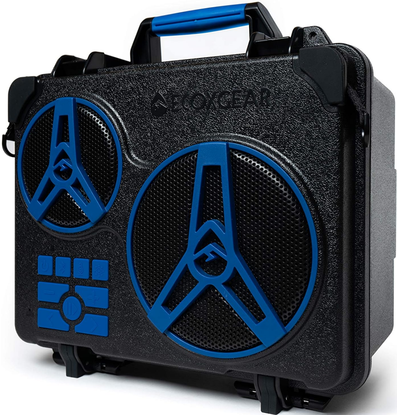
Image: Front view of the ECOXGEAR EcoJourney speaker, showcasing its rugged black casing and blue speaker accents.