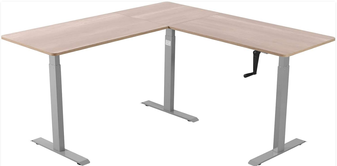
Figure 1: UNICOO L-Shaped Crank Height Adjustable Standing Desk. This image displays the UNICOO L-Shaped Crank Height Adjustable Standing Desk, showcasing its L-shaped design, grey frame, and antique oak tabletop. The manual crank system is visible on the right side.

This manual provides detailed instructions for the assembly, operation, maintenance, and troubleshooting of your UNICOO L-Shaped Crank Height Adjustable Standing Desk. Please read this manual thoroughly before beginning assembly or operation to ensure proper use and longevity of your product.