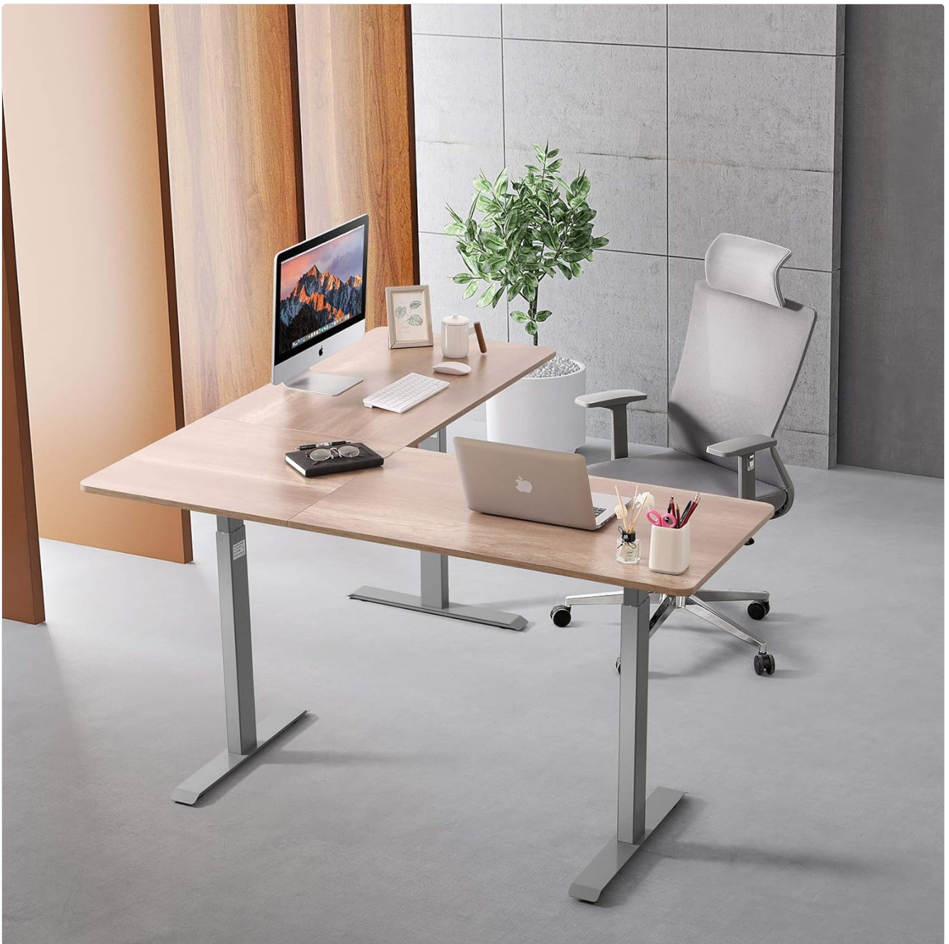
Figure 2: Desk in an office setting. This image shows the UNICOO L-Shaped Standing Desk in a typical office setup, highlighting its spacious surface for multiple monitors, a laptop, and other office essentials. An office chair and plant are also visible, demonstrating the desk's integration into a workspace.