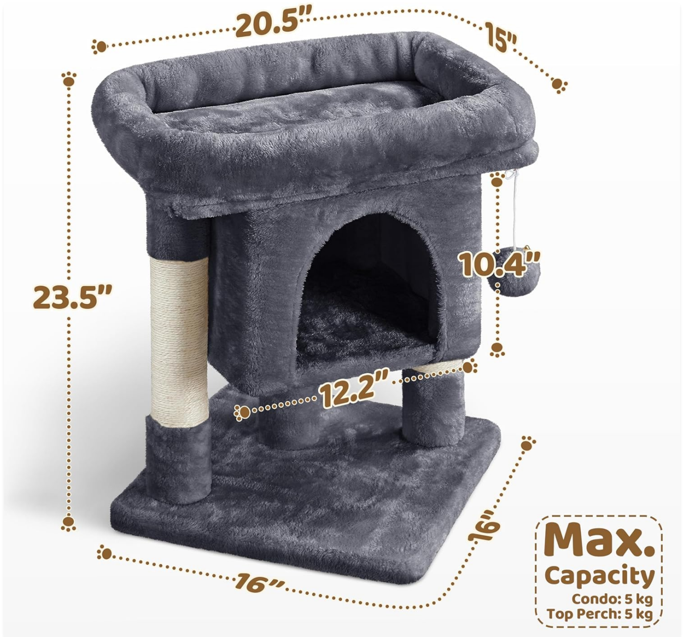
Image: Dimensional diagram of the cat tree, illustrating its overall size and component measurements.