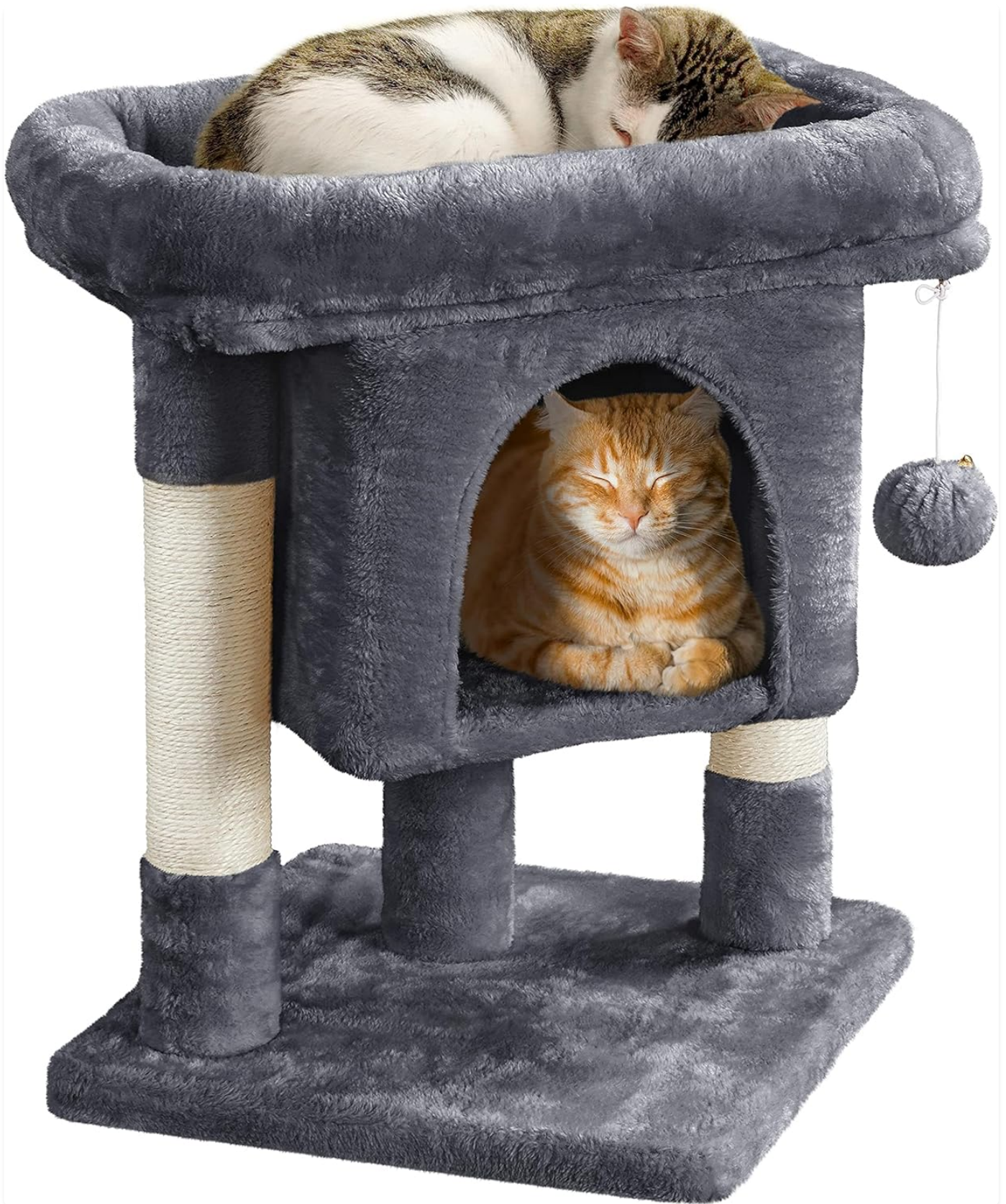
Image: The Yaheetech 23.5-inch Cat Tree Tower in dark gray, with two cats utilizing its features.