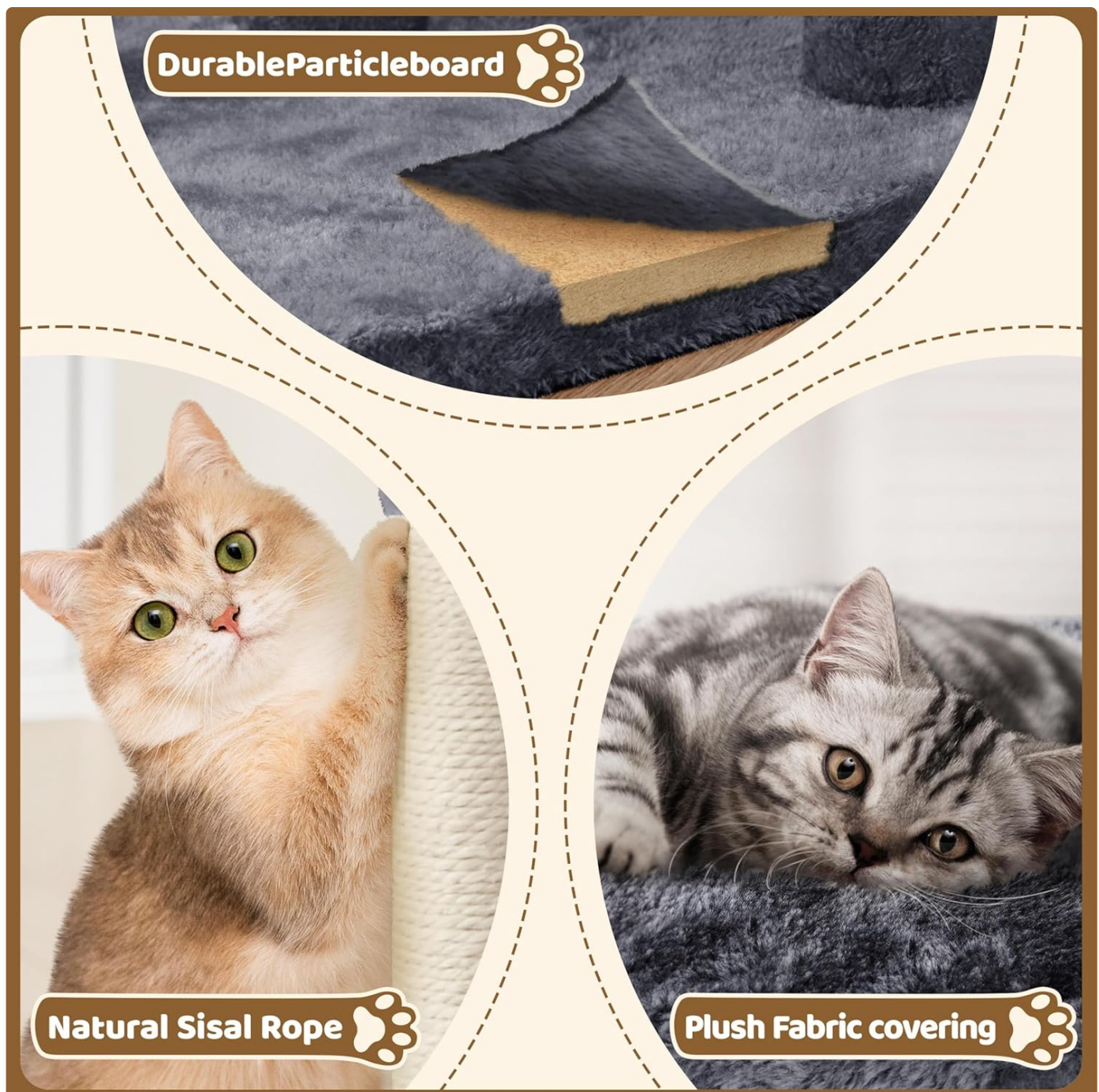
Image: Details of the construction materials: P2 particle board, natural sisal rope, and soft plush fabric.