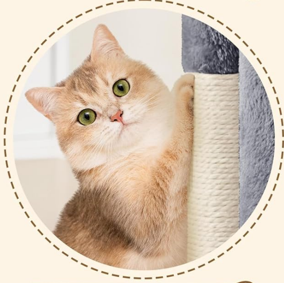
Natural Sisal Rope