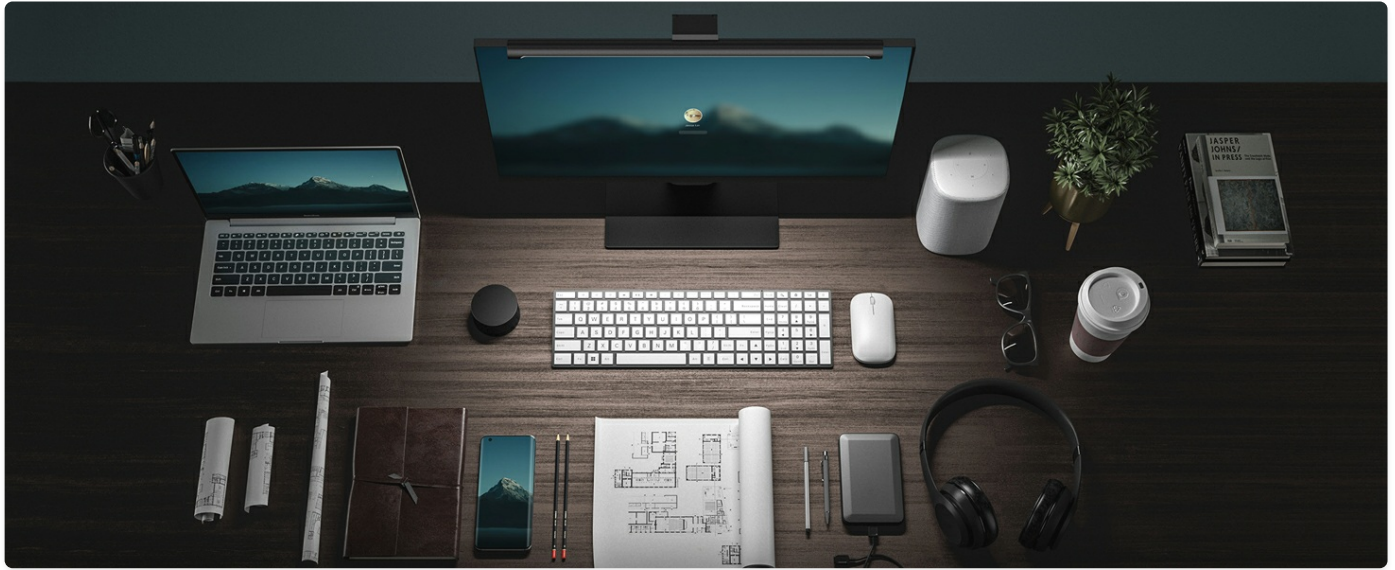
Image: High Ra95 color rendering index ensures accurate color representation.

The light bar features a high Ra95 color rendering index, ensuring objects are displayed in their full, natural color. It is also flicker-free to reduce eye fatigue during long-term use.