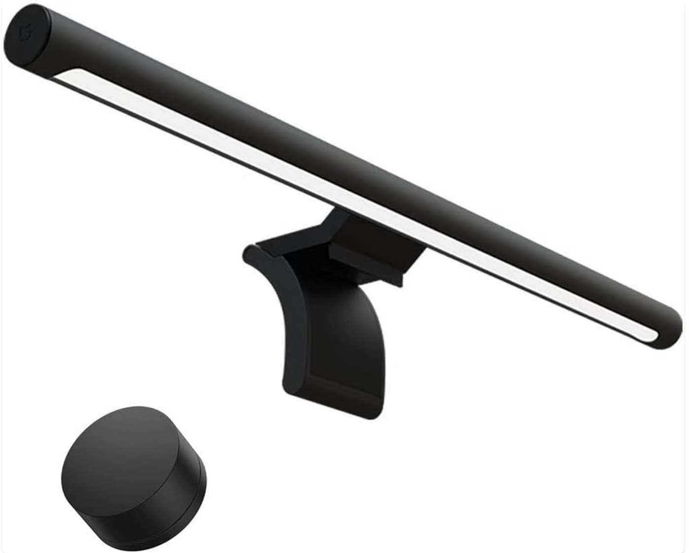
Image: The Xiaomi Mi Computer Monitor Light Bar and its accompanying wireless remote control.