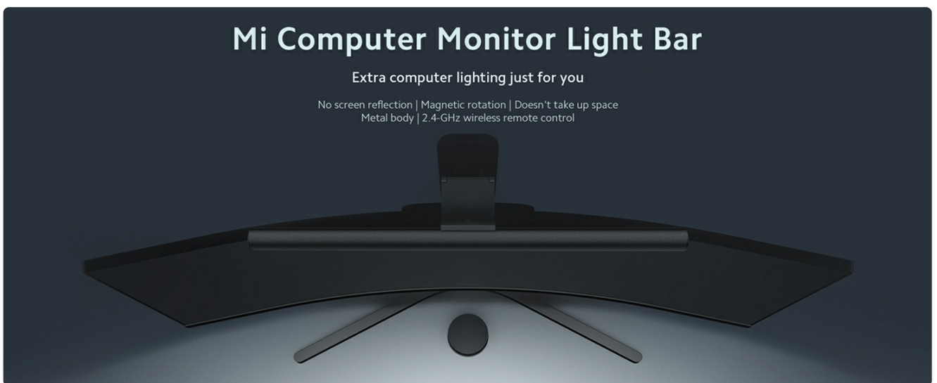
Image: Illustration demonstrating the asymmetric light distribution to prevent screen glare.