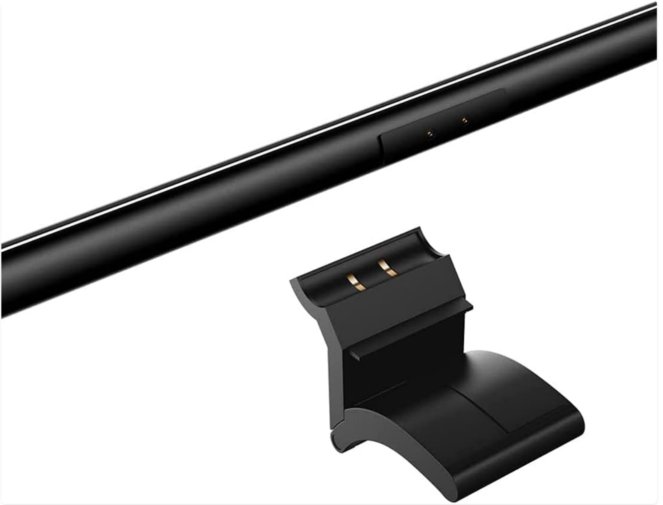
Image: Close-up of the magnetic connection points for easy attachment.