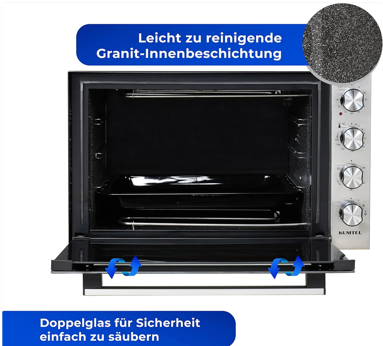
Image: The oven interior, highlighting the easy-to-clean granite coating and the double-glazed door for safety and maintenance.