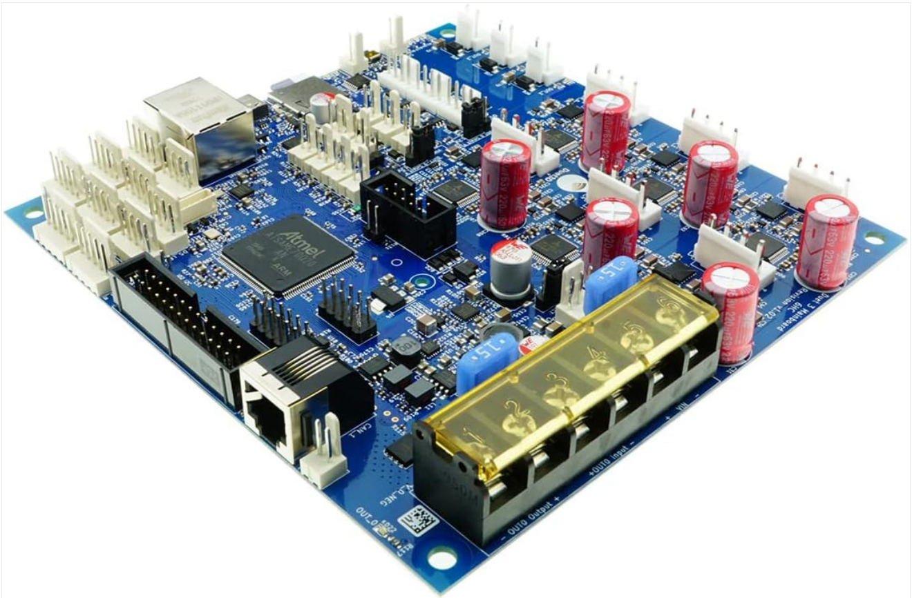
Figure 3: Side view of the Duet 3 Mainboard 6HC, illustrating the various input/output connectors and the Ethernet port.

Connect endstops, temperature sensors (thermistors, PT1000, or PT100/thermocouple with daughterboards), fans, and other peripherals to their respective I/O ports and PWM outputs. Pay close attention to pin assignments.