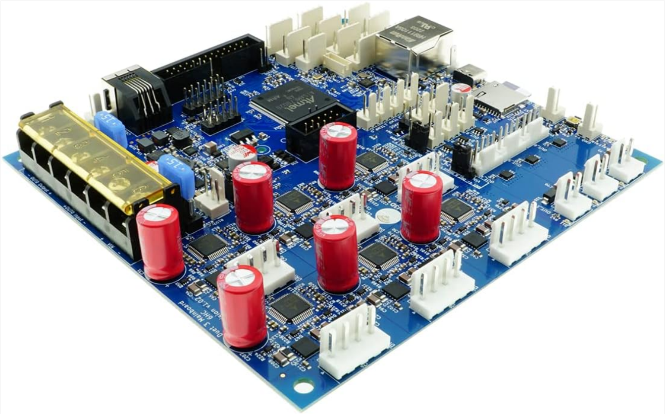
Figure 4: Angled view of the Duet 3 Mainboard 6HC, highlighting the various connectors and the microSD card slot for firmware and configuration storage.