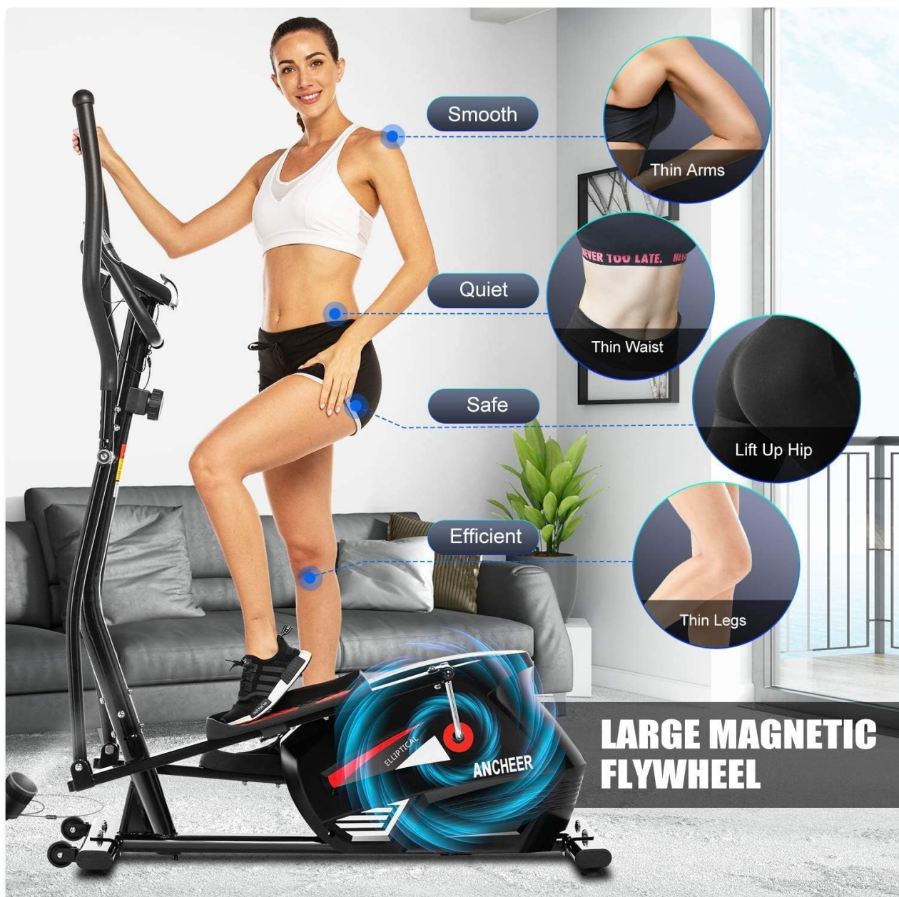
Image: Detailed view of the elliptical's construction, highlighting the sturdy chassis, transport wheels, and comfortable handlebars.