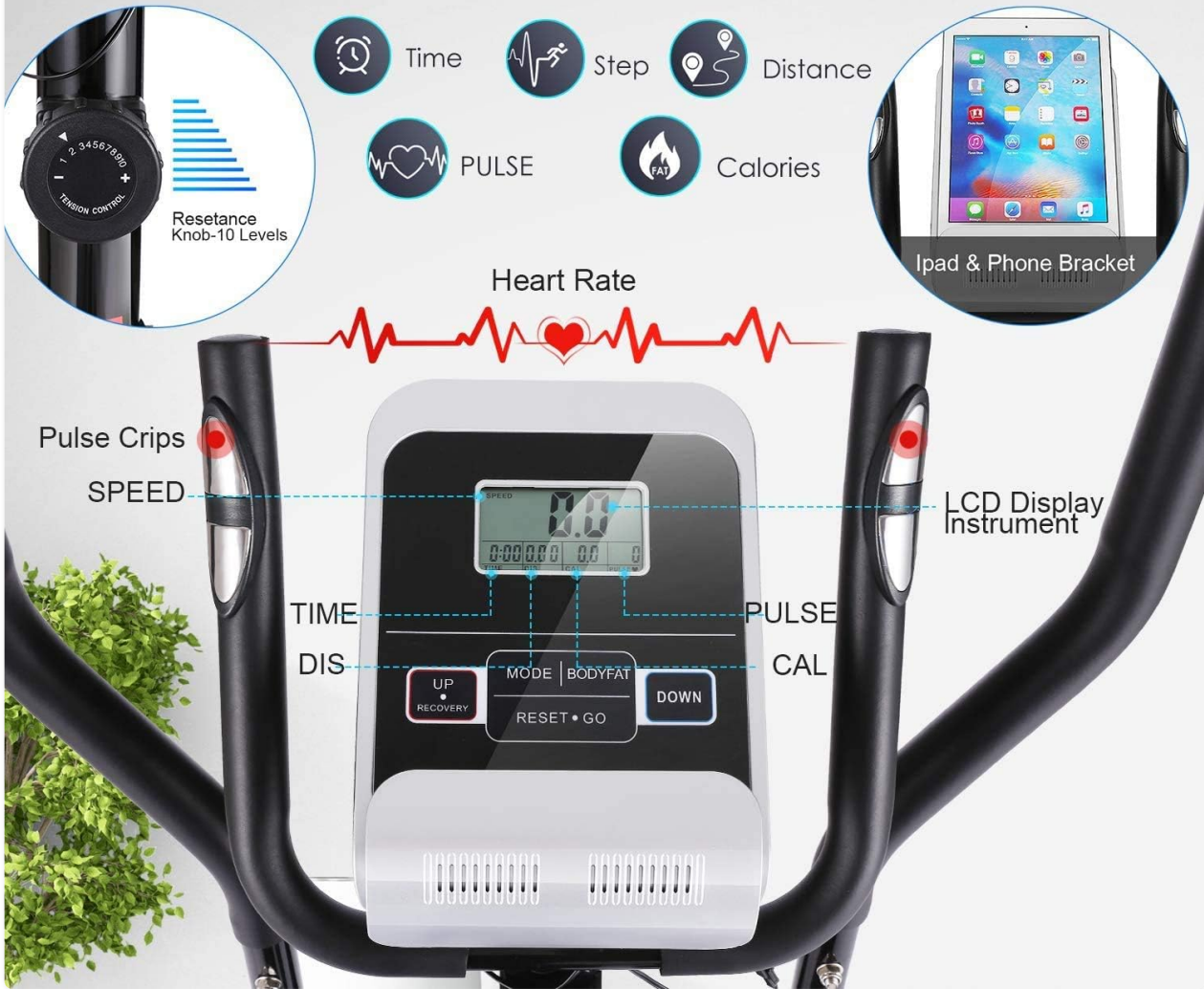
Image: The ANCHEER Magnetic Elliptical Trainer Machine, showcasing its overall design and structure.