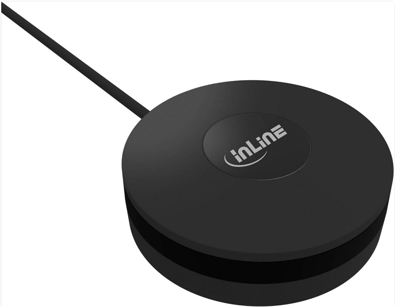
Figure 1: Top view of the InLine SmartHome IR Remote Control Center. This image shows the compact, black circular design of the device with the InLine logo prominently displayed on its top surface.