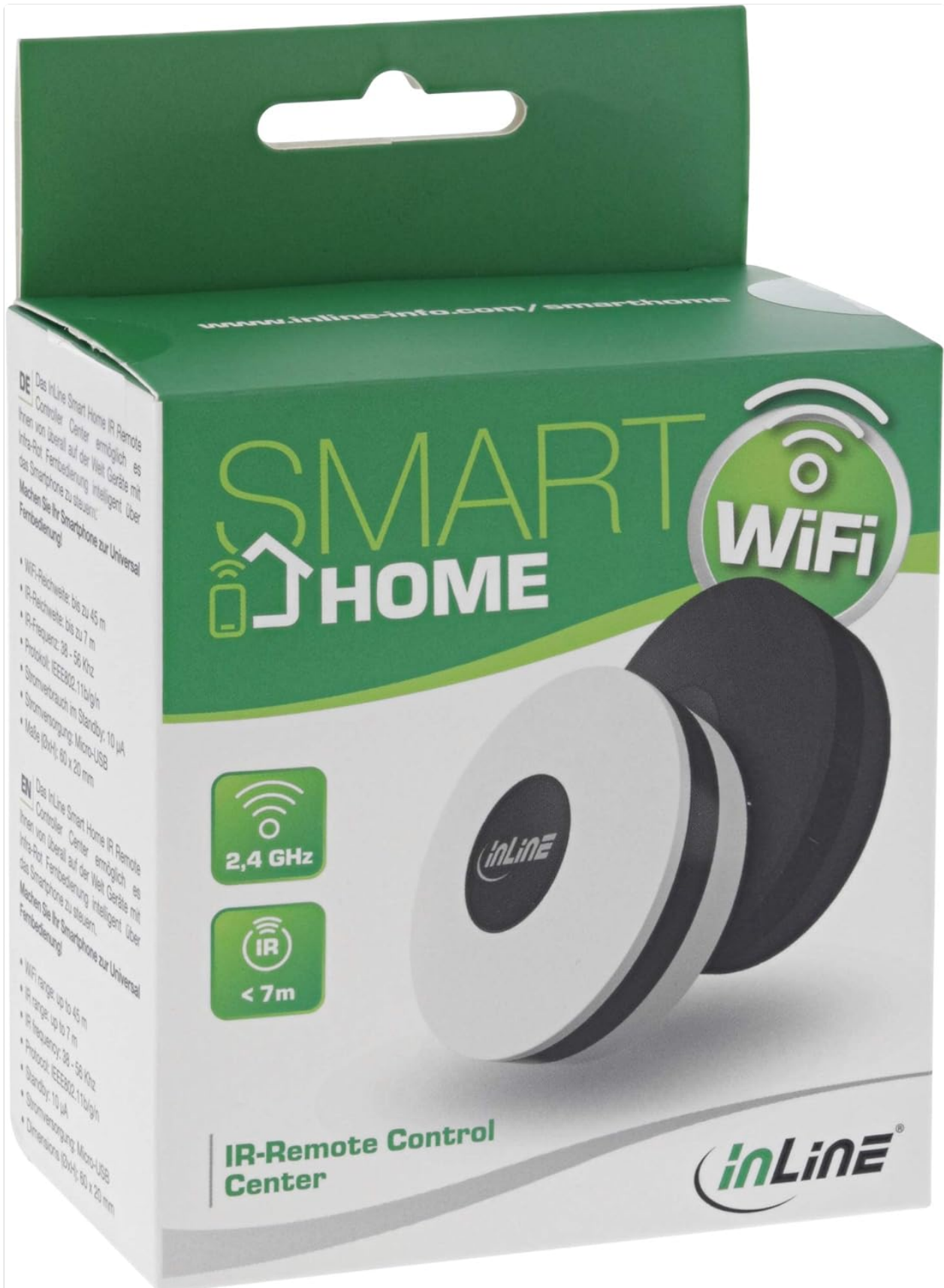
Figure 3: Product packaging illustrating key features. This image shows the retail box of the InLine SmartHome IR Remote