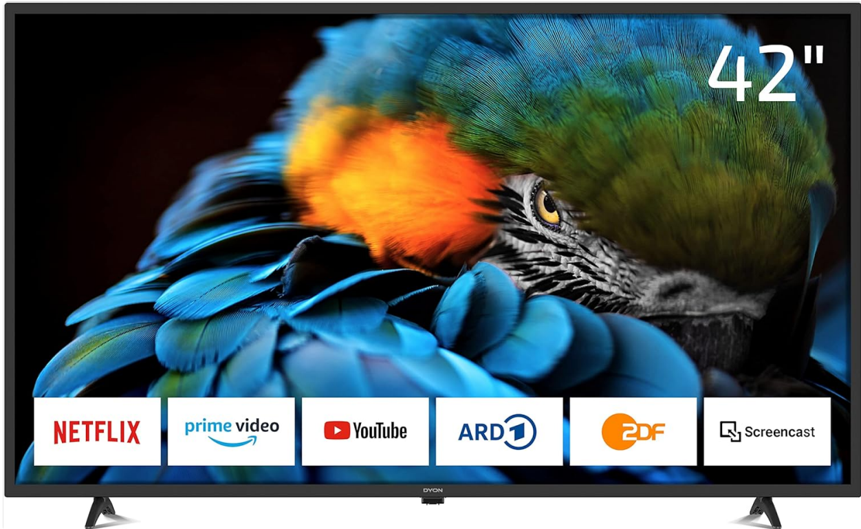
Figure 1: DYON Smart 42 XT Television with Stand