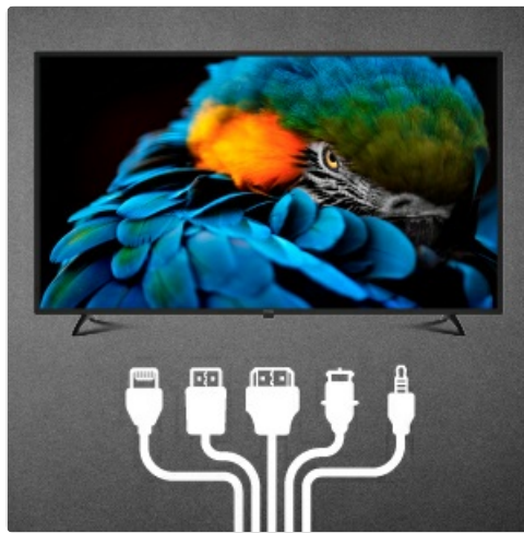
Figure 2: Example of TV Connections