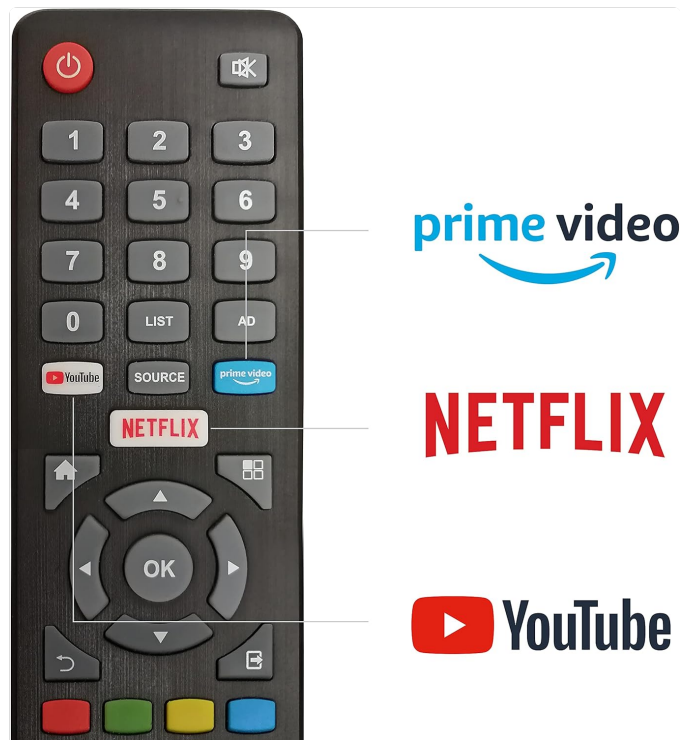
Figure 3: Remote Control Overview

The remote control allows you to access all TV functions. Insert the two AAA batteries into the remote control before use.