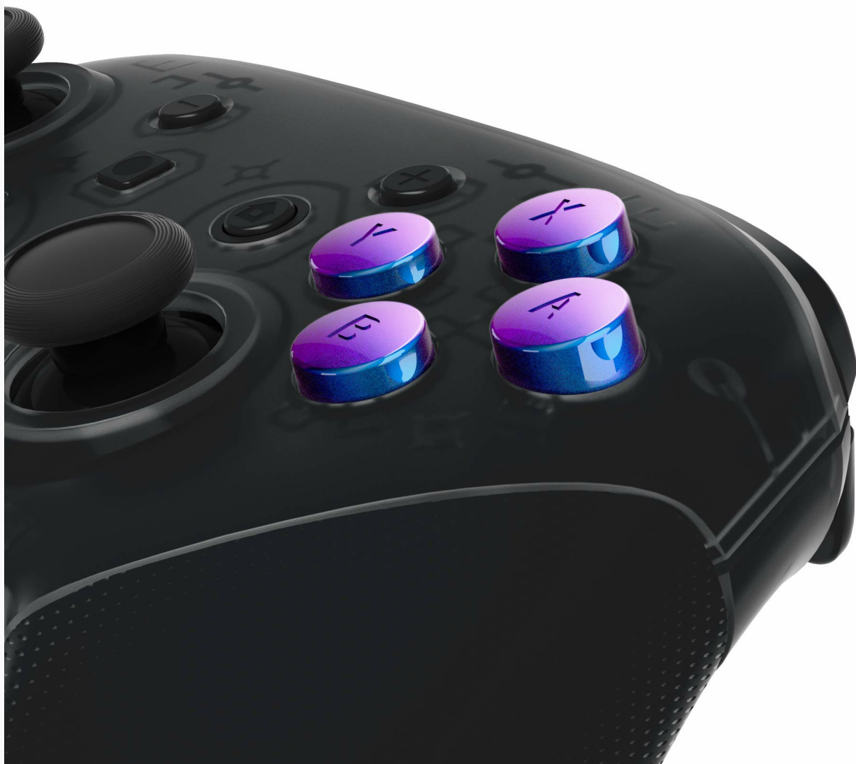
Image 1.1: eXtremeRate Chameleon Purple Blue Interchangeable ABXY Buttons.