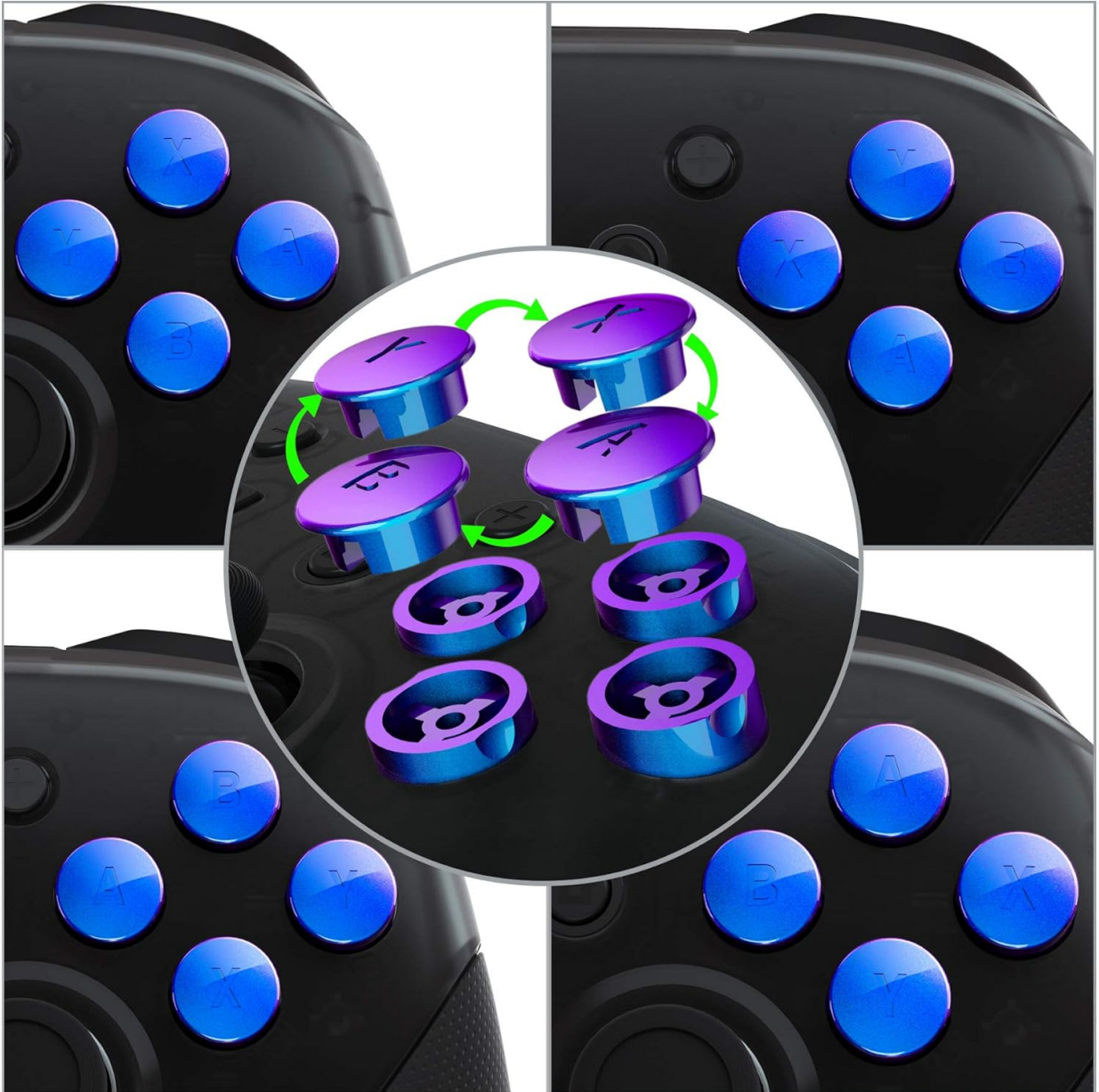
Image 3.1: Illustration of the interchangeable ABXY button components.

appropriately and no components are pinched.