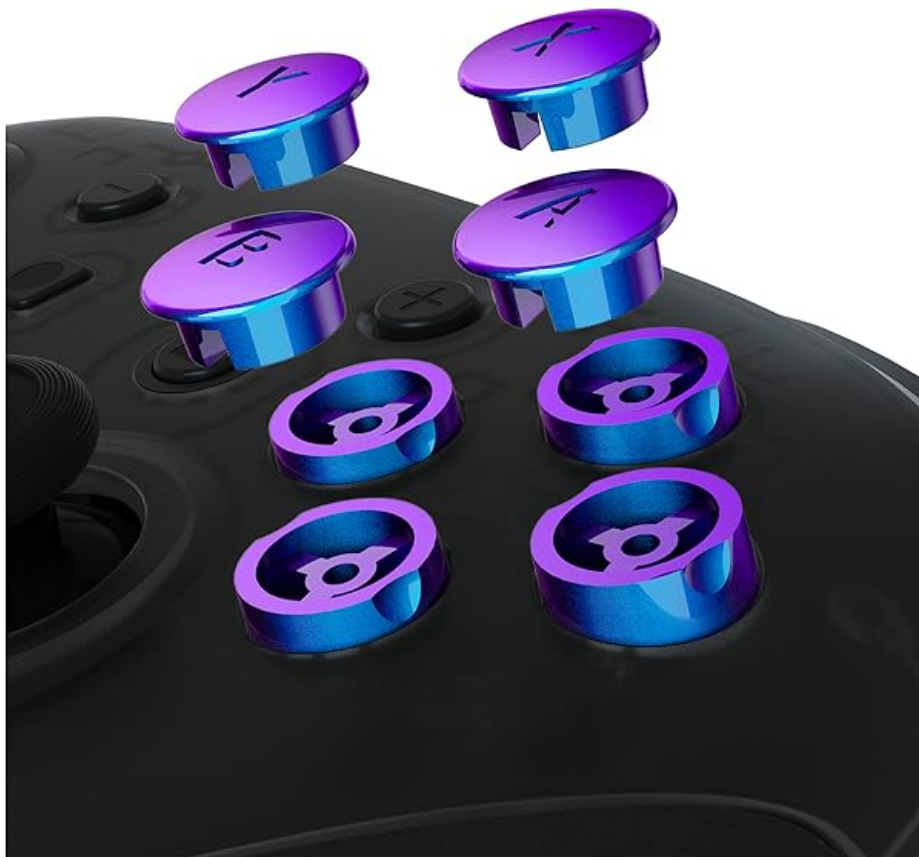
Image 3.2: View of the installed Chameleon Purple Blue ABXY buttons on a Nintendo Switch Pro Controller.