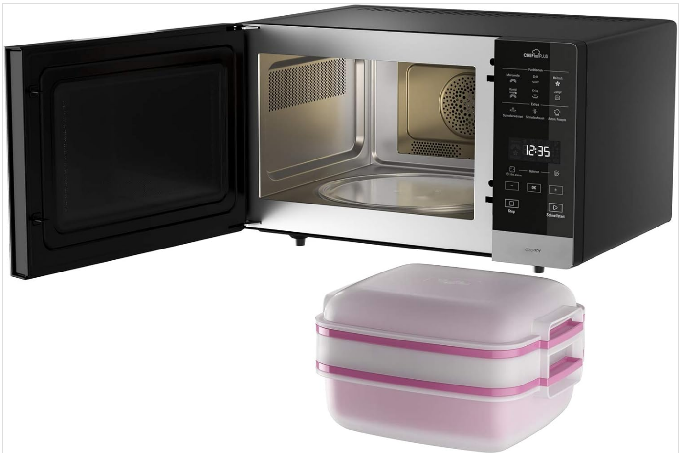
Image Description: The microwave oven with its door open, revealing the glass turntable inside. A separate crisp plate with a handle is shown next to the microwave.