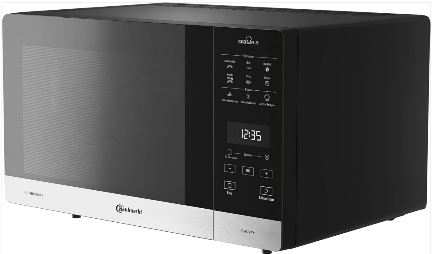
Image Description: A close-up view of the microwave's control panel, showing the digital display and various function buttons for microwave, grill, crisp, steam, and automatic programs.