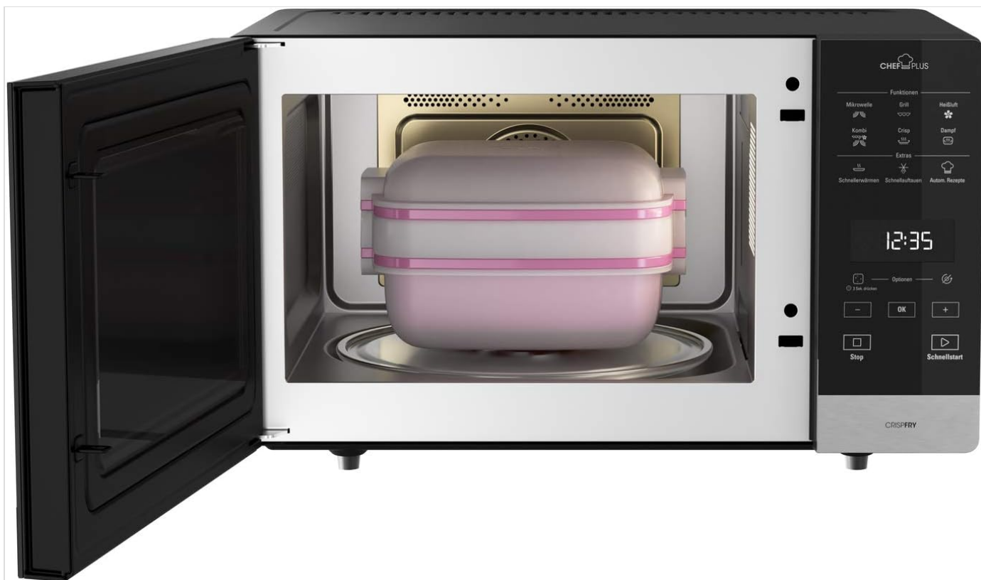
Image Description: The microwave oven with its door open, showing a two-tier pink and white steamer container placed inside on the turntable.