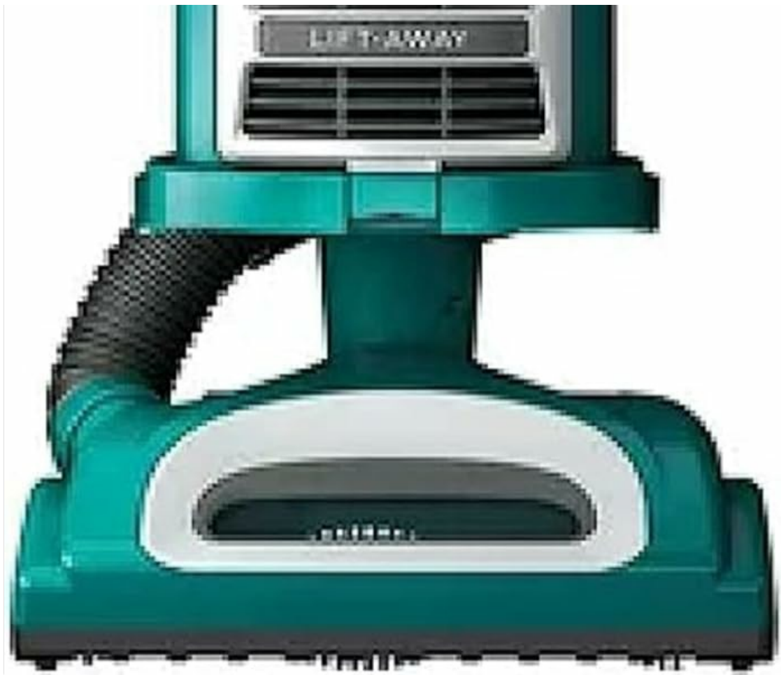
Image: Shark Navigator CU500 Upright Vacuum in use on a hard floor, demonstrating powerful suction.