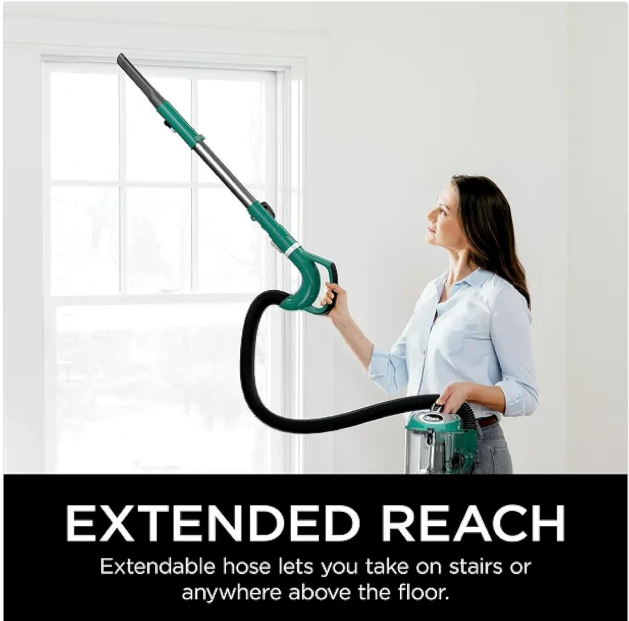
Image: A woman using the Shark Navigator CU500 in extended reach mode, demonstrating its ability to clean high surfaces like windowsills.

To activate Lift-Away mode, simply step on the release pedal and lift the canister away from the floor nozzle. This allows you to clean stairs, upholstery, and other above-floor areas with ease. Attach the appropriate accessory, such as the Pet Multi-Tool or Crevice Tool, to the end of the hose or wand for targeted cleaning.