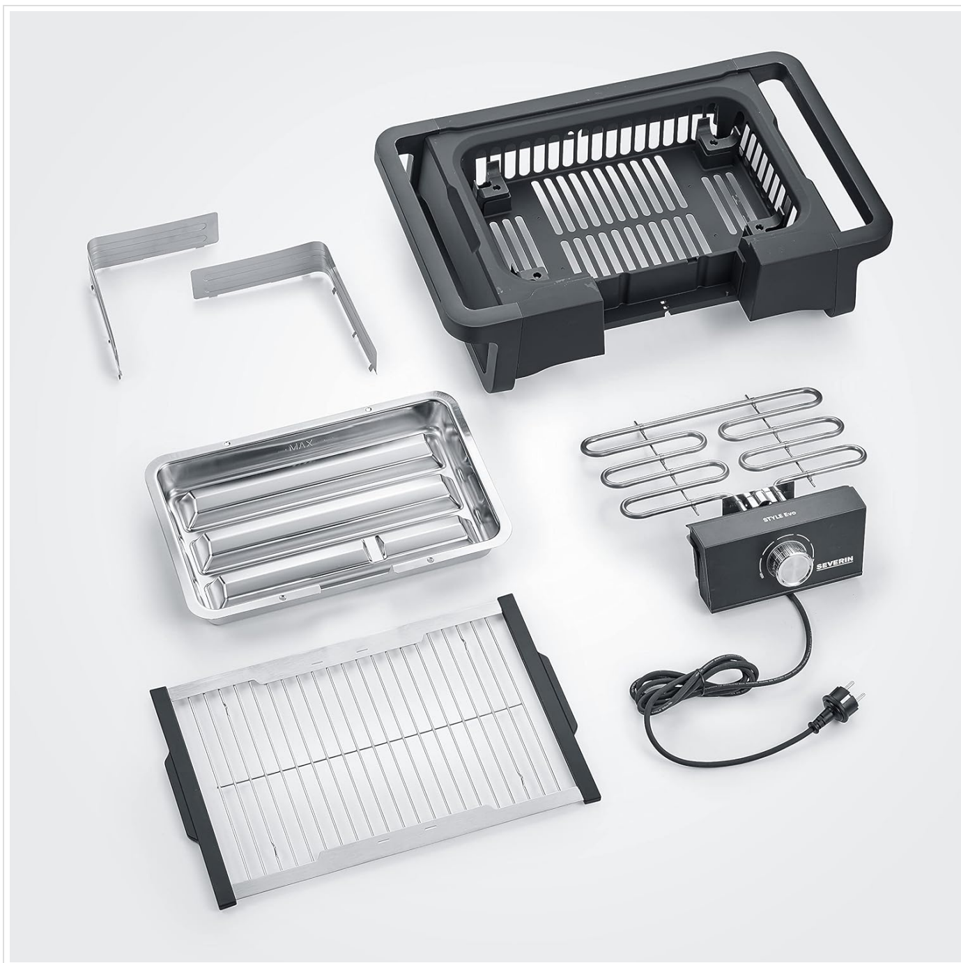
Image 6.1: The grill disassembled into its main components, illustrating how easily it can be taken apart for thorough cleaning.