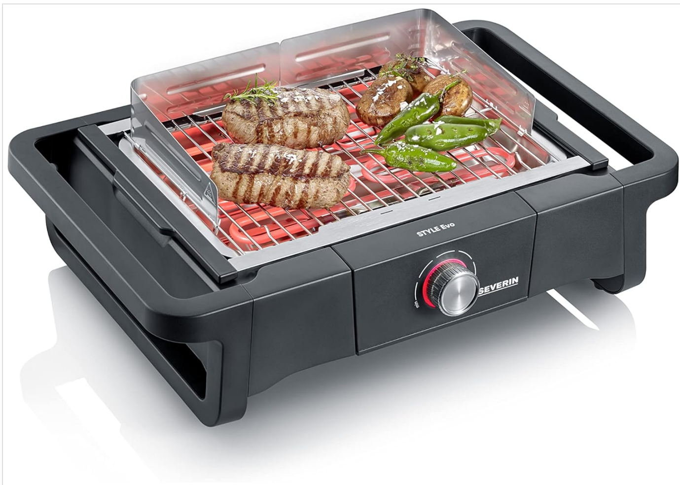
Image 5.2: A close-up view of food grilling on the hot surface of the SEVERIN Style Evo barbecue, showing the even heat distribution.