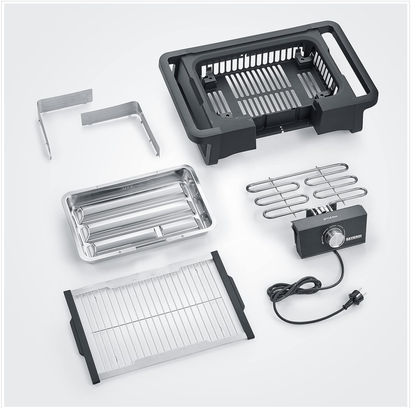
Image 4.1: View of the grill's components, including the main body, grill grate, heating element, reflector tray, and wind deflector, ready for assembly.