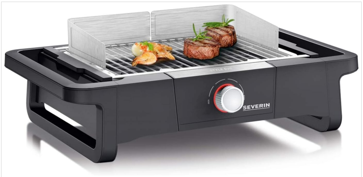
Image 1.1: The SEVERIN Style Evo PG 8123 Electric Barbecue, showcasing its compact design suitable for various settings.

Thank you for choosing the SEVERIN Style Evo PG 8123 Electric Barbecue. This appliance is designed for both indoor and outdoor grilling, offering fast heating and optimal heat distribution for excellent cooking results. Please read this instruction manual carefully before using the appliance for the first time to ensure safe operation and to achieve the best performance.