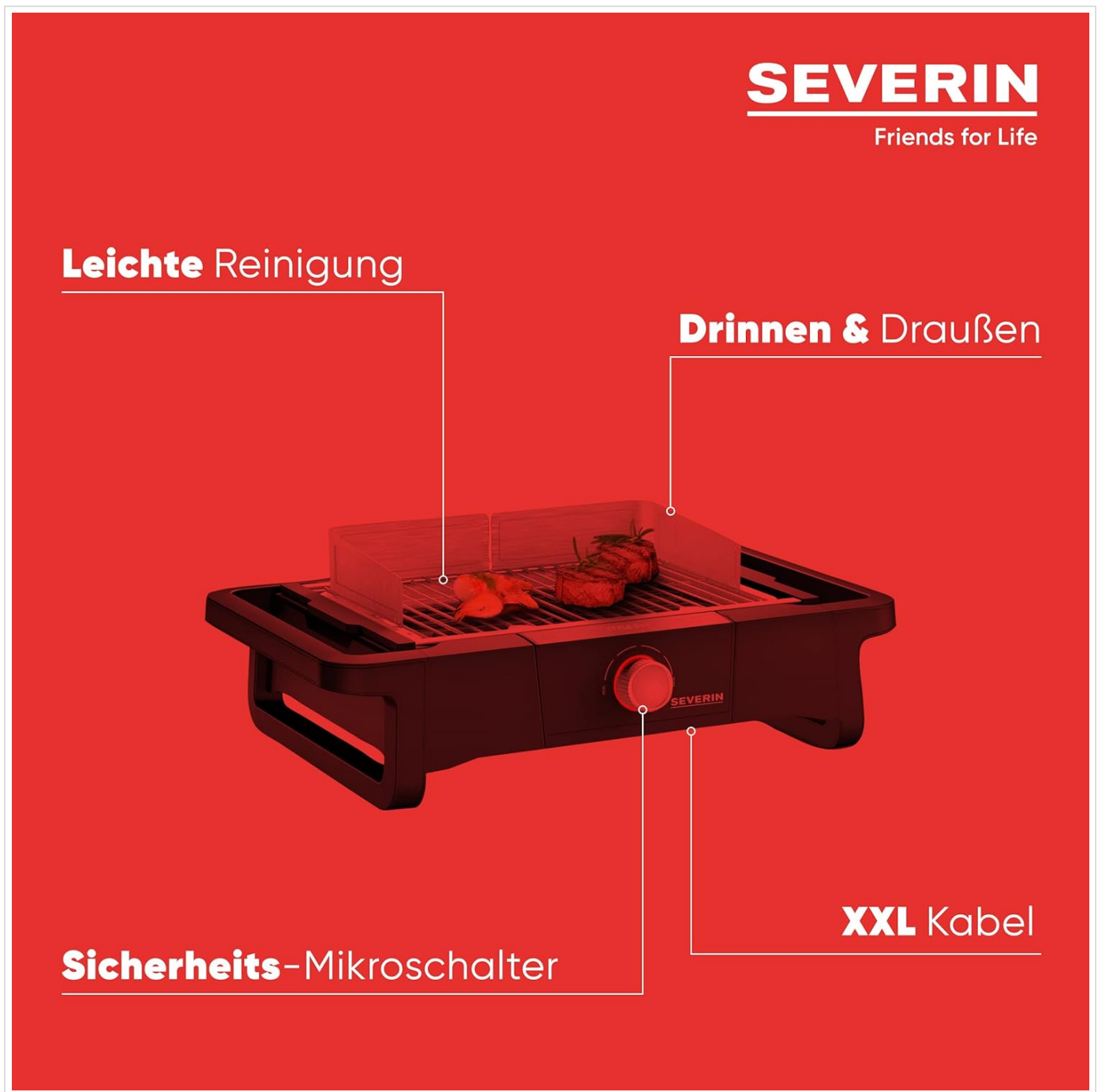
Image 3.1: Diagram illustrating key features such as easy cleaning, indoor/outdoor suitability, safety micro-switch, and extra-long cable.