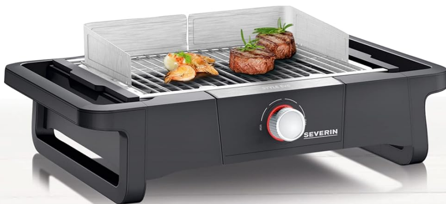
Image 2.1: Illustration highlighting the SafeTouch housing for reduced burn risk and the innovative reflector tray for optimal heat distribution.

Innovative Reflektorschale für optimale Wärmeverteilung