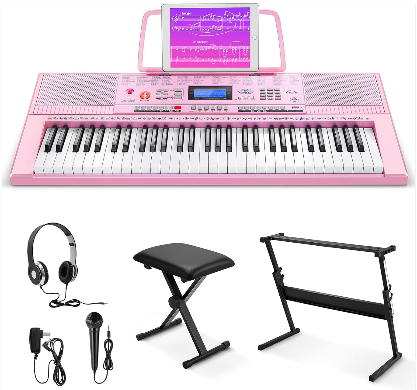
Image: The complete Eastar EK-620 Electronic Keyboard Piano Kit, showing the pink 61-key keyboard, a black adjustable stand, a black padded bench, headphones, a microphone, and a power adapter.