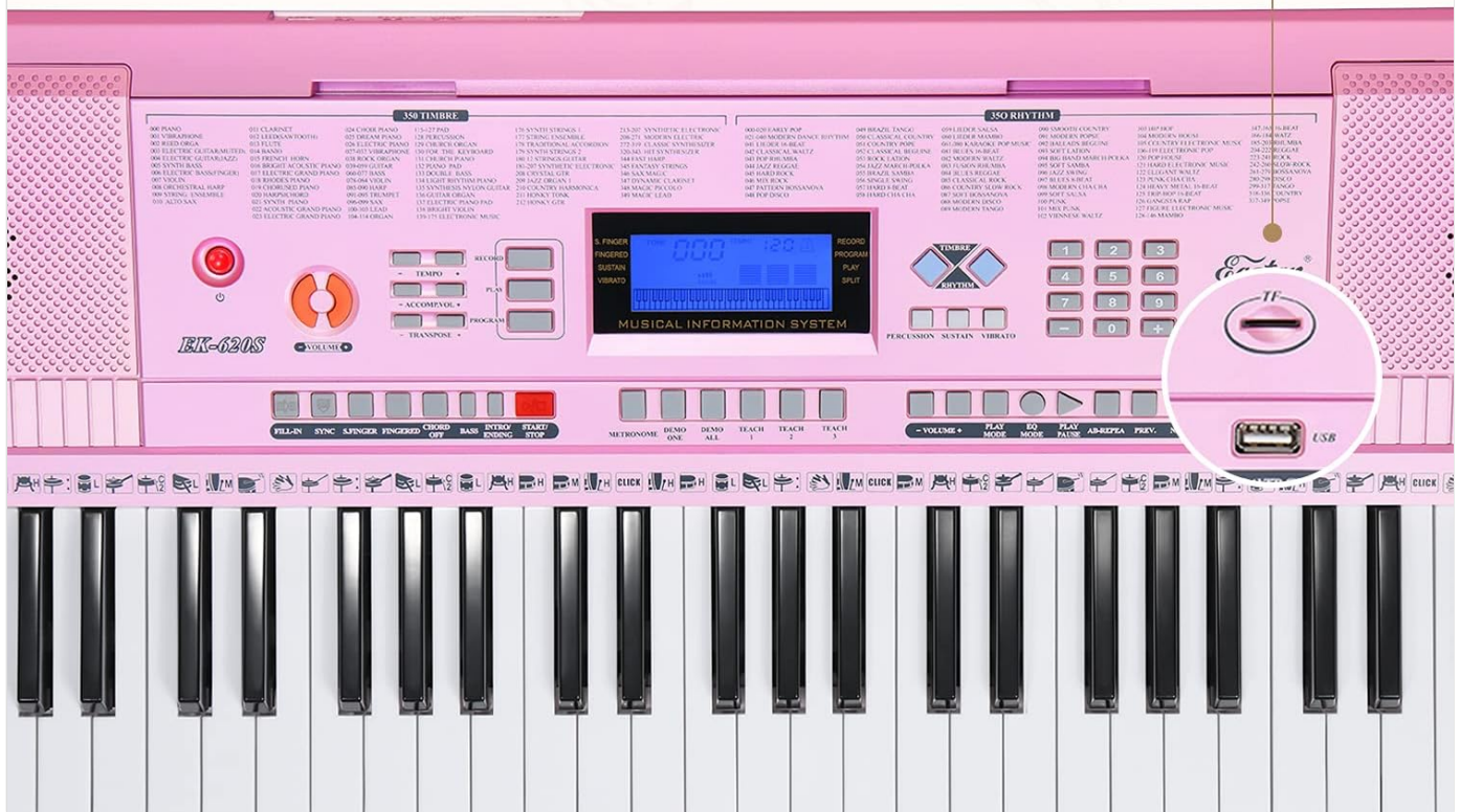
Image: The control panel of the Eastar EK-620 keyboard, displaying extensive lists of 350 available tones and 350 rhythms, alongside indicators for USB and SD card jacks.