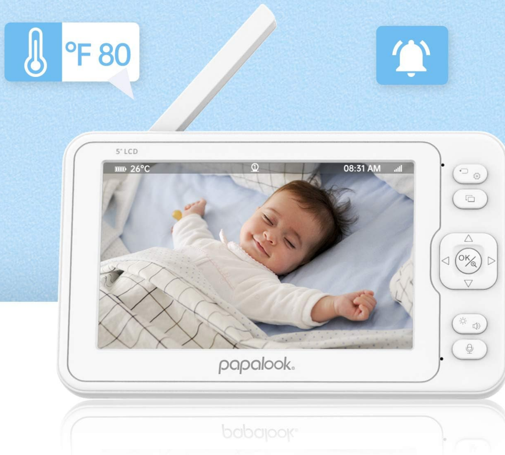
Image 5.3: Illustration of the two-way audio function, enabling communication between parent and baby.