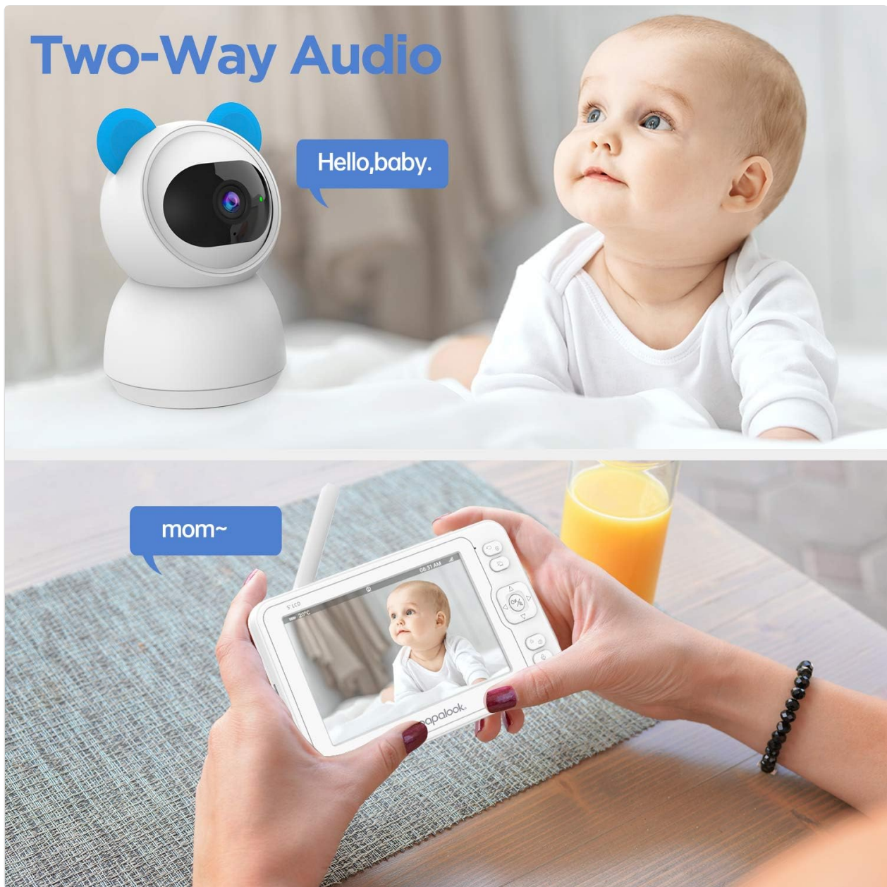
Image 5.1: The camera unit showcasing its wide-angle and pan-tilt-zoom (PTZ) capabilities.