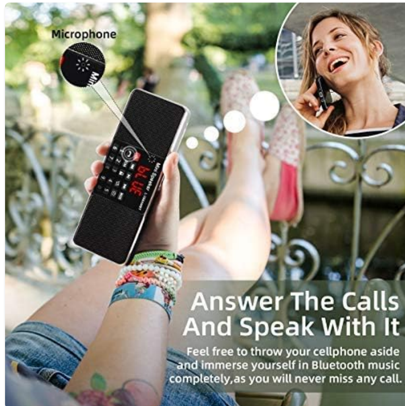
Image 5.3: PRUNUS J-288 demonstrating its hands-free calling feature via Bluetooth.