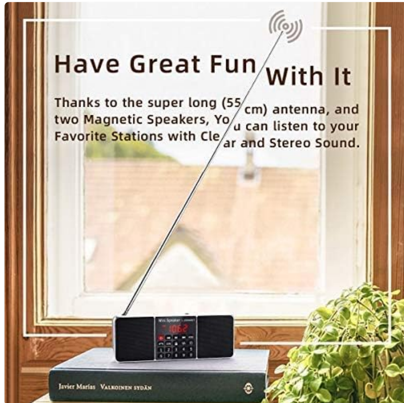
Image 5.1: PRUNUS J-288 with its telescopic antenna extended for improved radio reception.