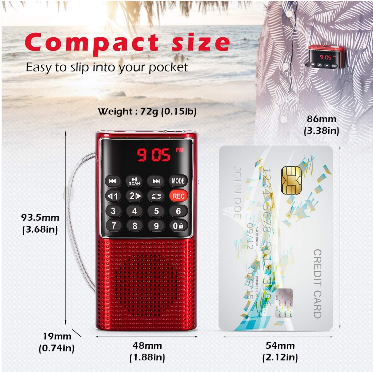
Figure 2.1: The compact size of the PRUNUS J-328, demonstrating its portability. Dimensions are approximately 93.5mm (3.68in) height, 48mm (1.88in) width, and 19mm (0.74in) depth, weighing 72g (0.15lb).