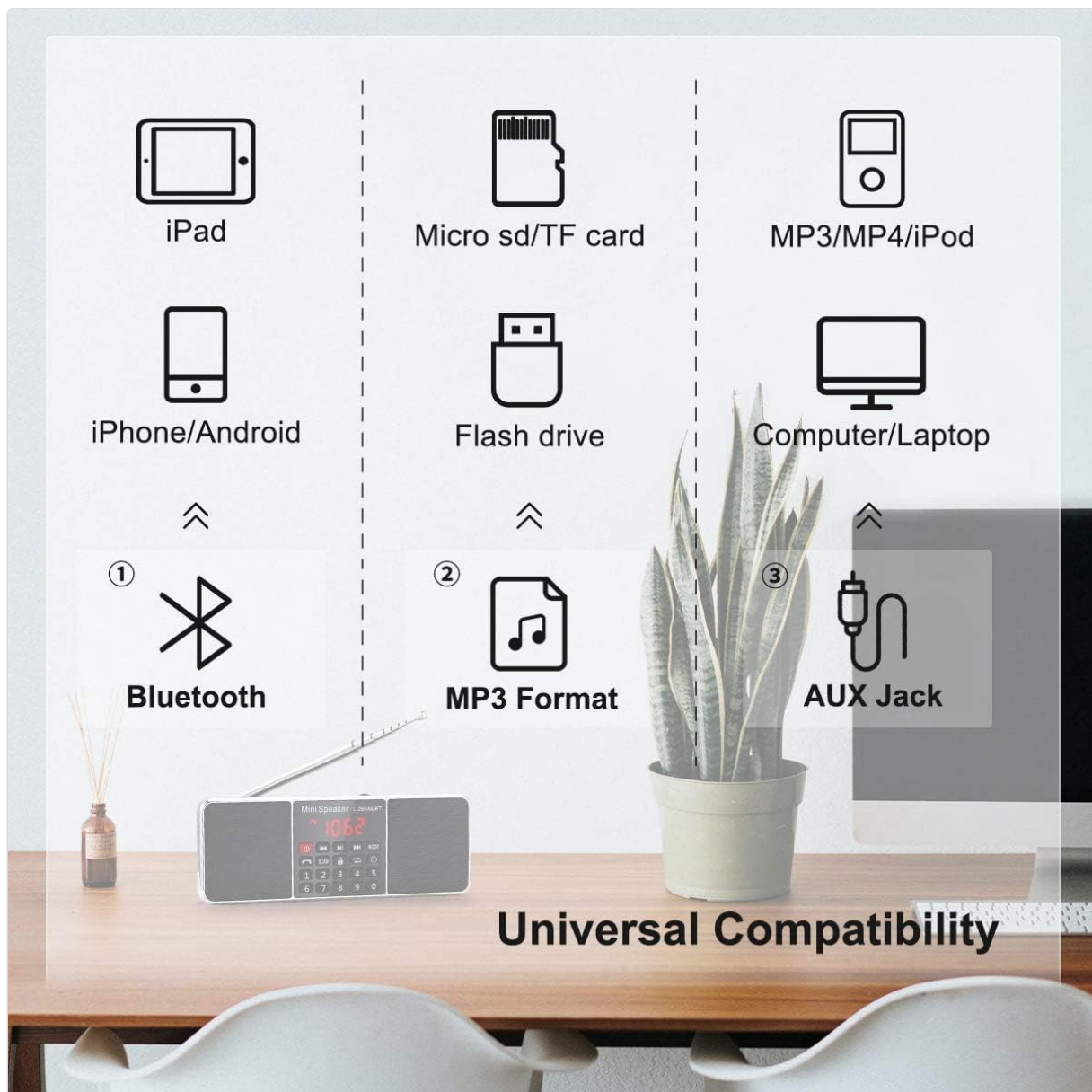
Figure 4.2: The PRUNUS J-288 offers universal compatibility, supporting Bluetooth connectivity for smartphones/tablets, MP3 format playback from TF cards/USB drives, and audio input via AUX jack.