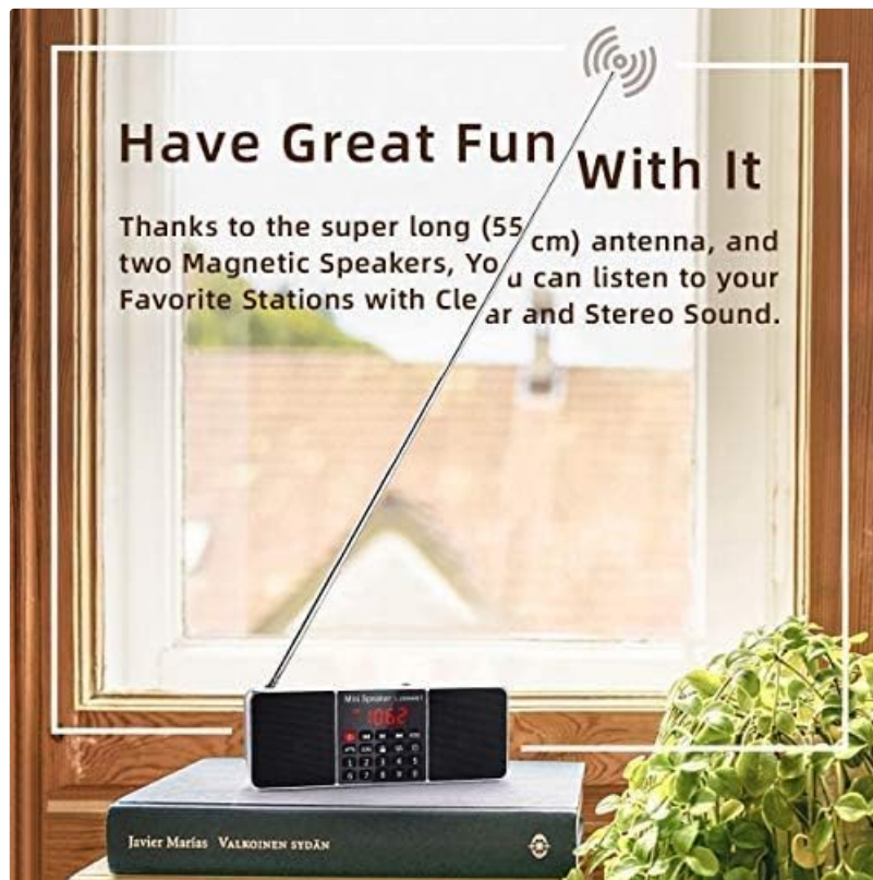
Figure 2.3: The PRUNUS J-288 with its telescopic antenna extended, designed for optimal reception of radio signals.