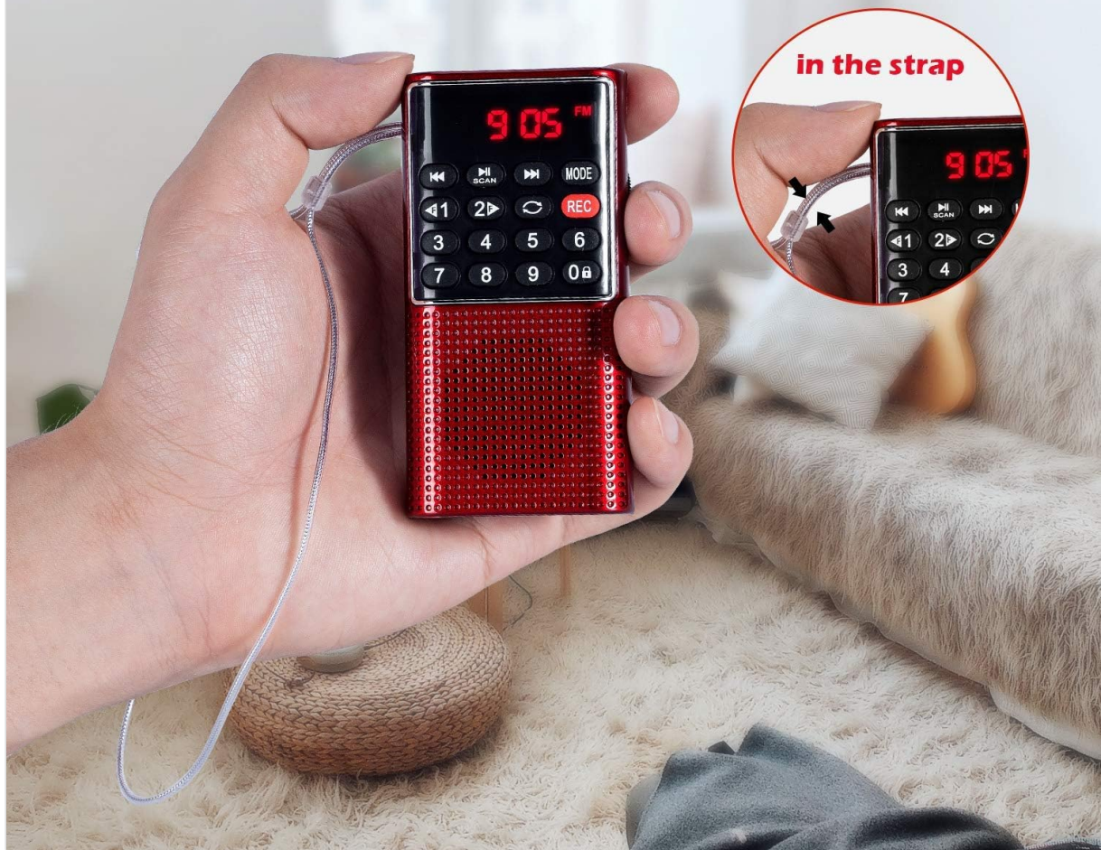
Figure 2.2: The hidden antenna of the PRUNUS J-328, designed for durability and portability, integrated into the device's strap.

Equipped with a portable hidden antenna ,simple, stylish and not easy to break.