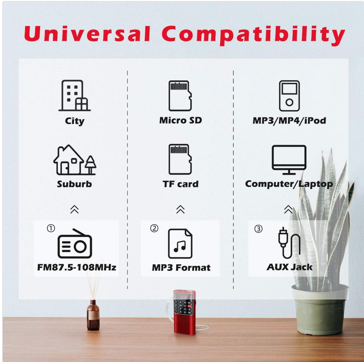
Figure 4.1: The PRUNUS J-328 supports FM radio, MP3 format playback from TF cards, and audio input via AUX jack, offering versatile listening options.