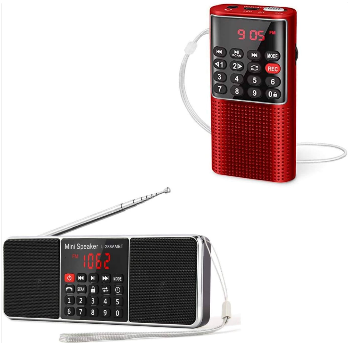
Figure 1.1: PRUNUS J-288 (bottom) and J-328 (top) portable radios. The J-288 features a telescopic antenna and a larger display, while the J-328 is more compact with a hidden antenna.