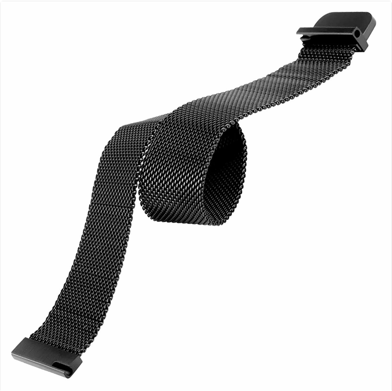
Figure 2: Close-up view of the woven mesh stainless steel material, highlighting its soft and breathable texture.