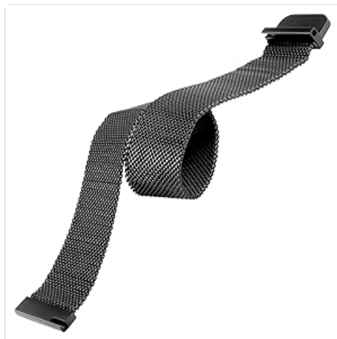
Figure 6: The strap is designed for comfort and a gentle feel around your wrist.