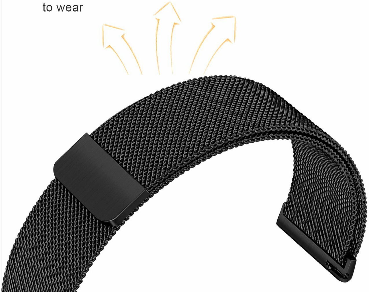
Figure 3: The strong magnetic clasp ensures the strap remains securely fastened, preventing accidental slip-off.

Fashion, Soft & Breathable, no hair stuck and comfortable to wear