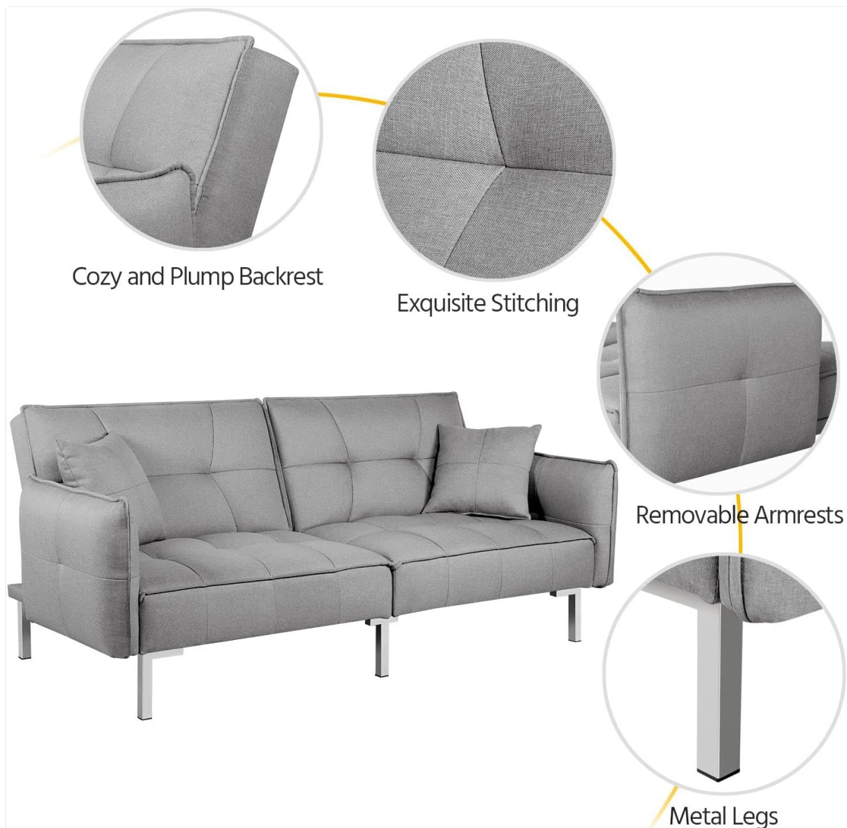
Image: A close-up view of the futon's linen fabric and exquisite stitching, highlighting the texture and quality of the upholstery.

This image provides a detailed look at the linen fabric and the quality of the stitching, which is important for understanding the material and its care requirements.