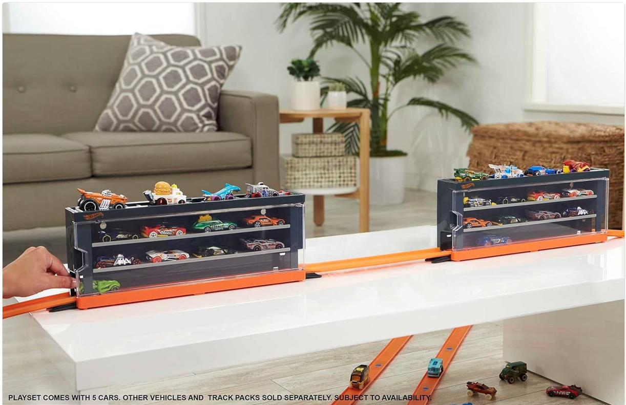
Image: A car being launched from the display case directly onto a Hot Wheels track.

PLAYSET COMES WITH 5 CARS. OTHER VEHICLES AND TRACK PACKS SOLD SEPARATELY. SUBJECT TO AVAILABILITY.