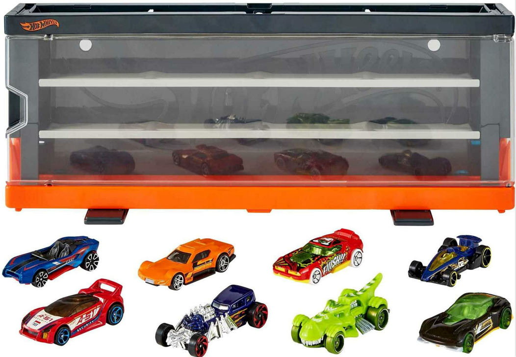
Image: Hot Wheels Display Case, showcasing its design and included cars.