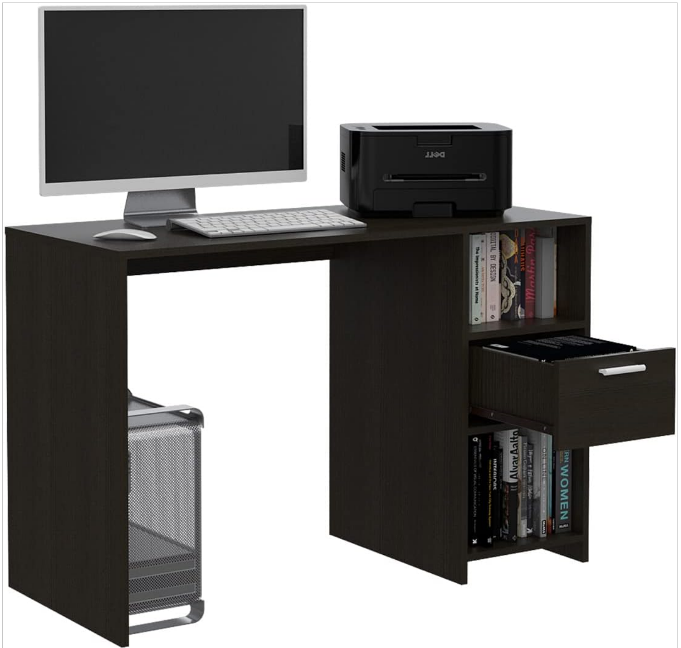
Image 5.2: The desk with its drawer open and shelves utilized for storage.