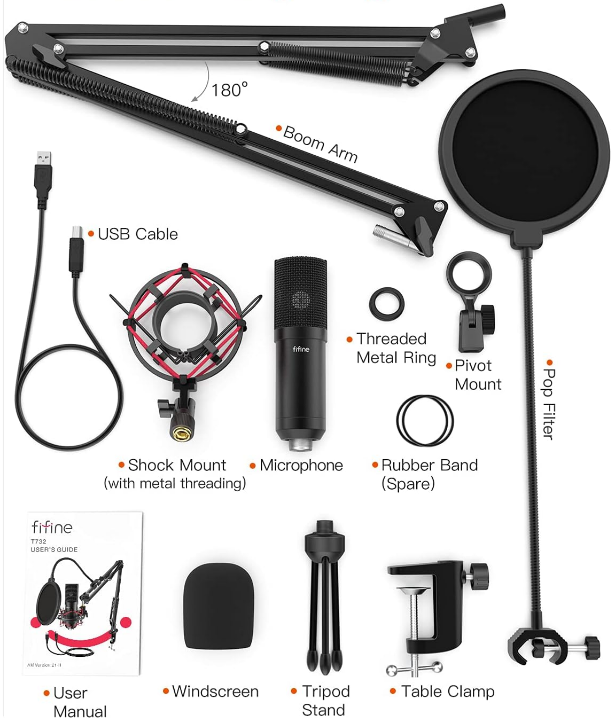
Figure 1: All components included in the FIFINE T732 USB Microphone Set, including the microphone, boom arm, shock mount, pop filter, and cables.