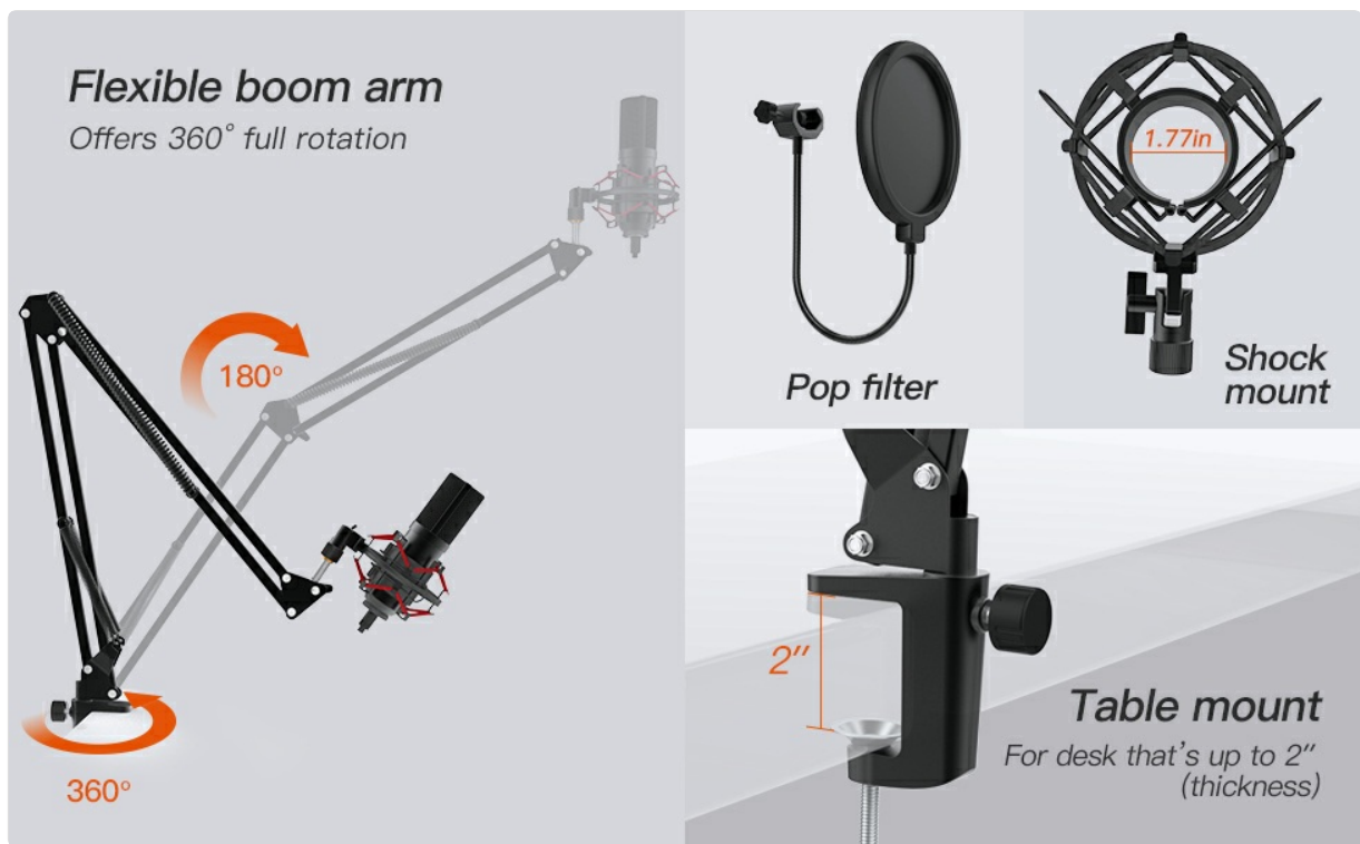
Figure 2: The flexible boom arm provides 360-degree rotation and can be mounted to desks up to 2 inches thick.

Your browser does not support the video tag.