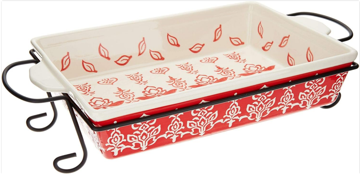
Image: Large baker in its wire serving holder.

The black wire holder is intended for the large baker to facilitate serving and transport from the kitchen to the dining table. Place the large baker securely into the holder before moving. The holder is not intended for oven use.