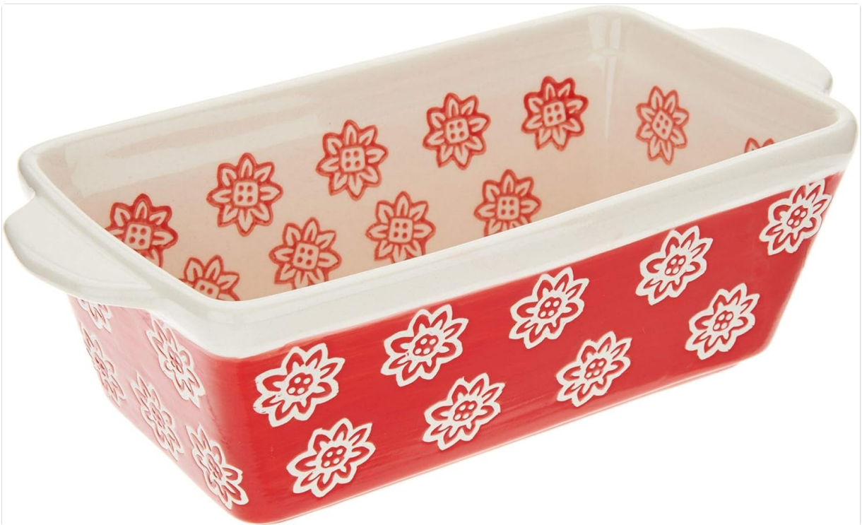
Image: Small rectangular baker.