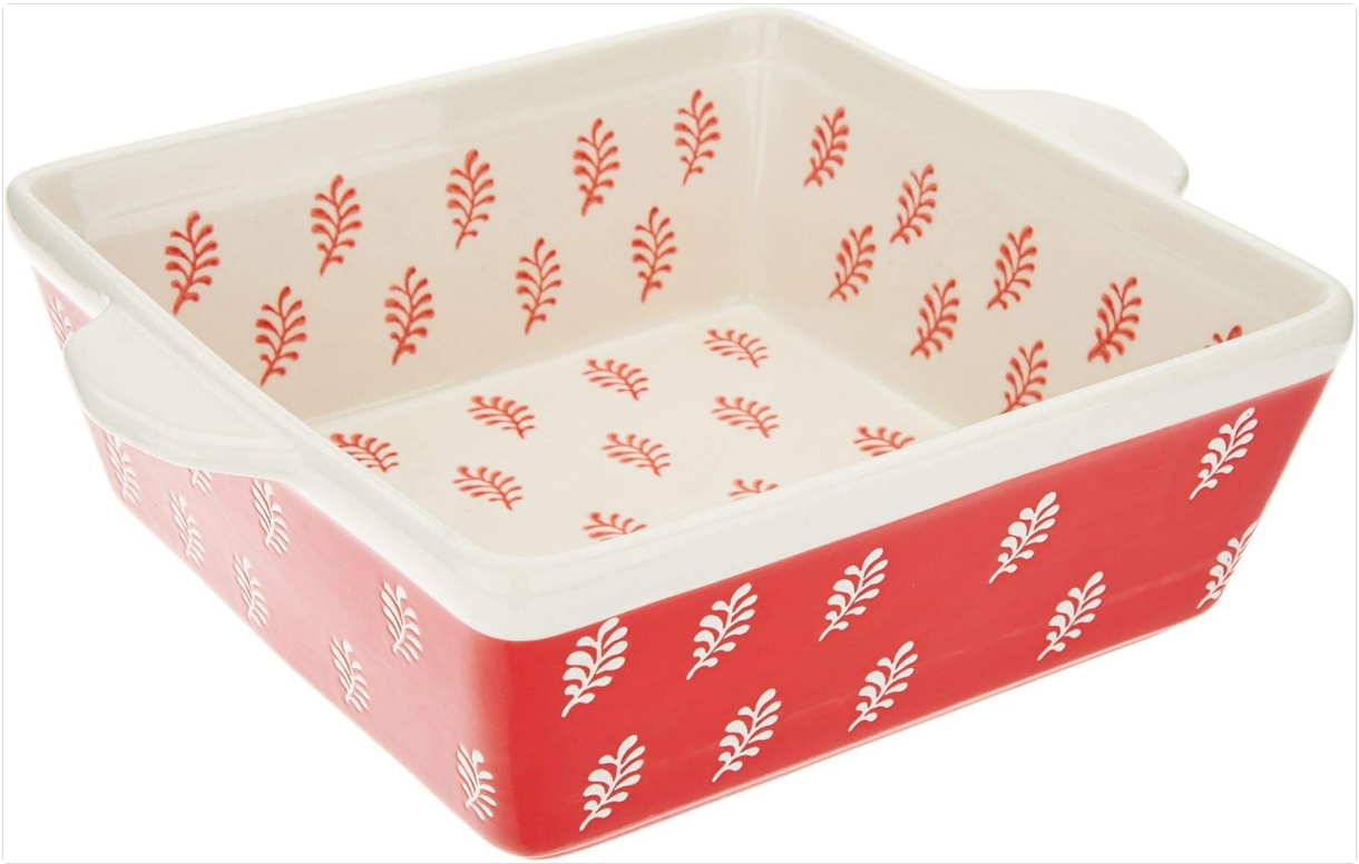
Image: Medium square baker.