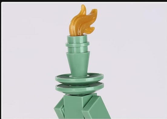
The flame of the torch