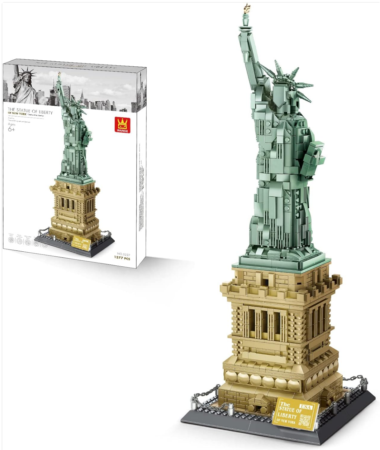
The Wange Building Block Statue of Liberty Model 5227, showcasing the completed model and its packaging.