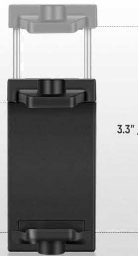
Image: How to use the detachable rear clip and its compatibility with different phone models.