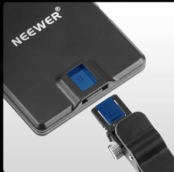
Insert the base clip into the LED light

Can be fixed on your phone or computer without blocking the camera