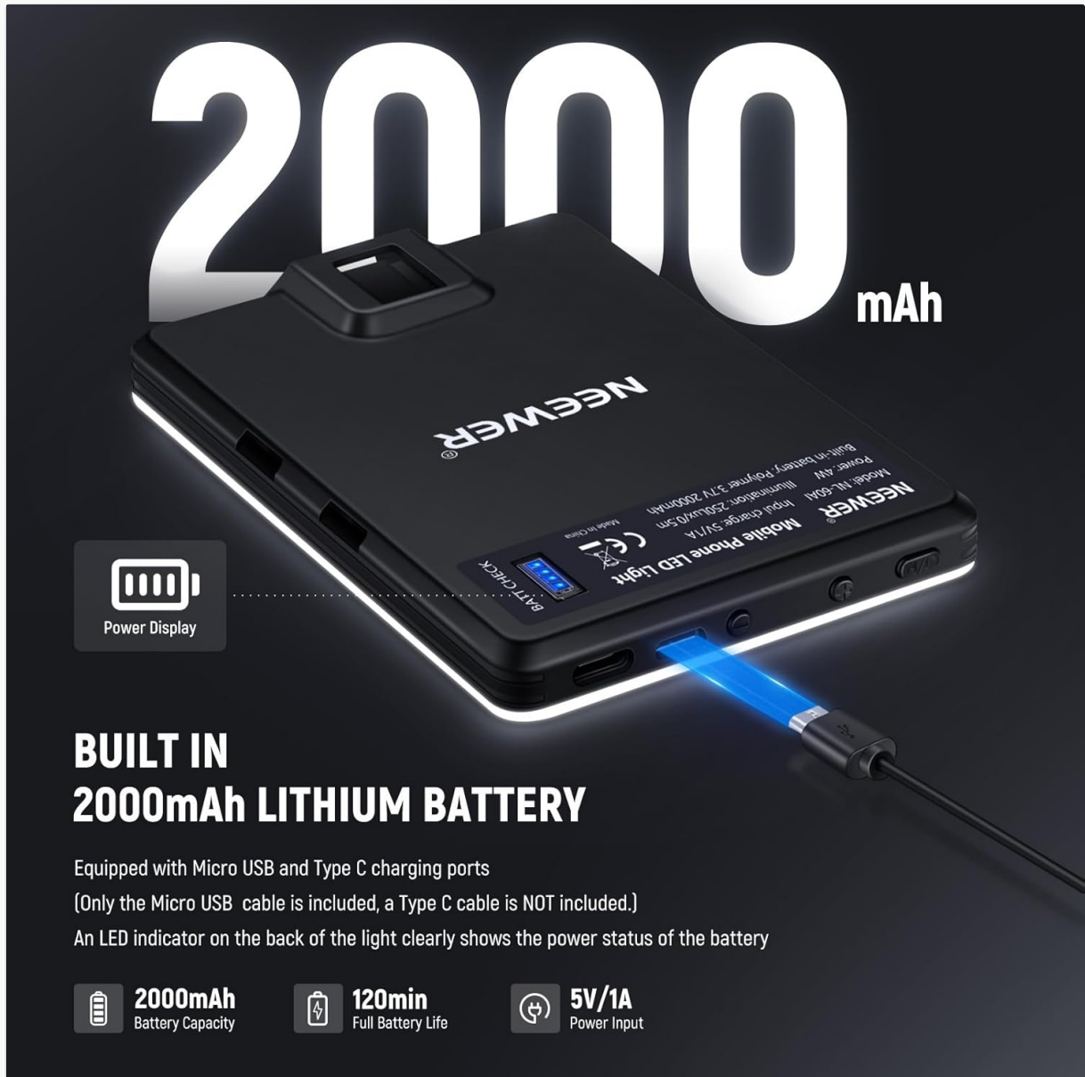
Image: The light's built-in battery and charging interface.