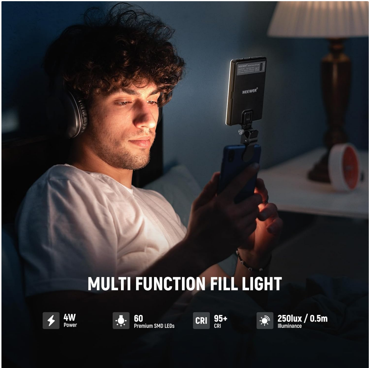
Image: Overview of the light's multi-function capabilities and specifications.