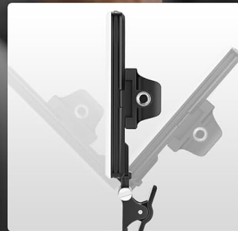
Adjust the front and back tilt of the LED light

Image: Detailed steps for attaching and adjusting the front clip.