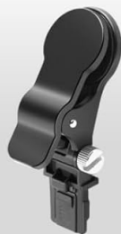
1 x Front Clamp