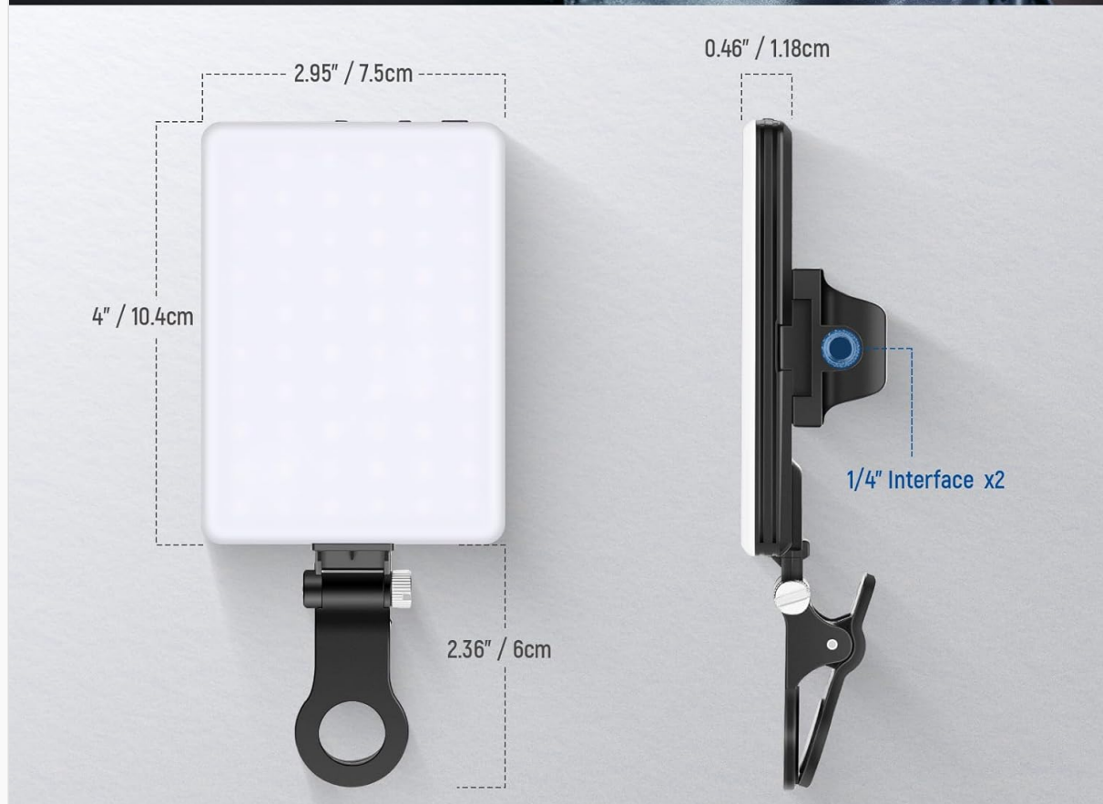
Image: Dimensions and weight of the NL-60AI Selfie Light.