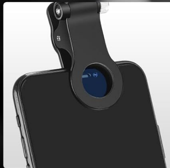
The base clip opens at an angle to clamp the phone