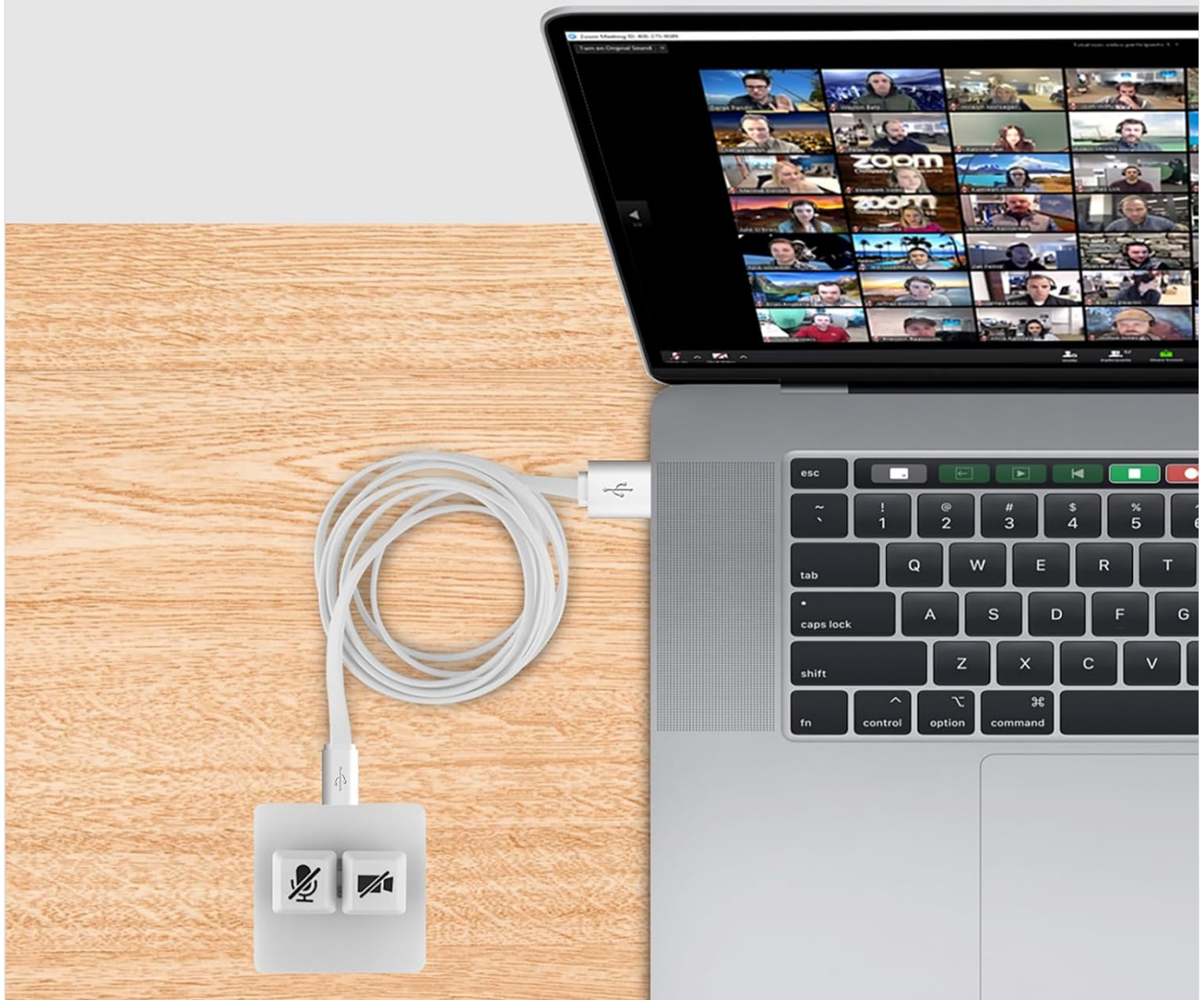
Image: The Linkidea controller connected to a MacBook Pro, demonstrating its plug-and-play USB-A connection.