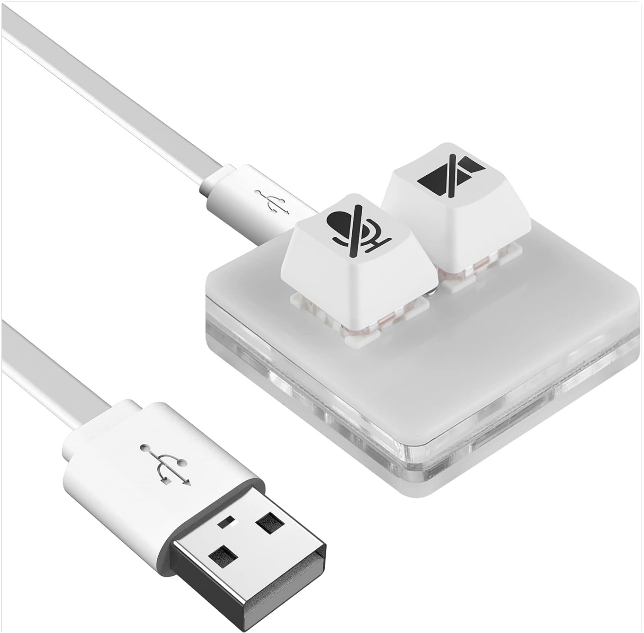
Image: The Linkidea USB Zoom Meeting Mute Button with its connected USB cable, ready for use.