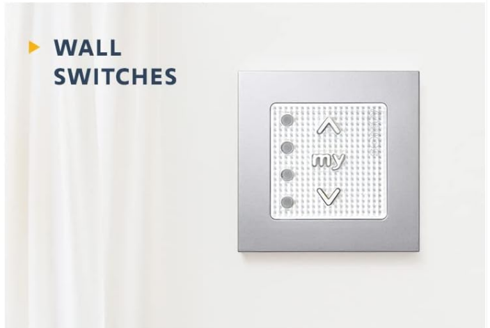
Image: The Somfy remote being used to control interior window treatments, demonstrating its application.