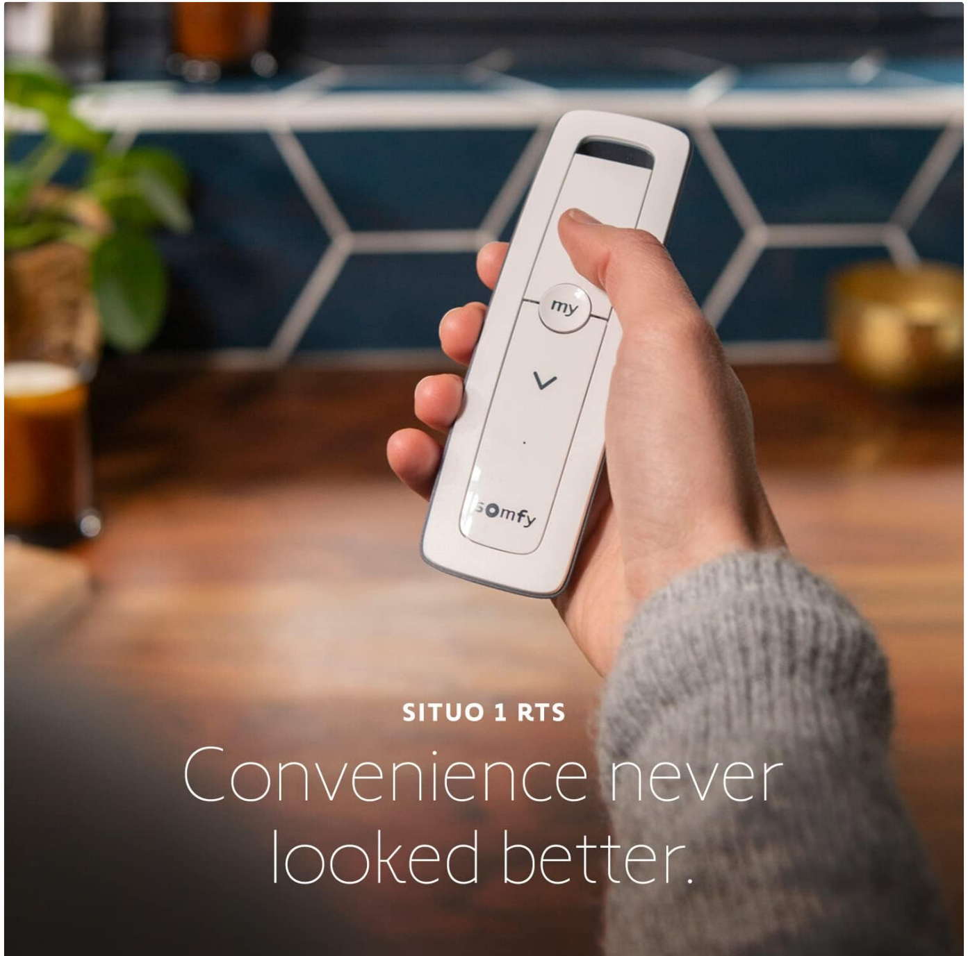
Image: A hand holding the Somfy Situo 1 RTS remote, demonstrating its ergonomic design.

Note: If you do not have an existing remote, or if the motor is new, refer to the specific motor's instructions for putting it into initial programming mode. This often involves a brief power cycle.