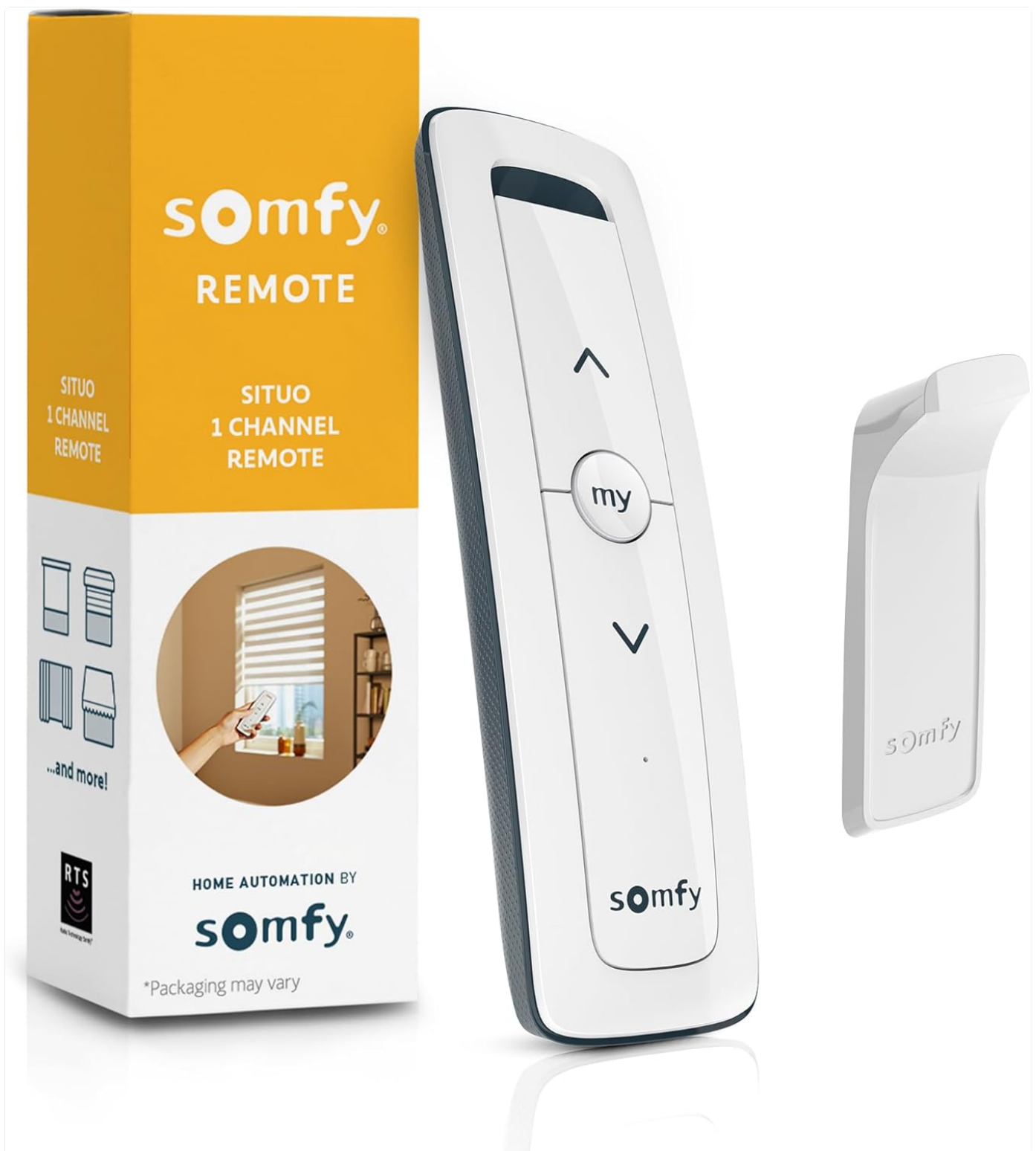
Image: The Somfy Remote Situ 1 Pure, its retail packaging, and the included wall holder.