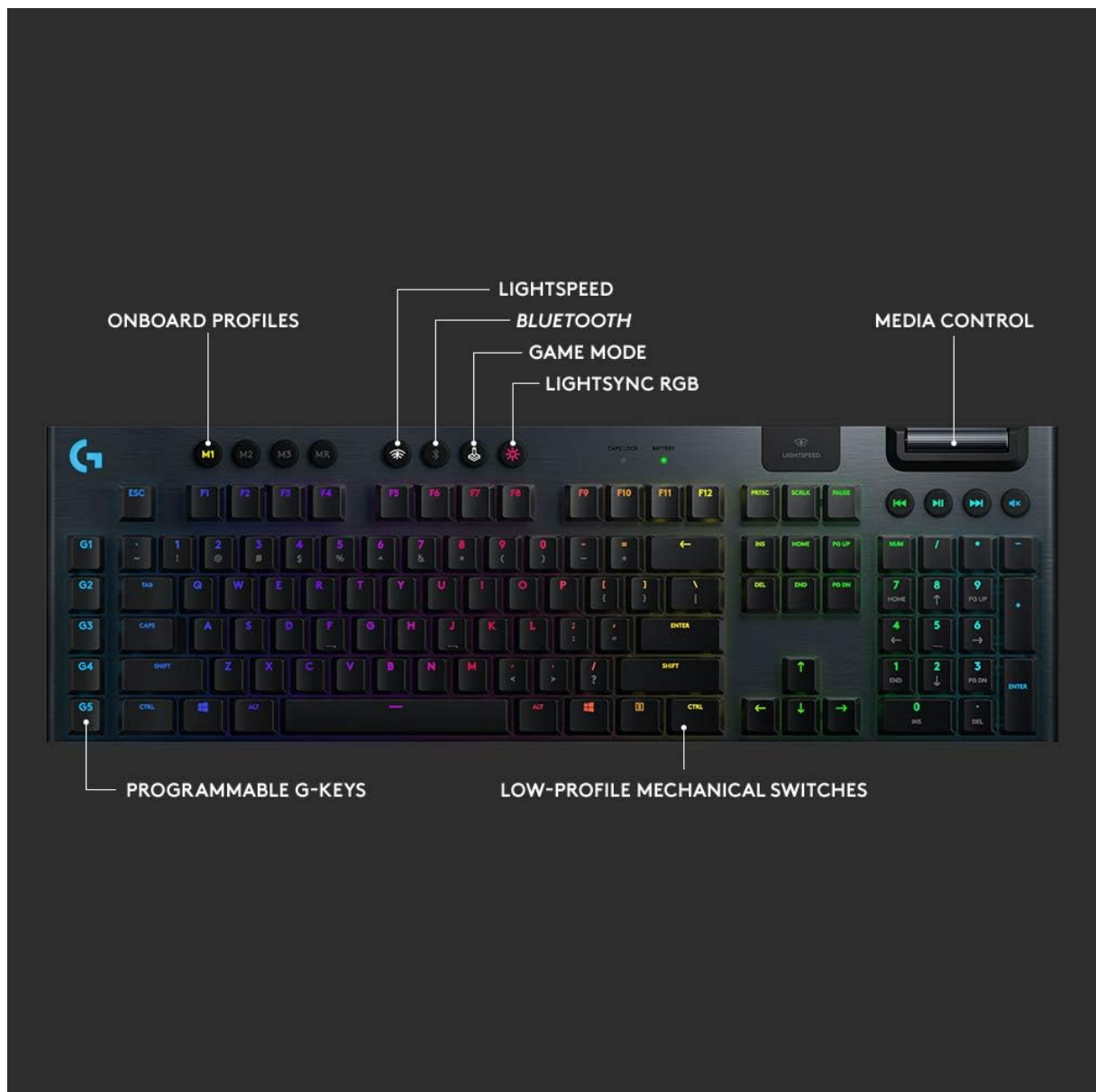
Image: Overview of the G915 keyboard highlighting onboard profiles, LIGHTSPEED/Bluetooth toggles, game mode, LIGHTSYNC RGB, media controls, programmable G-keys, and low-profile mechanical switches.