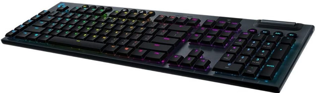
Image: The Logitech G915 LIGHTSPEED Wireless RGB Mechanical Gaming Keyboard, showcasing its full layout and RGB lighting.

The Logitech G915 LIGHTSPEED is a cutting-edge wireless mechanical gaming keyboard designed for high-performance gaming and productivity. It features low-profile GL mechanical switches, pro-grade 1 ms LIGHTSPEED wireless technology, and customizable LIGHTSYNC RGB lighting. Its ultra-thin yet durable design ensures a premium user experience. This manual provides essential information for setting up, operating, and maintaining your G915 keyboard.