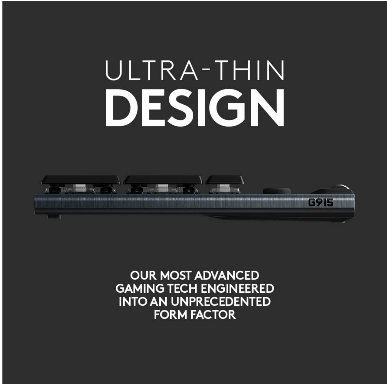
Image: Side profile of the Logitech G915, highlighting its ultra-thin design.

The G915 keyboard features an ultra-thin design, making it a sleek addition to any setup while minimizing desk space. It is crafted from aircraft-grade aluminum alloy for durability.