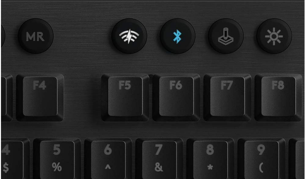
Image: Buttons for LIGHTSPEED and Bluetooth connectivity on the G915 keyboard.

CONNECT TO MULTIPLE DEVICES VIA PRO-GRADE LIGHTSPEED WIRELESS OR BLUETOOTH®