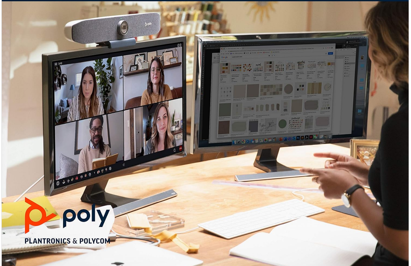
Image: The Poly Studio P15 integrated into a multi-monitor home office setup, demonstrating its use during a video conference. This shows the device's seamless integration into a professional workspace.