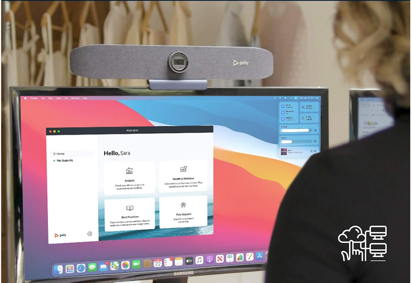
Image: A screenshot of the Poly Lens application, which allows users to manage device settings, view insights, and access support resources for their Poly devices, including the Studio P15.