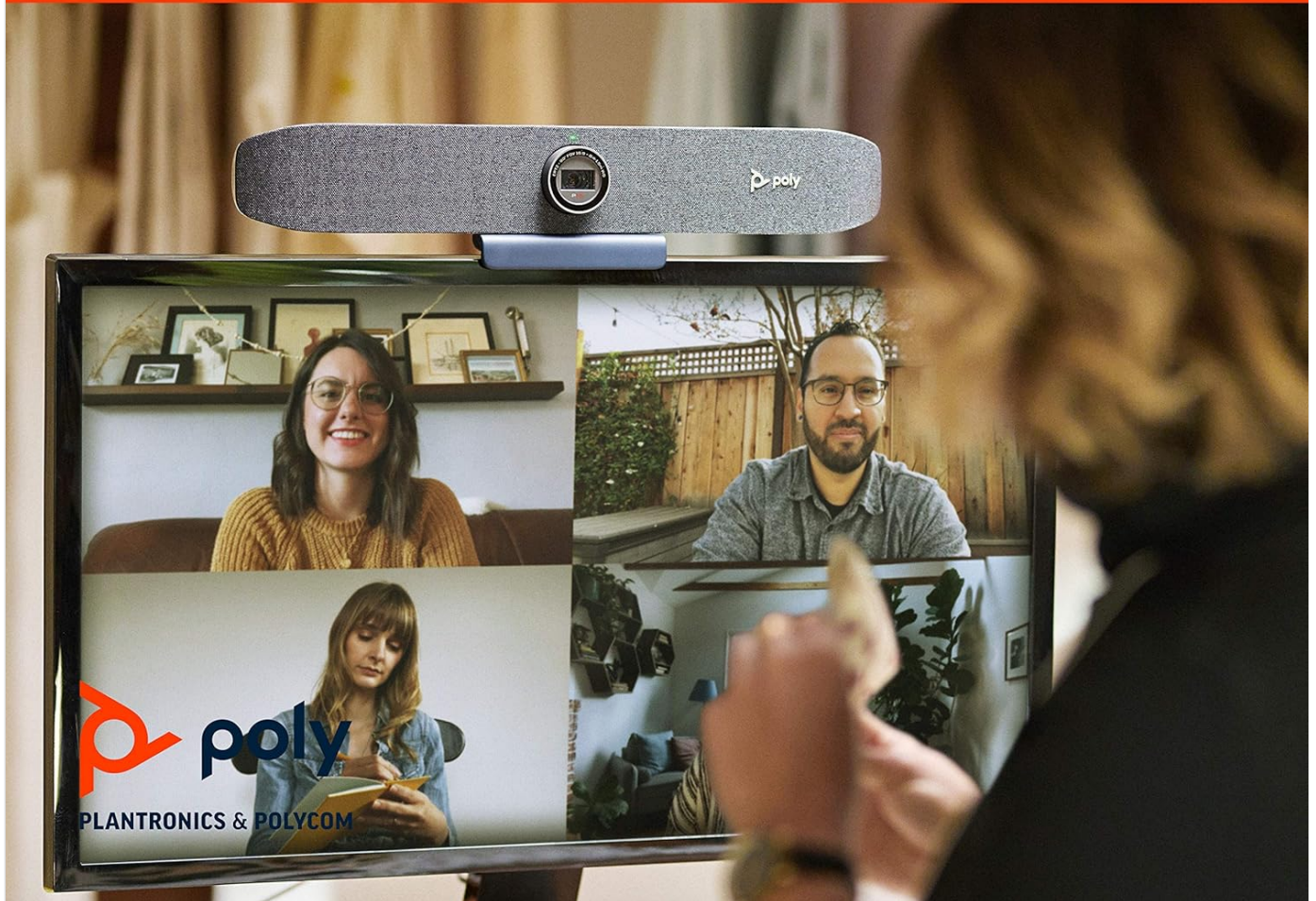
Image: The Poly Studio P15 mounted above a monitor, displaying a video conference with multiple participants. This illustrates the device's primary function as an all-in-one video conferencing solution.