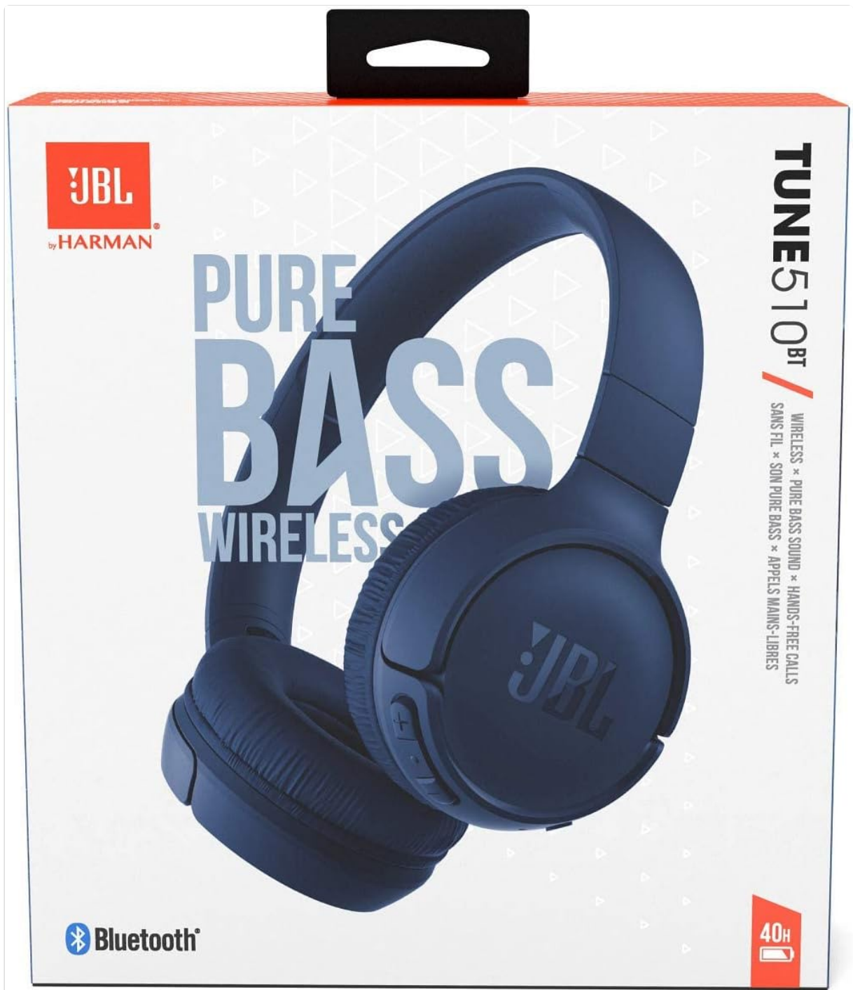
Image: The retail packaging for the JBL Tune 510BT headphones, highlighting its Pure Bass Wireless and Bluetooth features.