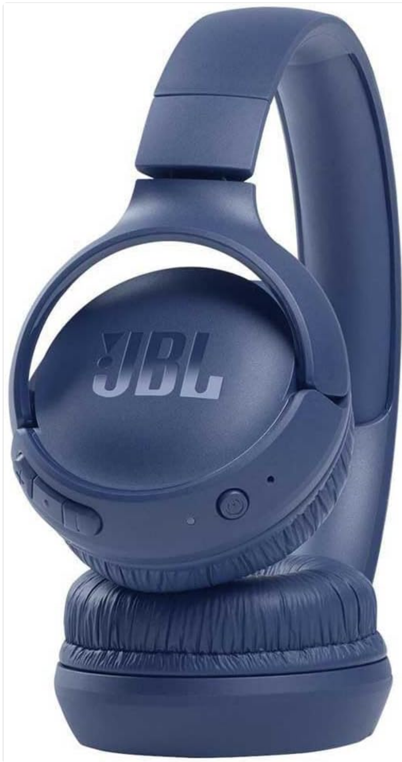
Image: A side view of the JBL Tune 510BT headphones, highlighting the control buttons located on the earcup.