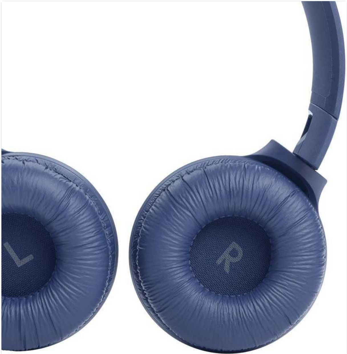
Image: A close-up view of the earcups, showing the soft cushioning and the 'L' and 'R' indicators for left and right ears.