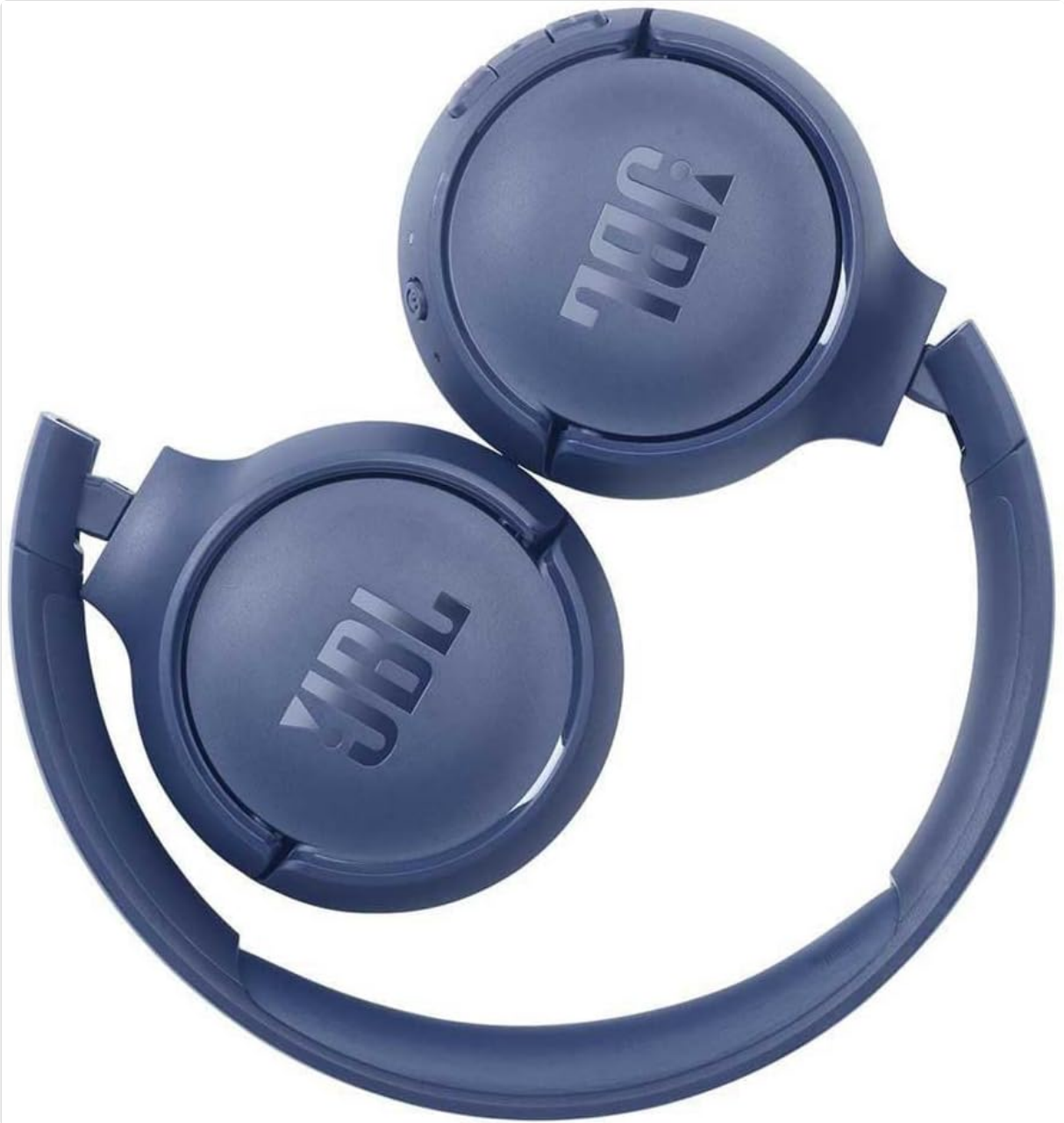
Image: The JBL Tune 510BT headphones in their folded configuration, demonstrating their compact design for easy portability.