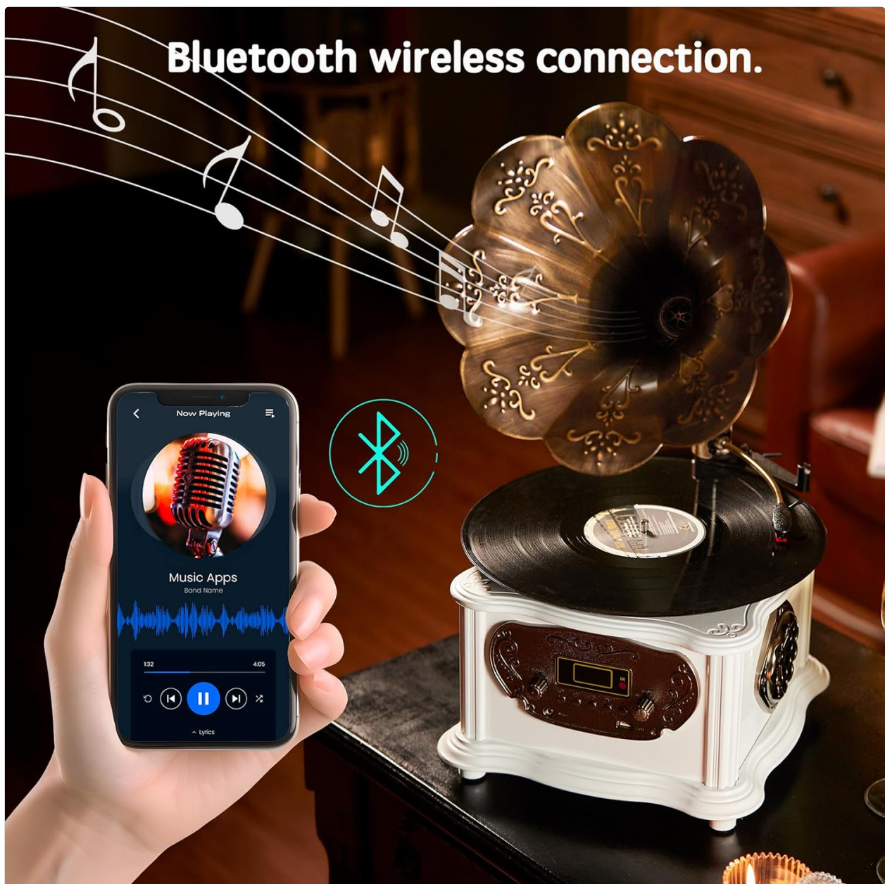
Image 4.1: Connecting a smartphone via Bluetooth to the phonograph.