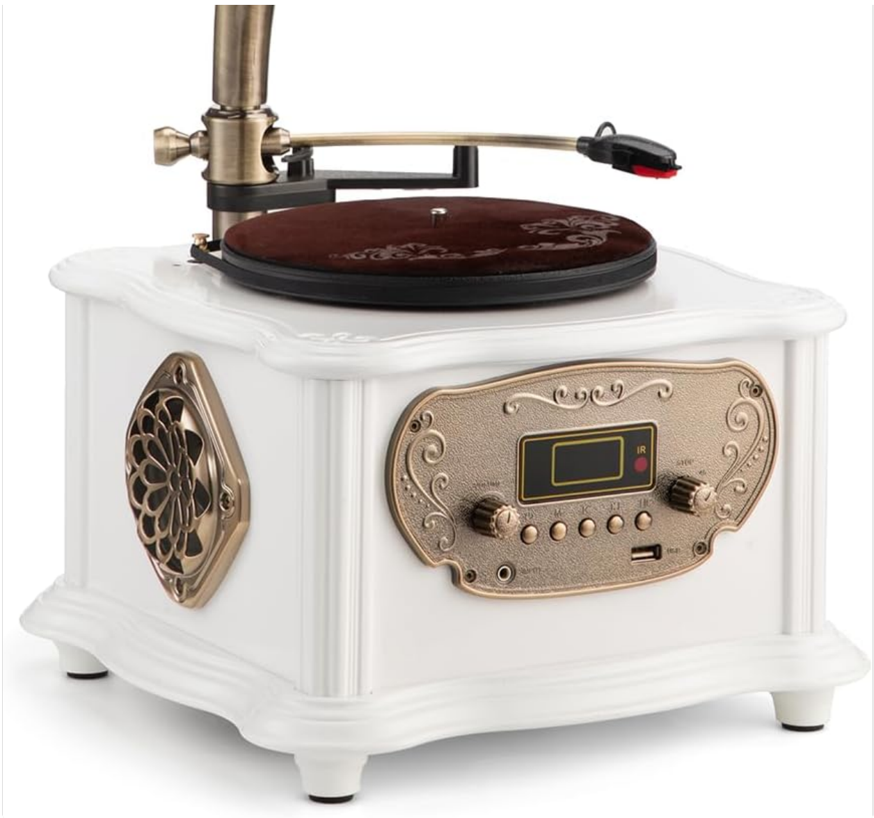
Image 1.1: The MEAGEAL VS1722W Retro Phonograph Record Player Bluetooth Speaker.