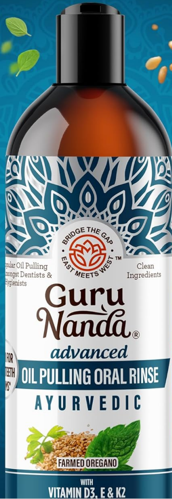
Image: Visual representation of the advanced blend, highlighting sesame and oregano for gum care.

Helps in maintaining a cleaner oral environment Makes flossing easier in tight spaces.