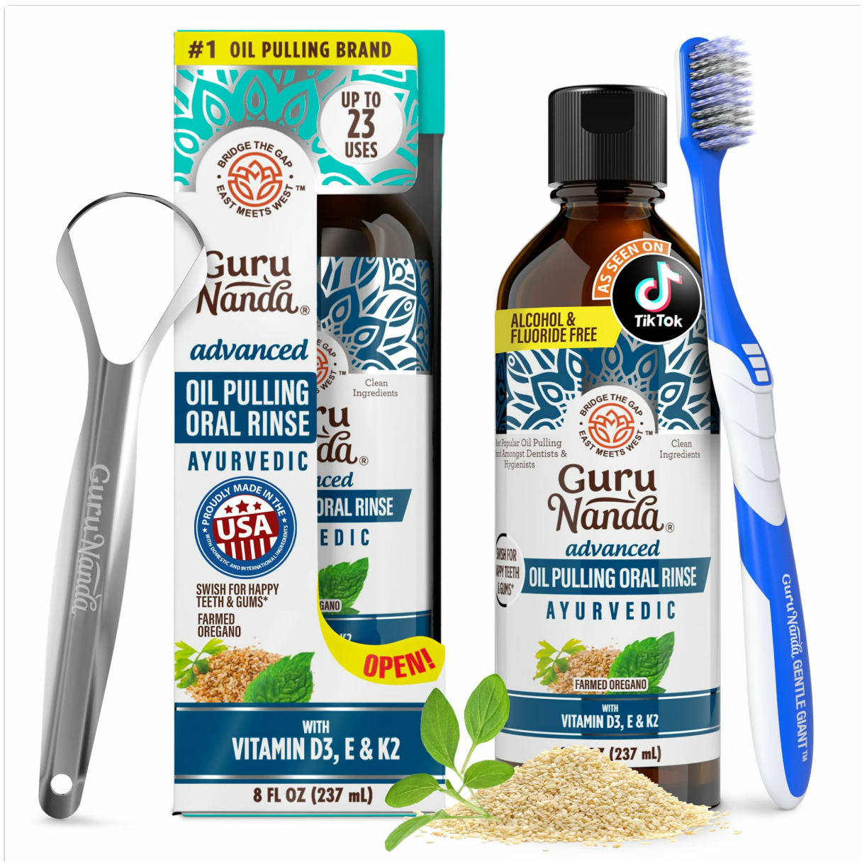
Image: GuruNanda Advanced Oil Pulling Mouthwash bottle, 8 fl oz, with included tongue scraper.