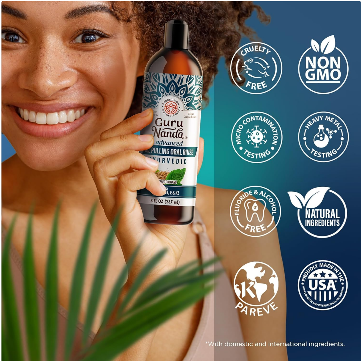
Image: Product claims and certifications, including Cruelty-Free, Non-GMO, and Made in USA.