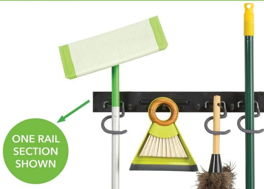
Figure 4: Example Usage. This image illustrates a single rail section in use, holding a broom, a mop, and a brush, demonstrating the rack's capacity for various household items.