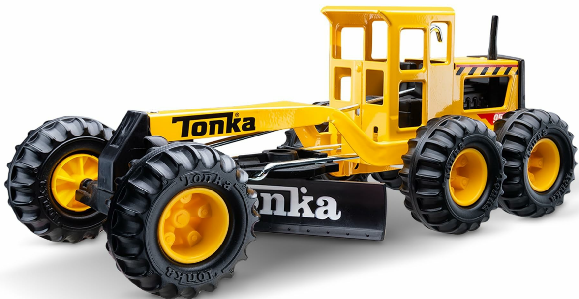
Image: Front-side view of the Tonka Steel Classics Road Grader, showcasing its yellow body and black wheels.