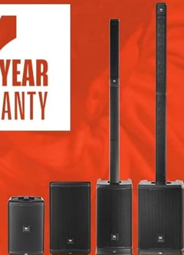
Figure 6: The 12-inch subwoofer of the JBL PRX ONE, providing powerful bass response.