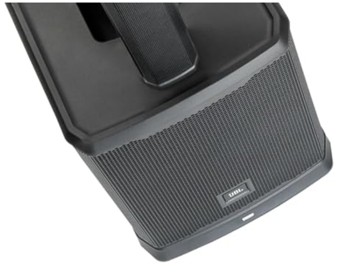
Figure 2: Inserting the column array into the subwoofer base.