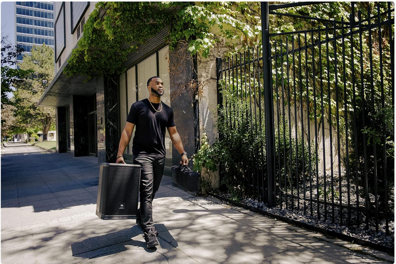
Figure 7: JBL PRX ONE highlighting its 7-year limited warranty.