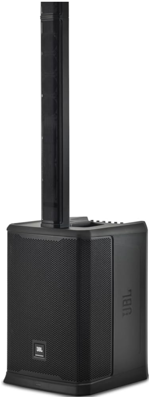
Figure 1: The JBL PRX ONE Powered Loudspeaker Line Array System, showcasing its complete assembled form.